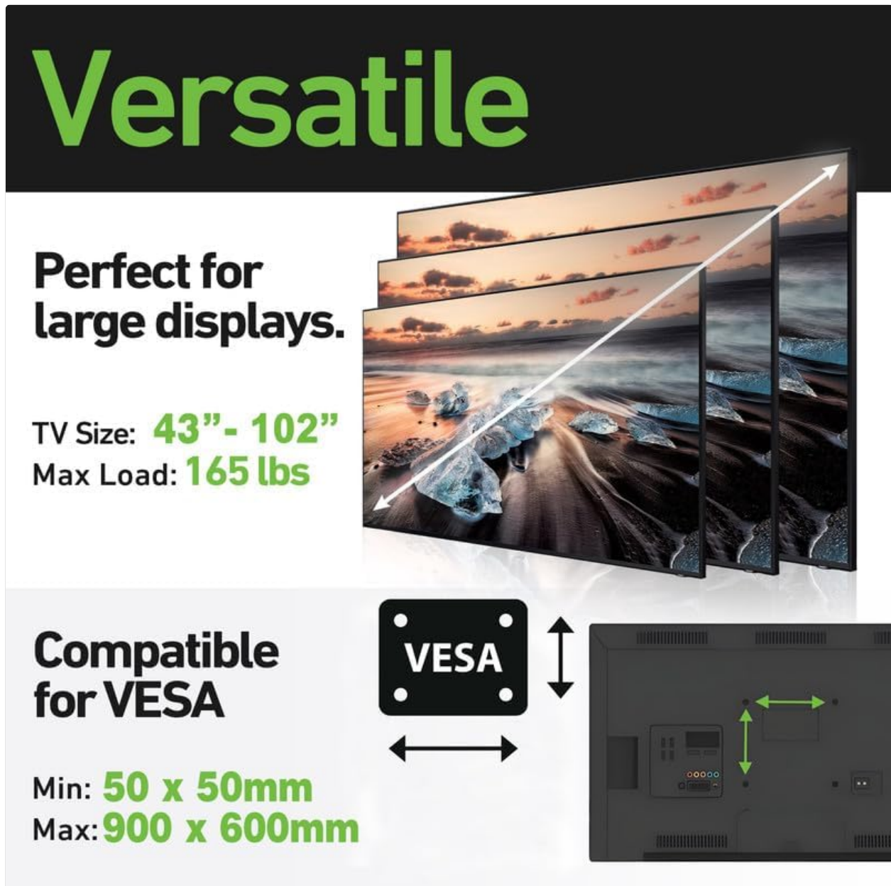
Image: Visual guide for TV size, maximum load capacity, and VESA mounting pattern compatibility.