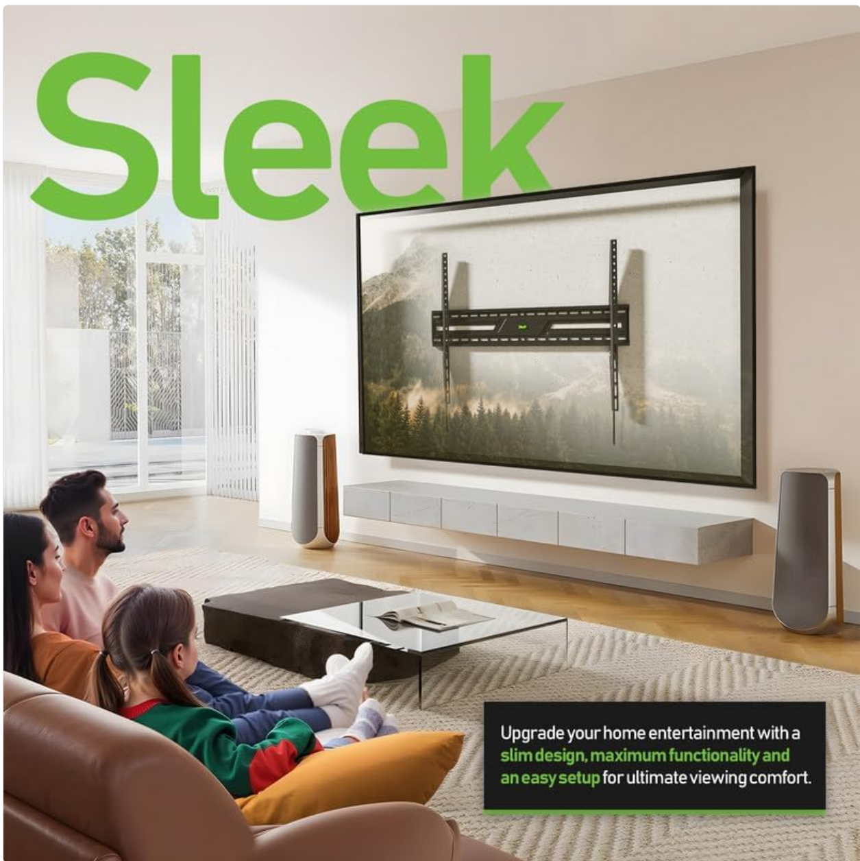
Image: The Stellar Mounts TV bracket installed, showcasing its low-profile design with a television.