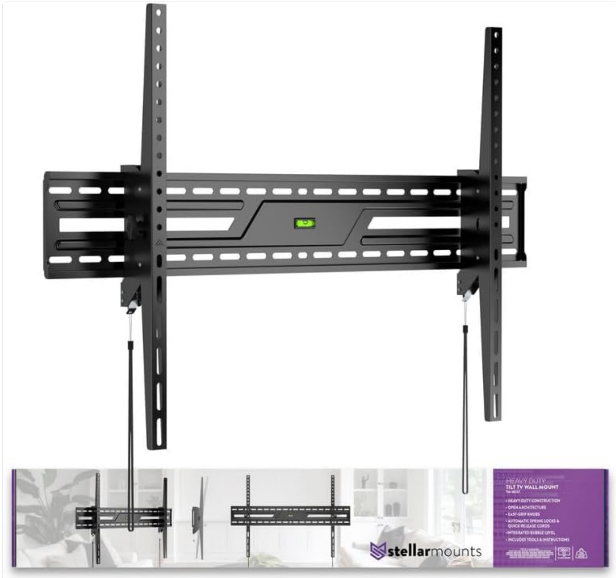
Image: Overview of the Stellar Mounts TV wall mount bracket components and retail packaging.