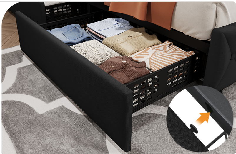
Illustration of the drawer fixture design, showing a small screw that aligns with a hole to prevent the drawers from accidentally slipping out of the bed frame.

Each drawer comes with a small screw, aligning with the hole to prevent from slipping out.