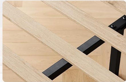
Durable Wooden Slats