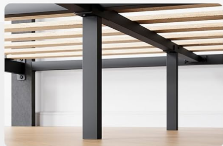
Strong and Durable Supporting System

Visual details of the bed frame's construction, including the upholstered headboard, durable wooden slats, EVA sponge strips for noise reduction, and the strong supporting system.