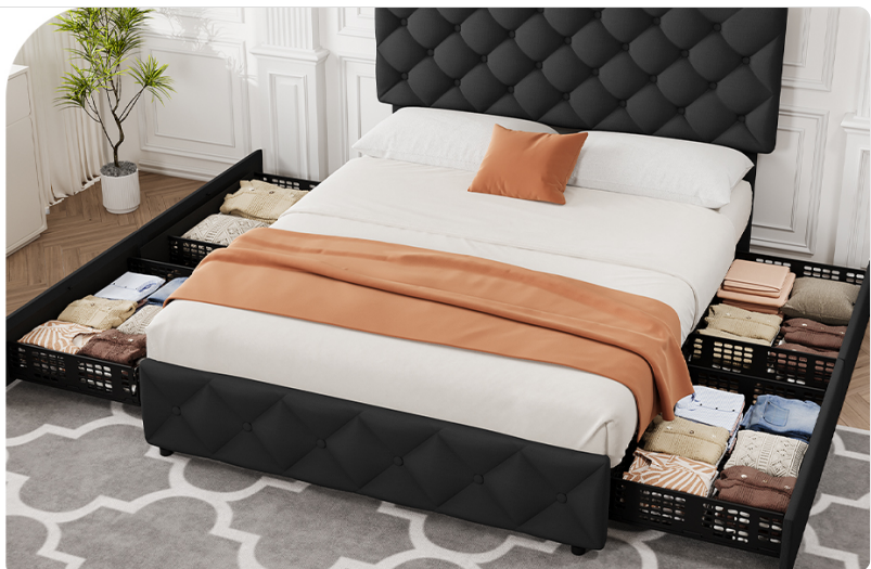
Image detailing the four storage drawers, each measuring 27.6 inches L x 19.7 inches W x 5.5 inches H, designed to provide ample storage for bedding and clothing.

Our bed frame features four 27.6"Lx19.7"Wx5.5"H drawers, providing ample storage for bedding and clothing.