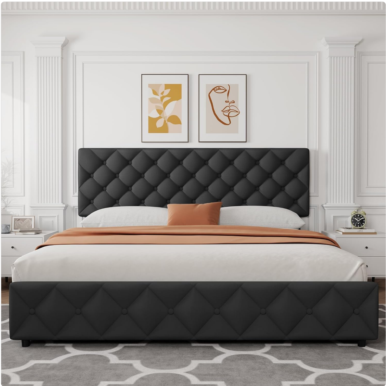
A front view of the fully assembled GarveeHome King Size Bed Frame, highlighting the diamond-stitched button-tufted headboard and footboard design.