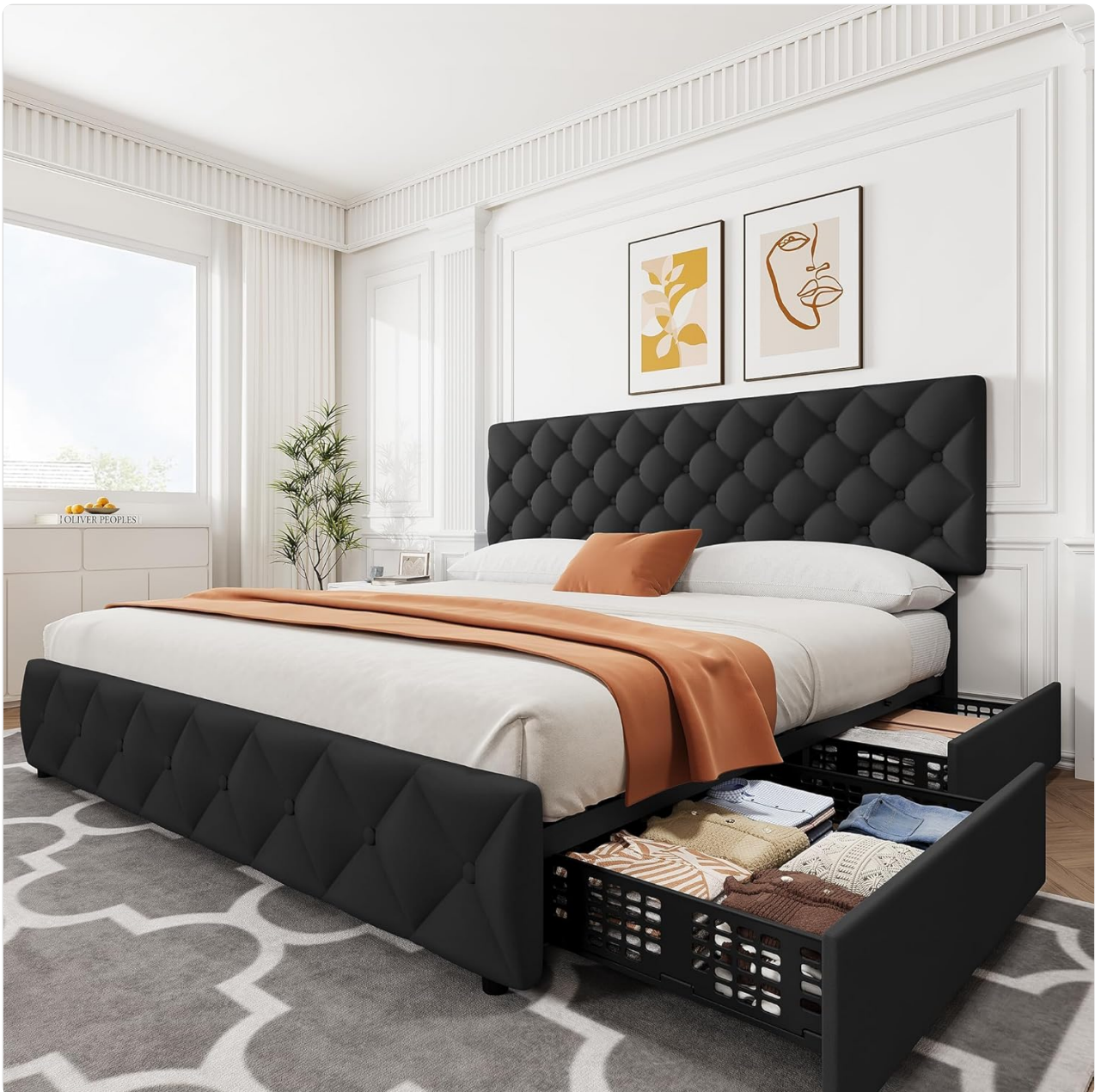
The GarveeHome King Size Bed Frame, featuring a black linen upholstered headboard and footboard, with one of the four integrated storage drawers pulled out to display its capacity.