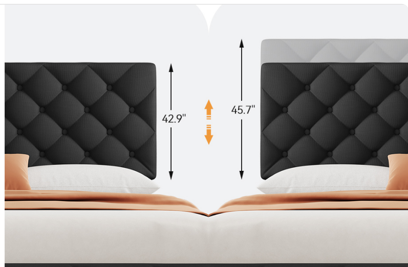
Diagram illustrating the adjustable headboard feature, showing how its height can be set between 42.9 inches and 45.7 inches to accommodate mattresses from 6 to 12 inches thick.

You can adjust the headboard of bed frame from 42.9" to 45.7" high to fit for 6-12 inches mattresses.