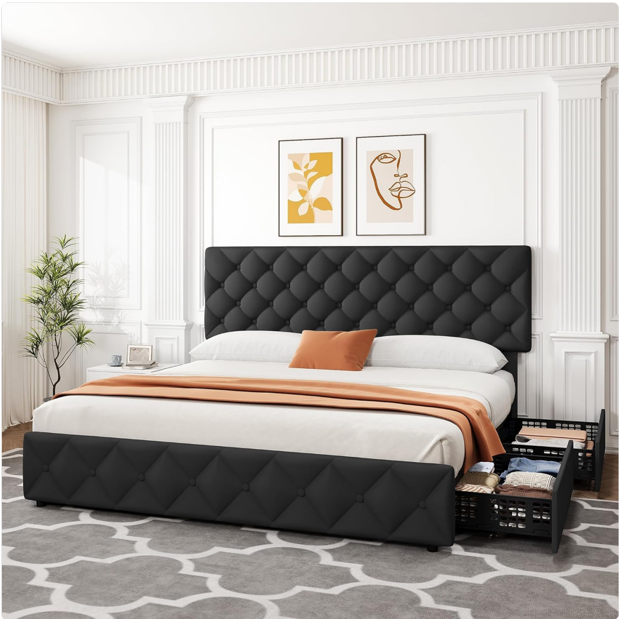
An angled view of the GarveeHome King Size Bed Frame, showing two of the storage drawers partially open, illustrating their accessibility and integration into the bed design.