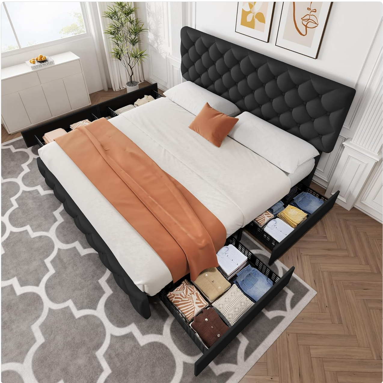
An overhead view of the GarveeHome King Size Bed Frame, showcasing all four under-bed storage drawers fully extended and filled with various items, highlighting the ample storage space.