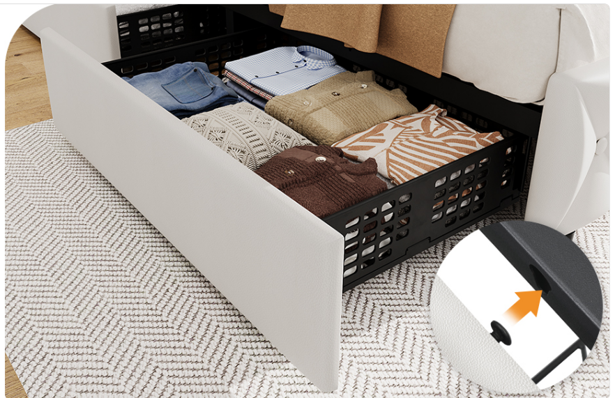
Image: The bed frame with all four storage drawers extended, demonstrating their capacity for storing items like clothing and bedding.

Each drawer comes with a small screw, aligning with the hole to prevent from slipping out.