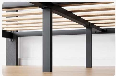
Strong and Durable Supporting System

Image: Detail of the bed frame's internal structure, showing durable wooden slats, a strong supporting system, and EVA sponge strips designed to reduce noise.