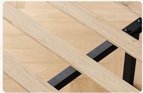
Durable Wooden Slats