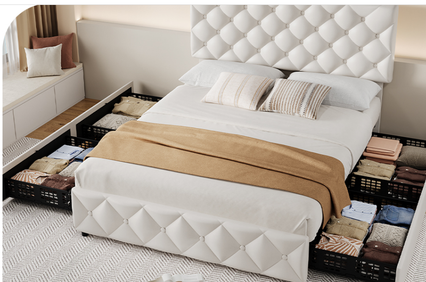
Image: Visual representation of the adjustable headboard, showing its minimum and maximum height settings.

Our bed frame features four 27.6"Lx19.7"Wx5.5"H drawers, providing ample storage for bedding and clothing.