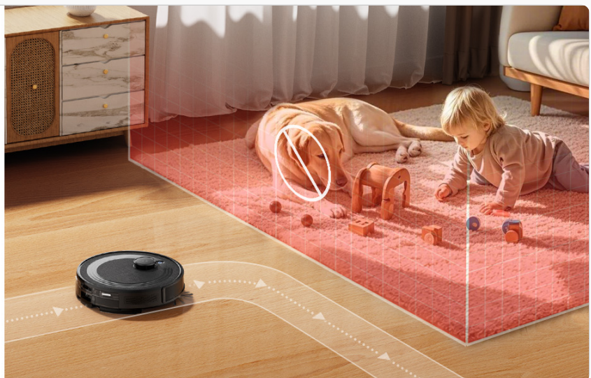
Image: A visual summary of the Lefant app's control features, including scheduled cleaning, custom routines, do-not-disturb mode, no-go zones, smart mapping, zone cleaning, water flow adjustment, and one-touch cleaning.