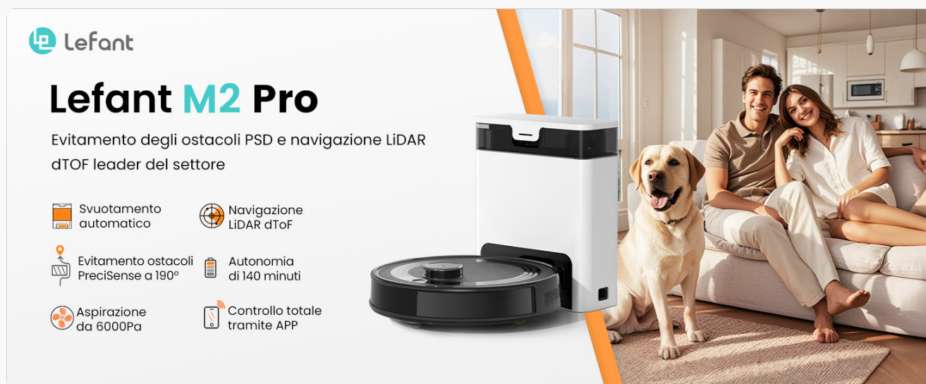
Image: The LEFANT M2 Pro robot vacuum docked at its automatic emptying station, illustrating the 90-day hands-free cleaning feature and showing the dust bag and direct emptying options.

The M2 Pro's automatic emptying station collects dust for up to 90 days, minimizing manual intervention. The station uses 2.5L dust bags for hygienic disposal.