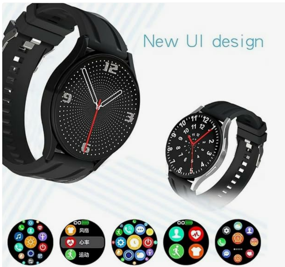
Image: The GT1 Smart Watch displaying its new user interface design, featuring multiple app icons for functions like heart rate monitoring, activity tracking, and various customizable watch faces.