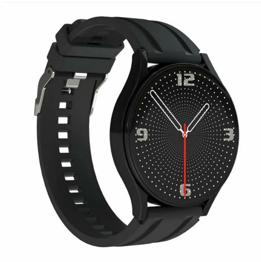
Image: The Generic GT1 Smart Fitness Watch, featuring a black strap and a digital analog-style watch face with white dots and red second hand.

This manual provides detailed instructions for the setup, operation, maintenance, and troubleshooting of your Generic GT1 1.8" Touch Screen Smart Fitness Watch. Please read this manual thoroughly before using the device to ensure proper functionality and to maximize your user experience.