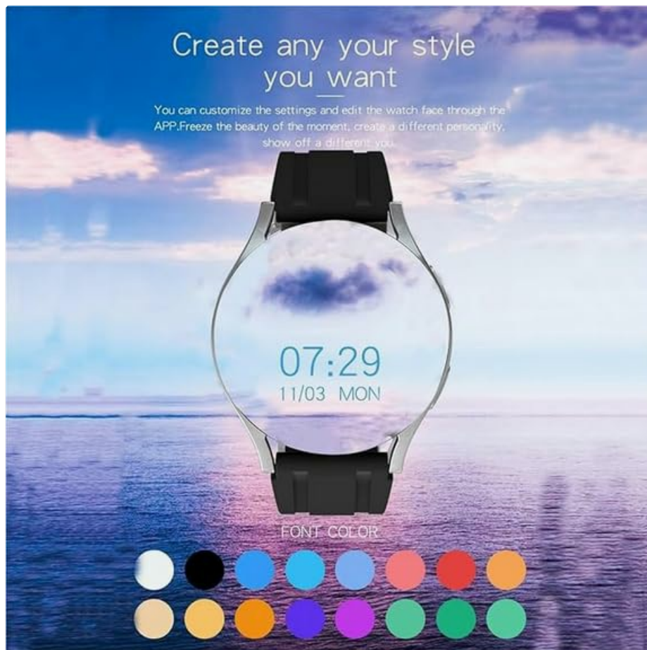
Image: The GT1 Smart Watch displaying a customizable watch face with the current time and date, overlaid on a scenic background, demonstrating personalization options.