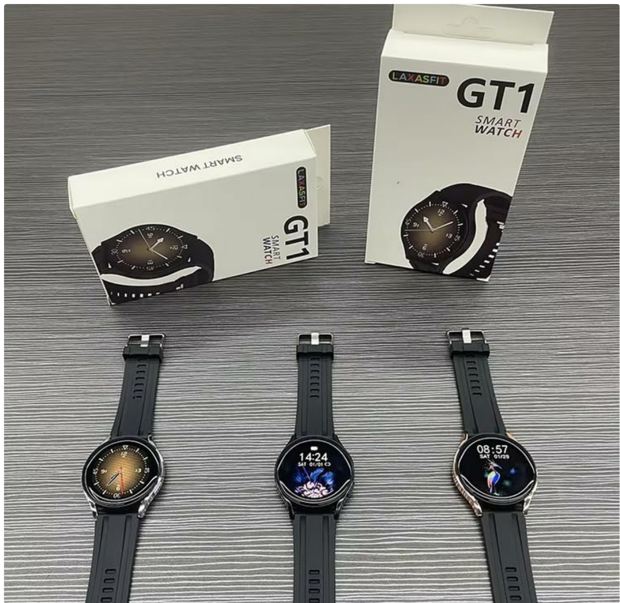
Image: Several GT1 Smart Watches displayed alongside their retail packaging, showing the product and its boxing.