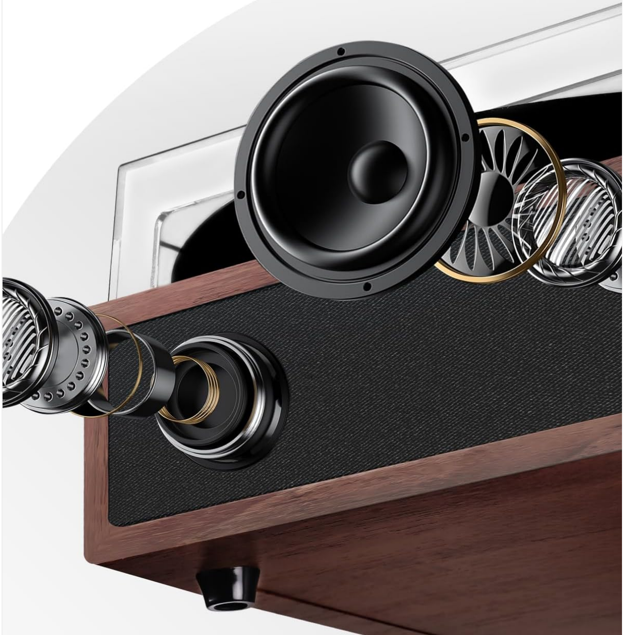
Image: An exploded diagram illustrating the internal structure of the integrated stereo speakers, highlighting the HiFi sound components.

Built-in 2 stereo speakers, enjoy the real vinyl sound.