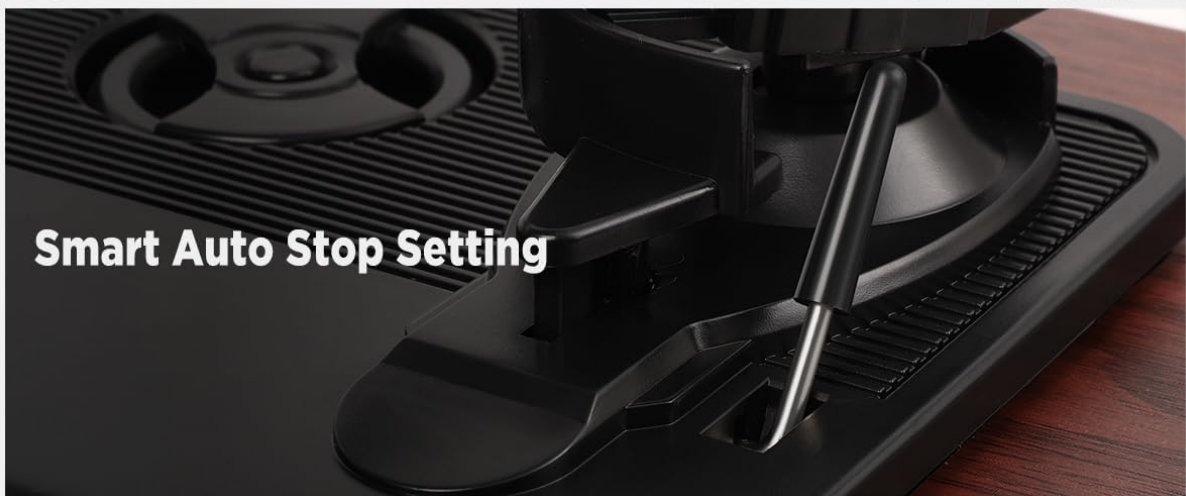
Image: Detailed views of the belt drive system, the ultra-stable metal tonearm, and the smart auto-stop setting.