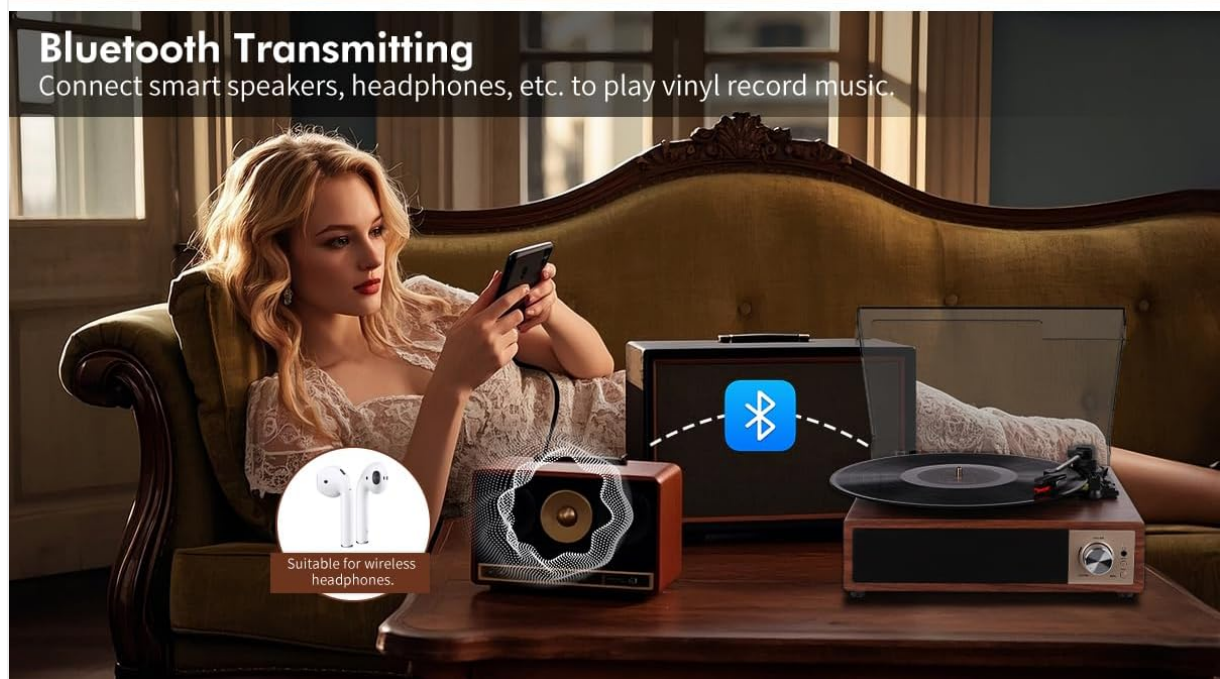
Image: Two scenarios demonstrating Bluetooth 5.4 functionality: a user receiving music from a smartphone to the turntable, and the turntable transmitting vinyl audio to external Bluetooth speakers and headphones.