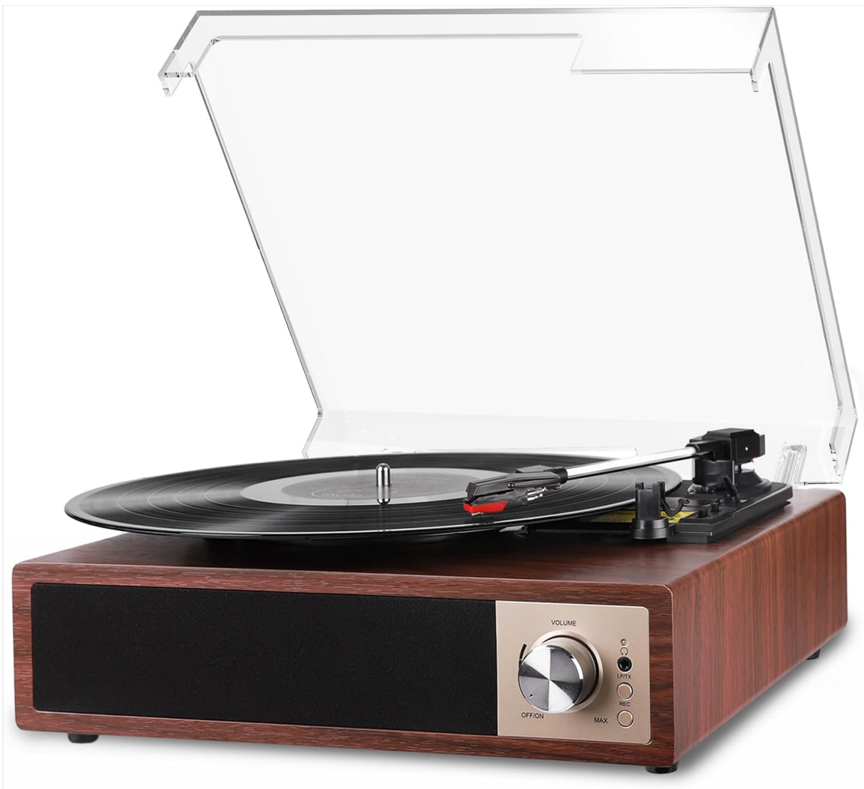
Image: The VIFLYKOO Bluetooth 5.4 Turntable, showcasing its mahogany finish and classic design.