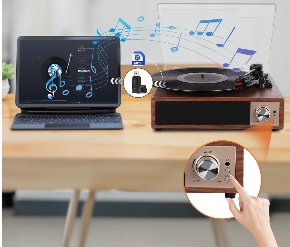
Image: The turntable with a USB drive inserted, illustrating the process of recording vinyl to digital files (MP3 or WAV) and playing music files from the USB drive.

After inserting a USB drive, the USB mode is turned on, you can record your precious vinyl record music, or play the music files in the USB.