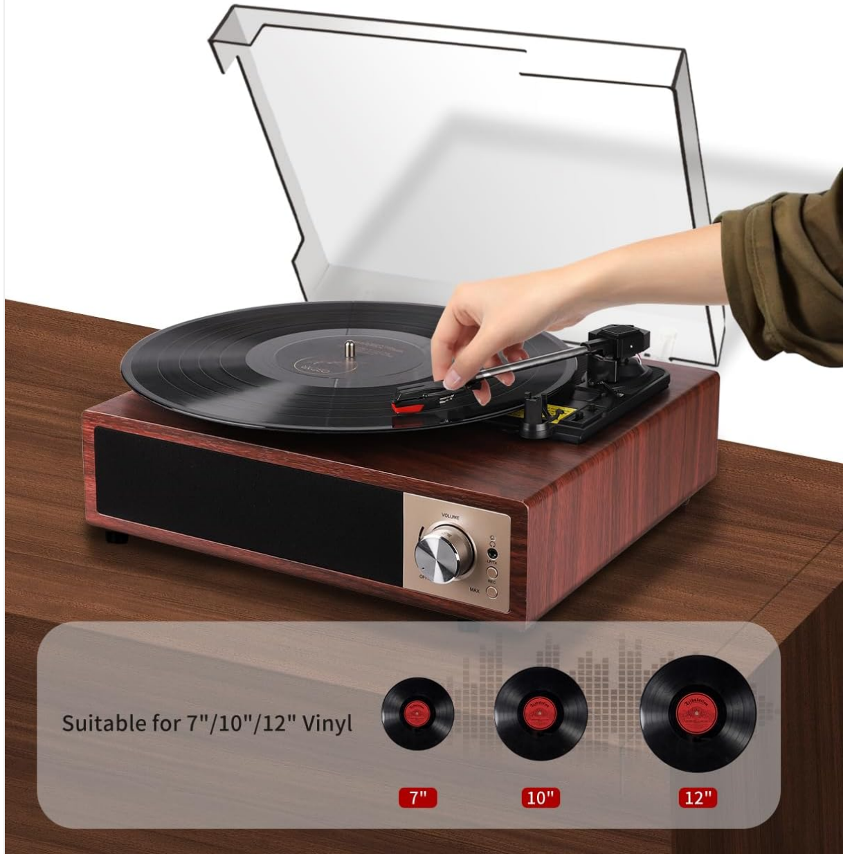
Image: A hand placing a record on the turntable, with visual representations of 7-inch, 10-inch, and 12-inch vinyl records, indicating support for all three sizes and 33/45/78 RPM speeds.