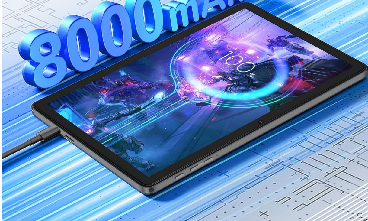
Image: YLEEBG P60 Tablet being charged.