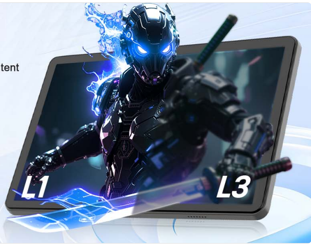
Image: Visual representation of the tablet's large memory and expandable storage.