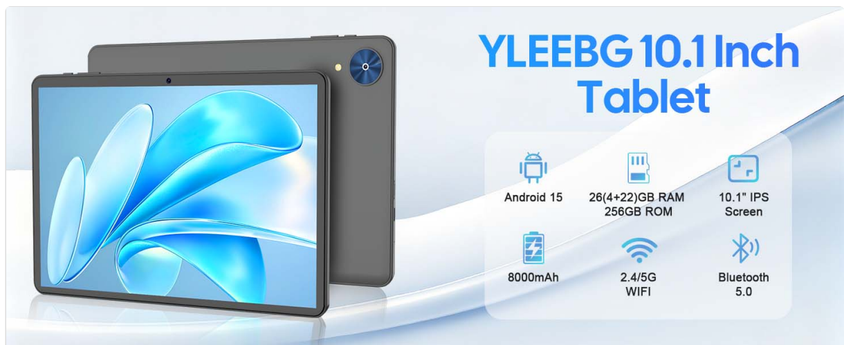
Image: Tablet displaying Widevine L1 certification for HD streaming.

The YLEEBG P60 supports Widevine L1, allowing you to stream high-definition content from popular platforms like Netflix, YouTube, Hulu, and Prime Video. This ensures a clear and immersive viewing experience.