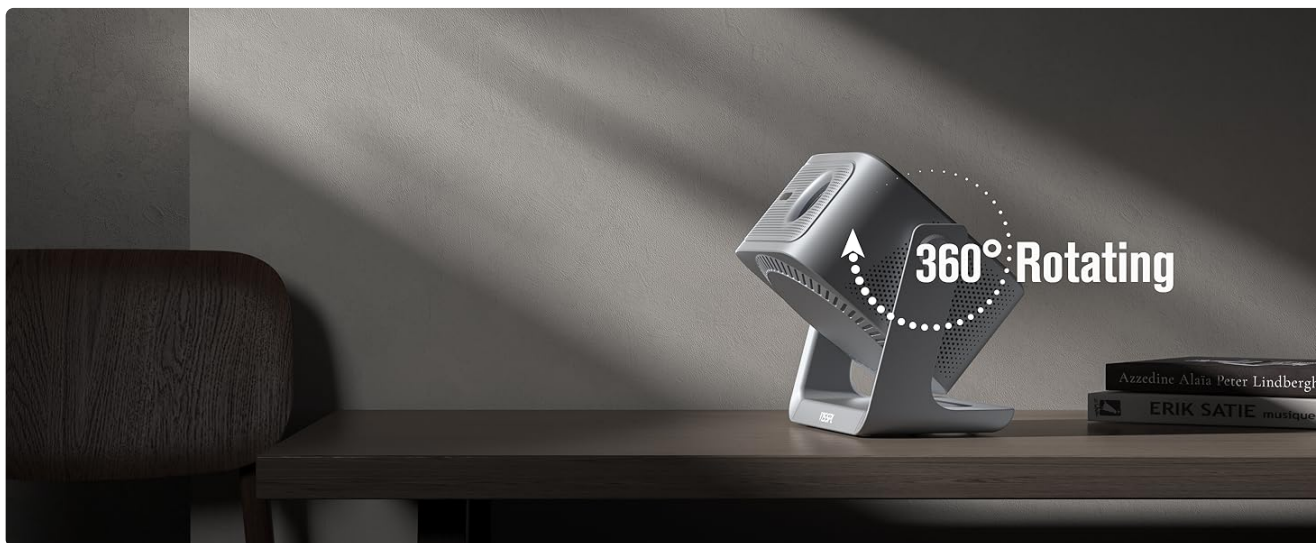
Image: The VISSPL A5 Projector demonstrating its 360° rotating stand for flexible projection angles.

Position the projector on a stable, flat surface. The 360° adjustable bracket allows for versatile placement, including tabletop, floor, or ceiling projection. Ensure there are no obstructions in front of the lens.