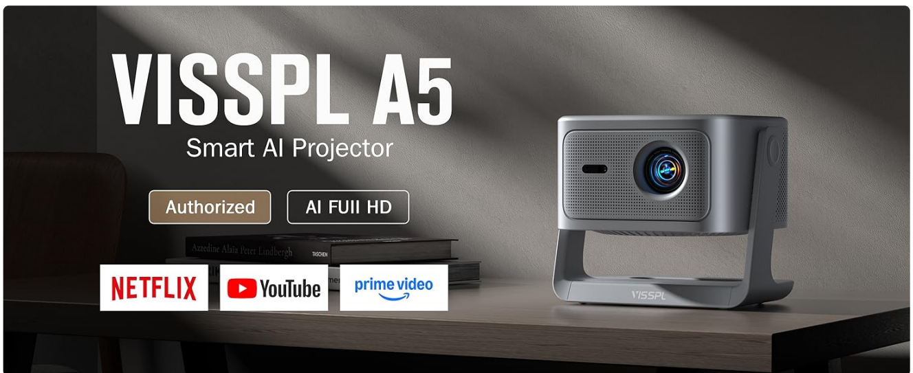
Image: The VISSPL A5 Smart AI Projector, a compact device designed for home theater use.

This manual provides detailed instructions for the safe and efficient operation of your VISSPL A5 Smart 4K Projector. Please read this manual thoroughly before using the product and retain it for future reference.