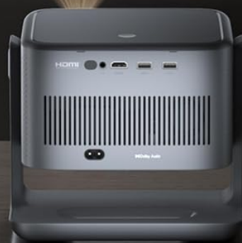
Image: Rear view of the VISSPL A5 Projector showing the HDMI, USB, and audio jack ports for various connections.