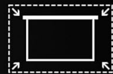
Auto Screen Fit