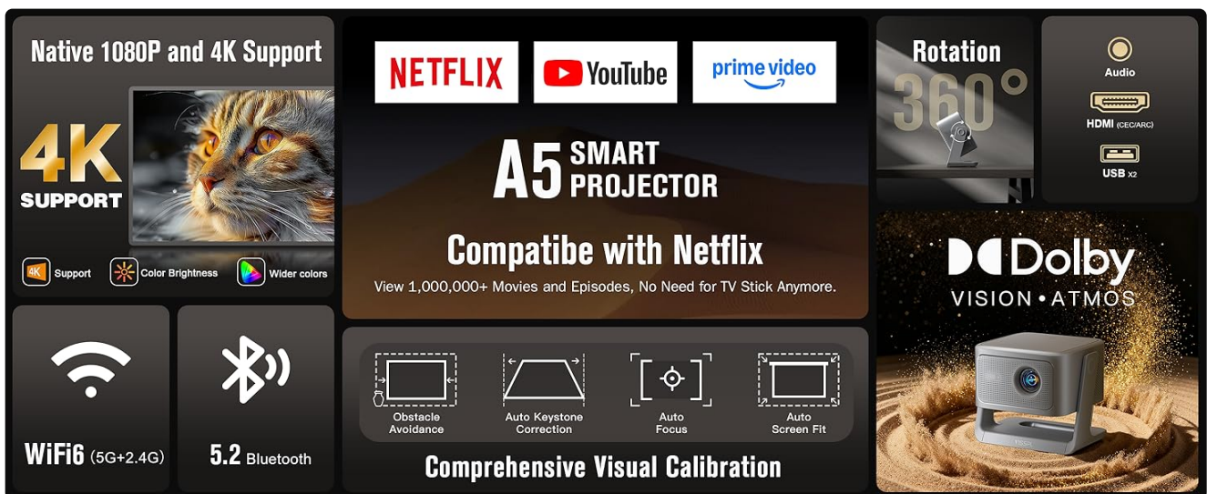
Image: The VISSPL A5 Projector displaying the Netflix interface, highlighting its compatibility with streaming services.