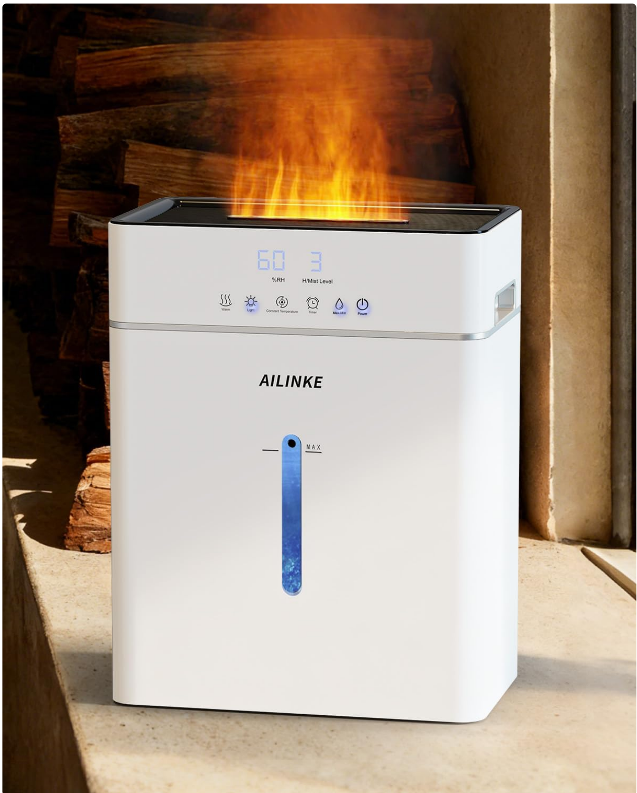
Image: AILINKE KC-MH-2109 Humidifier displaying its control panel and simulated flame mist effect.