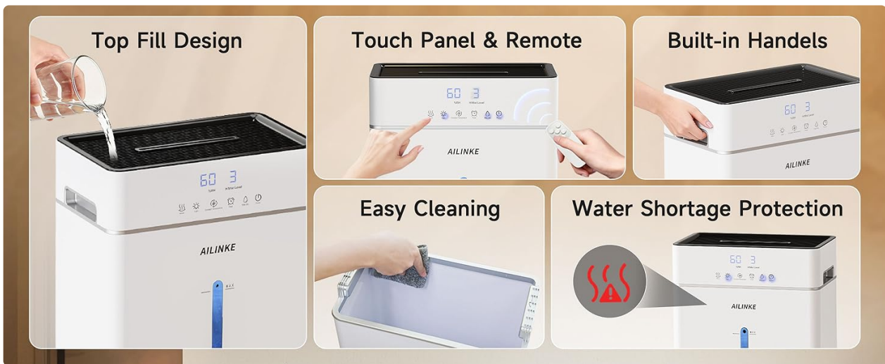
Image: Illustration of the humidifier's top-fill design, touch panel, remote control, built-in handles, easy cleaning, and water shortage protection features.