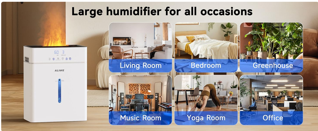
Image: Humidifier demonstrating smart humidity control, allowing users to set desired humidity levels (45-95%) for different needs like instruments, plants, babies, or pets.