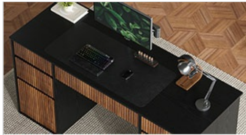
Super large desktop The desktop length is 58 inches, providing extra large desktop space.

An overhead view showcasing the super large 58-inch desktop, providing extensive space for a laptop, monitor, and other office items.