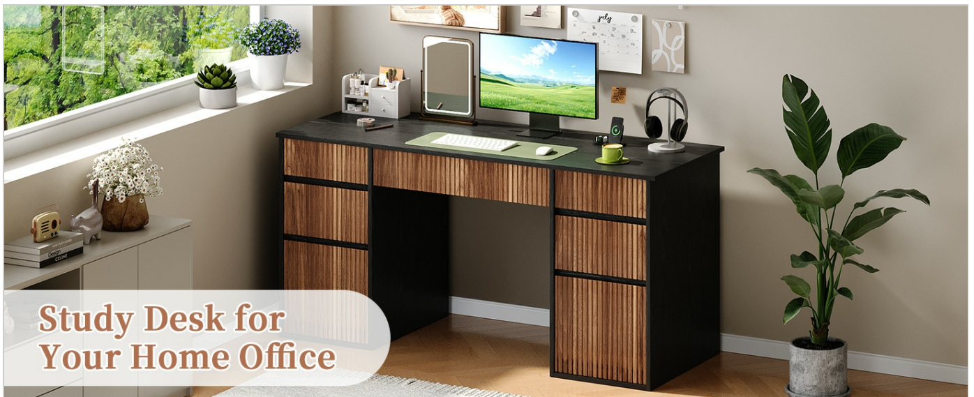
Study Desk for Your Home Office

Detailed dimensions of the 4 EVER WINNER 58-inch Executive Office Desk, including overall desk size and individual drawer