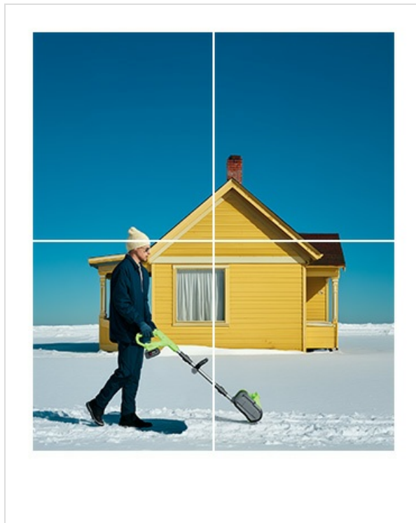
Figure 5: The directional plate can be adjusted to control the snow throwing direction.