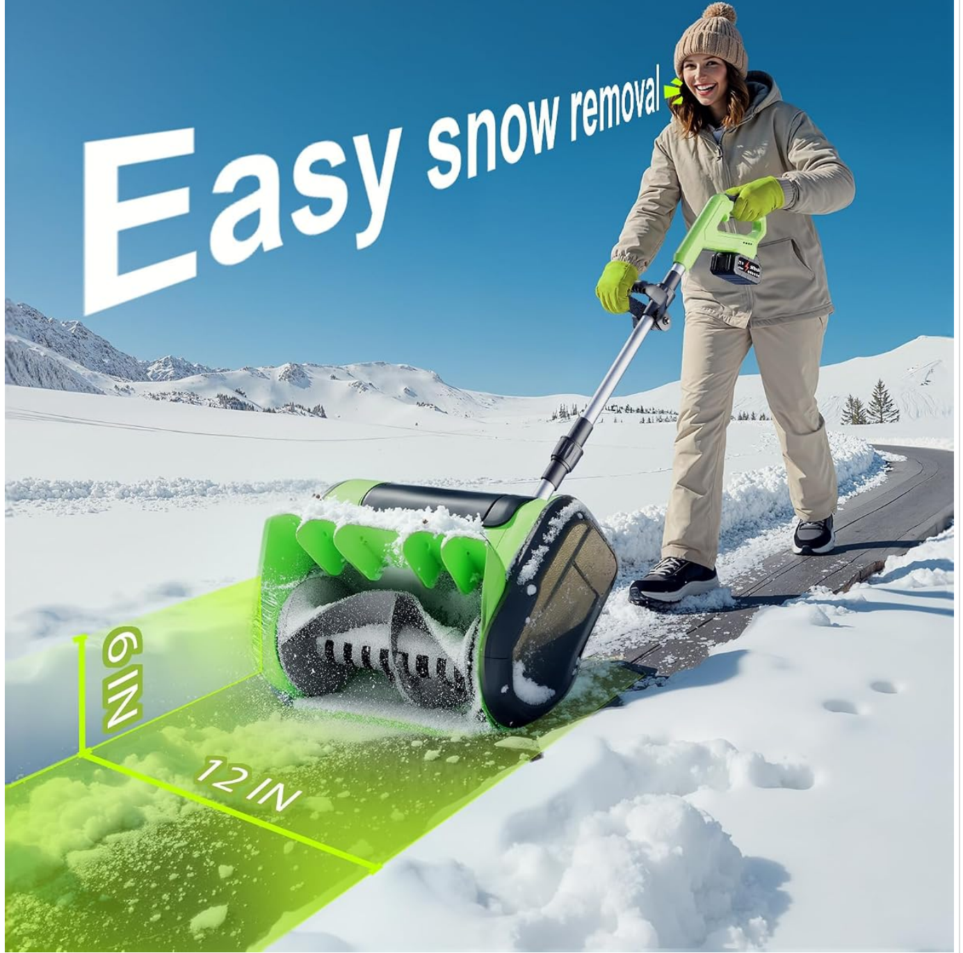
Figure 6: The snow shovel efficiently clears a 12-inch wide path through snow.

Your browser does not support the video tag.