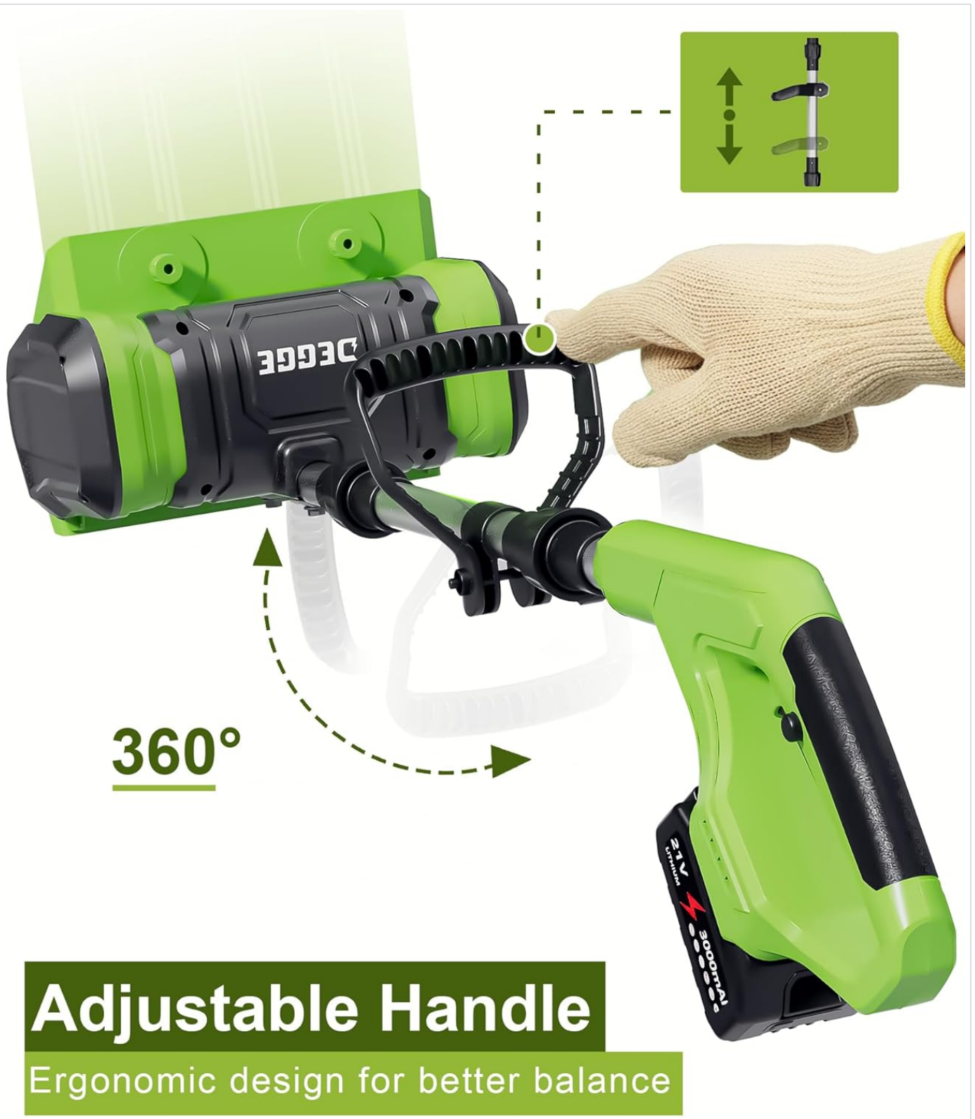
Figure 2: The adjustable front handle can be positioned for optimal comfort and balance.