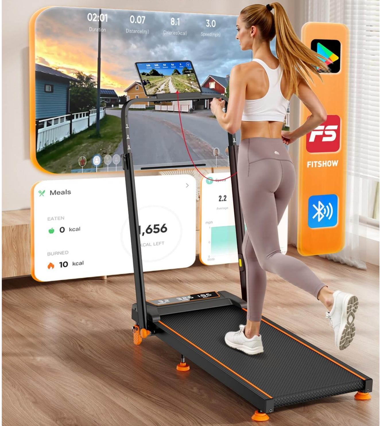
Image: Easy movement and storage of the Trisomy Walking Pad Treadmill.