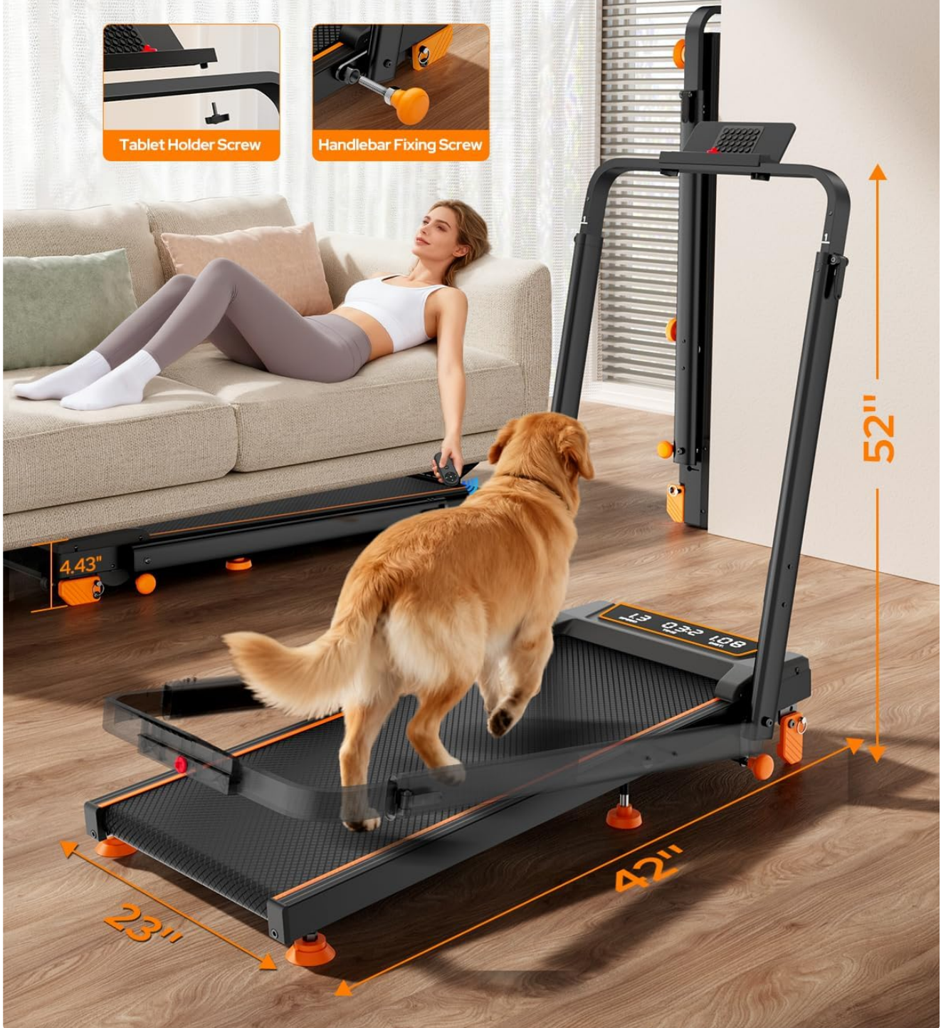
Image: Quick folding and tool-free assembly, highlighting the tablet holder screw and handlebar fixing screw.