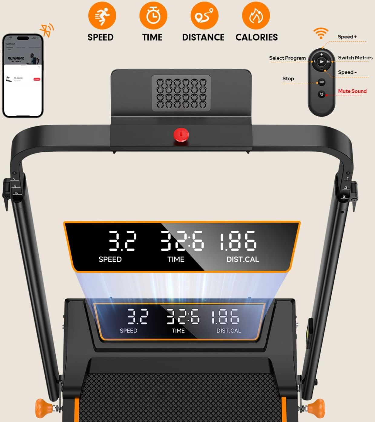
Image: LED display and remote control for easy workout management.

Show your running data clearly, keep workouts effective