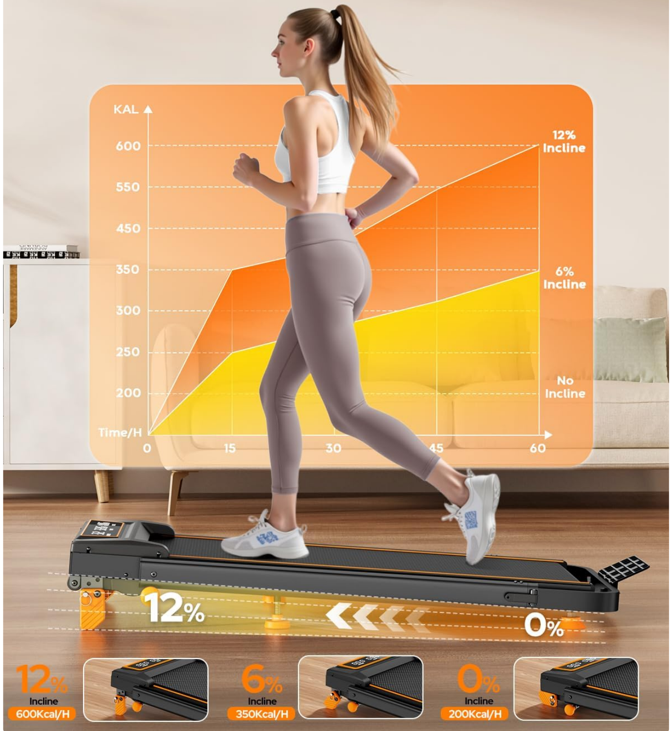
Image: Manual incline settings for enhanced calorie burn.

Easy access to the incline function without the use of any tools