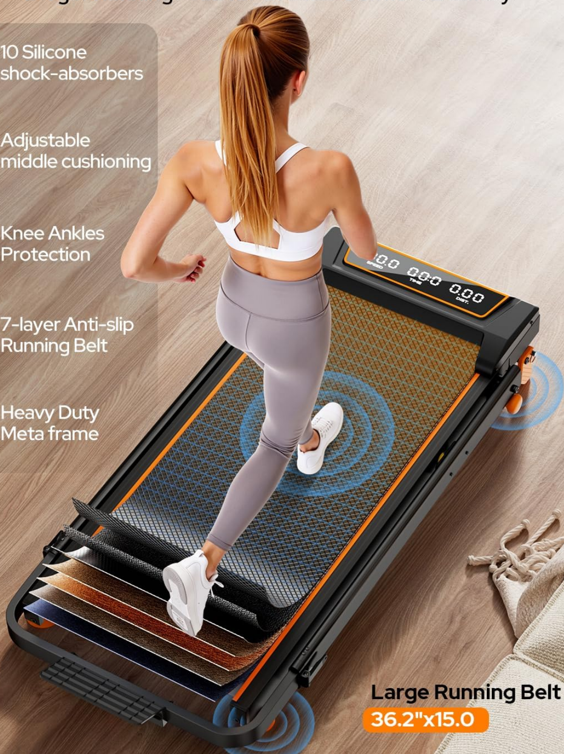
Image: Advanced shock absorption system for joint protection.