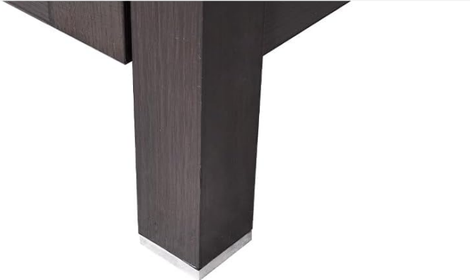
Image: Close-up of SOLIDEE vanity features including zinc alloy handle, 304 stainless steel hinge, and alloy leg pads.