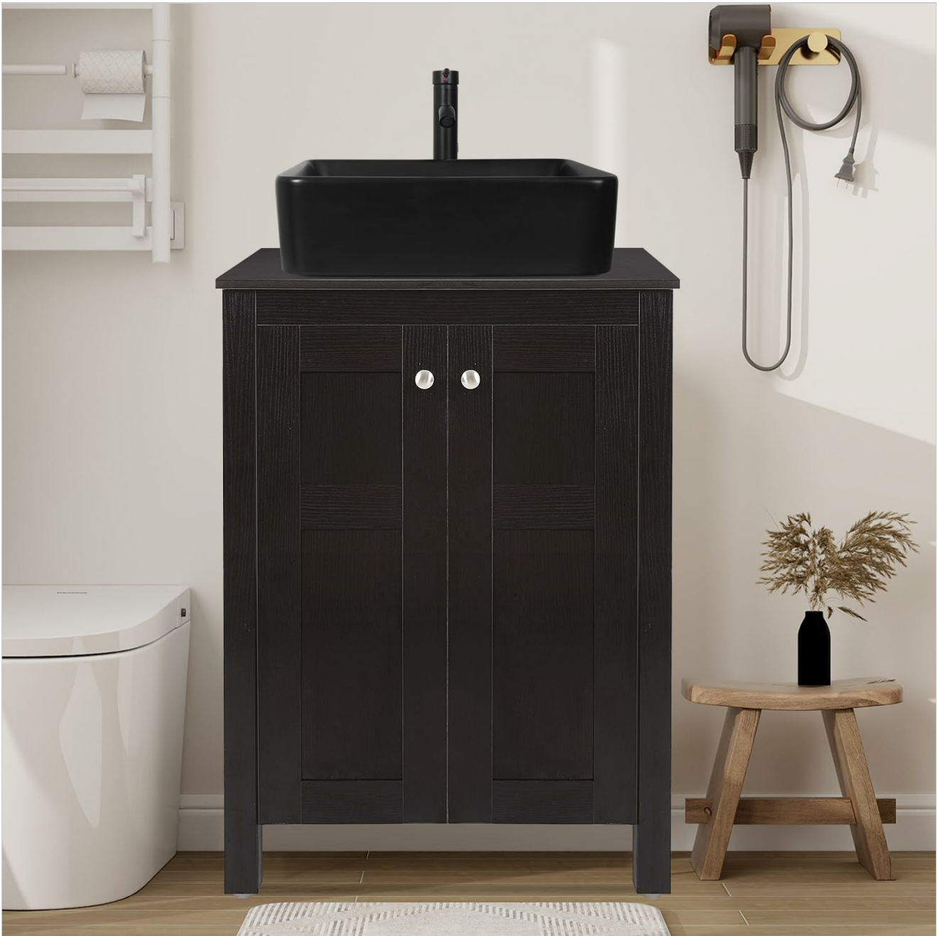
Image: Complete SOLIDEE 24-inch dark brown bathroom vanity with black ceramic sink and faucet.