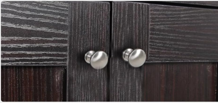
Zinc Alloy Handle