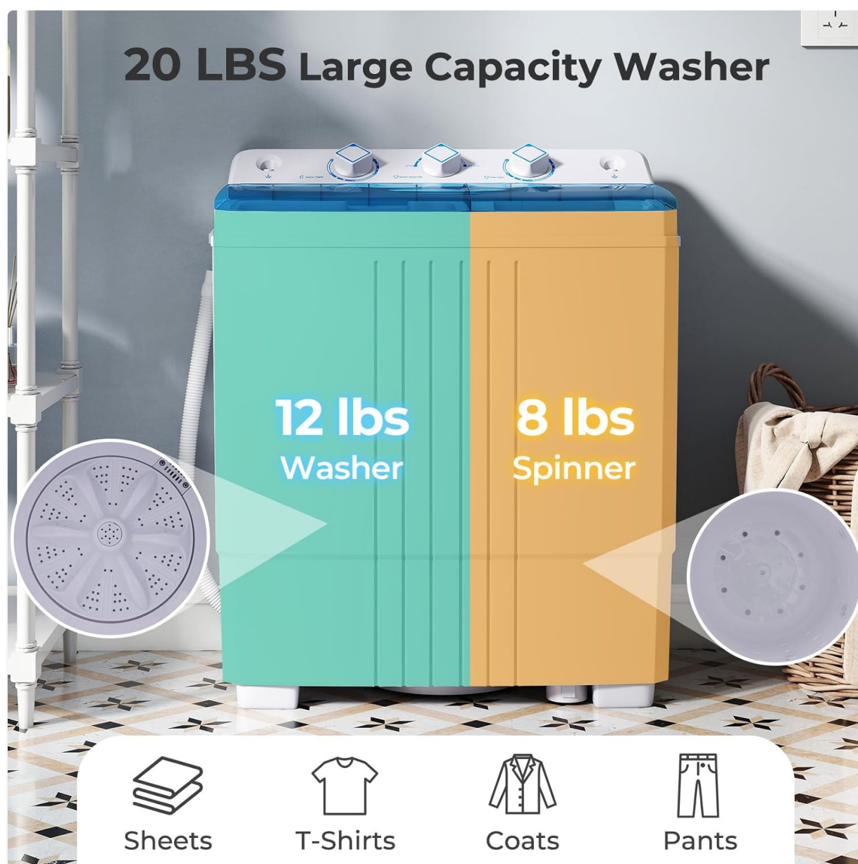
Image: Visual representation of the washing and spinning capacities.