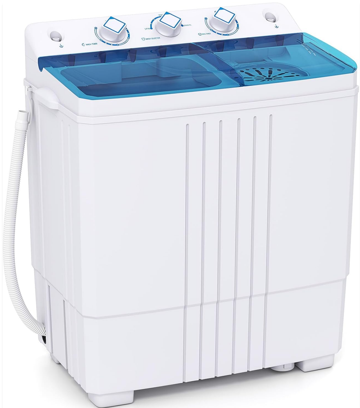
Image: Front view of the Giantex Portable Twin Tub Washing Machine.