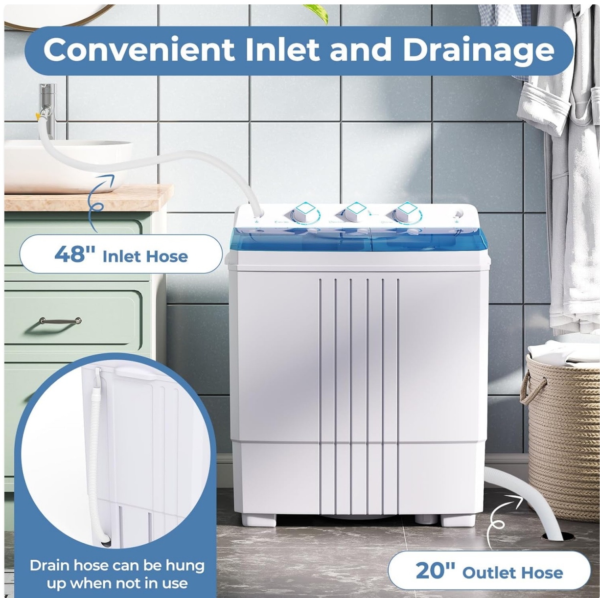
Image: Illustration of the water inlet and outlet hose connections for proper setup.