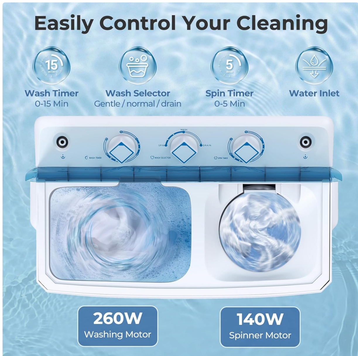
Image: Detailed view of the control panel, showing the wash timer, wash selector, and spin timer dials.

The Giantex Portable Twin Tub Washing Machine features a dual-tub design for separate washing and spinning functions. The control panel is located on the top of the unit for easy access.