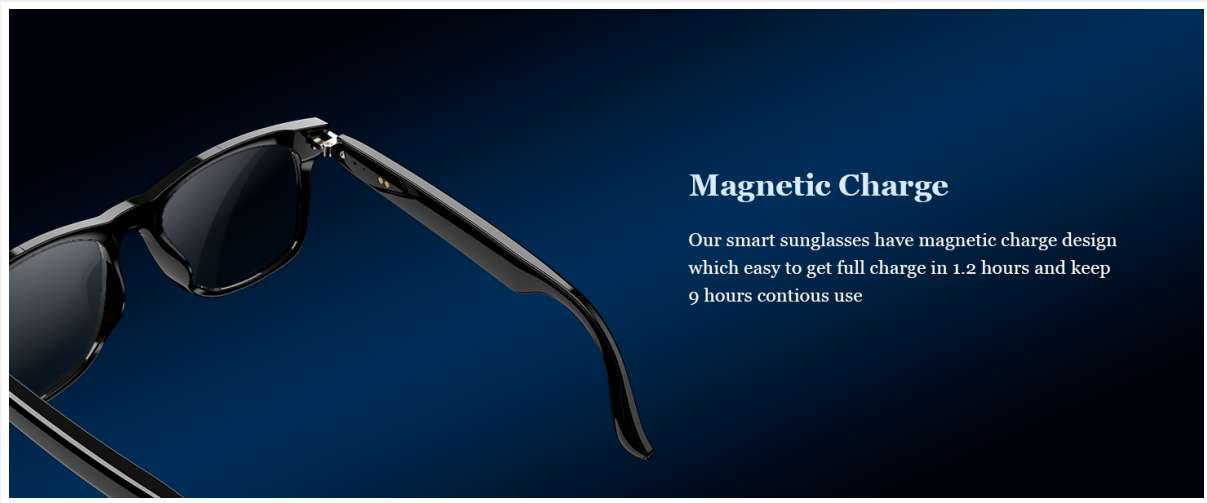
Figure 2: Magnetic charging connection for the smart glasses.