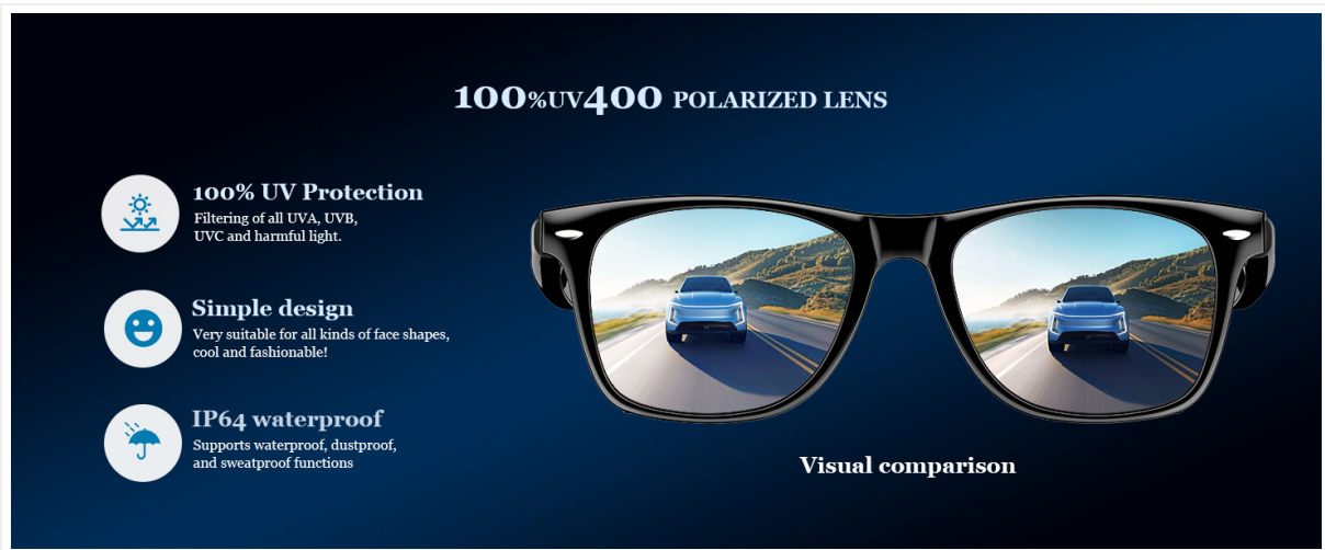
Figure 7: Features of the smart glasses, including polarized lenses and IP64 waterproof rating.