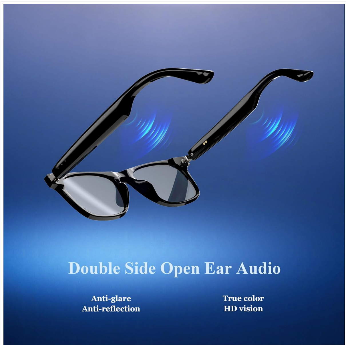
Figure 5: Open-ear audio feature of the smart glasses.