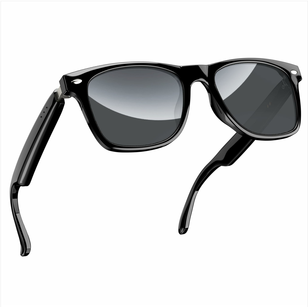
Figure 1: Blackview D1 Smart Glasses, front view.