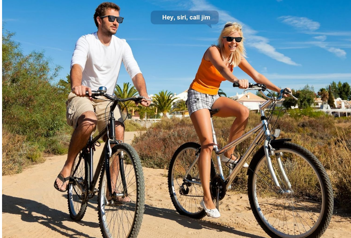
Figure 6: Using the voice assistant feature while wearing the smart glasses.

Click the right leg 3 times to call the mobile voice assistant