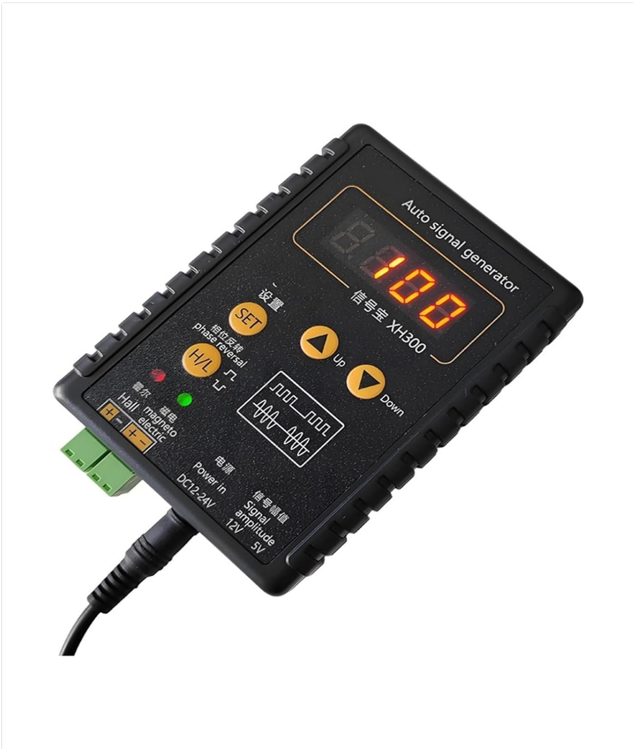
Figure 6.1: Angled view of the XH300, illustrating the power input and signal output terminals for connection.