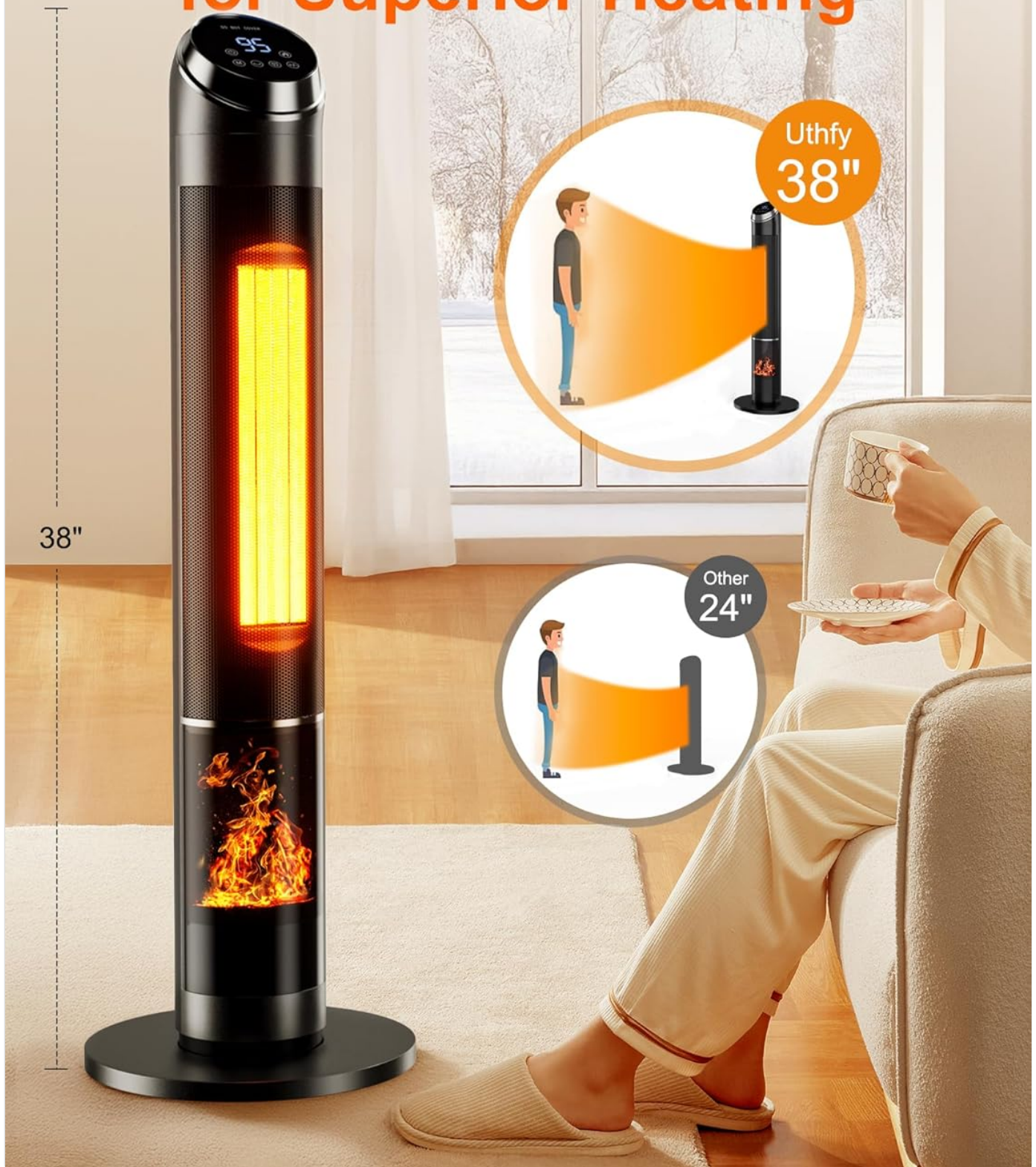
Image: The 38-inch tall tower heater positioned next to a person, demonstrating its superior height for effective heat distribution compared to a standard 24-inch heater.

Your browser does not support the video tag.