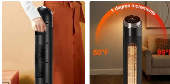
Image: The touch control panel on the top of the heater and the included remote control, both offering full functionality.