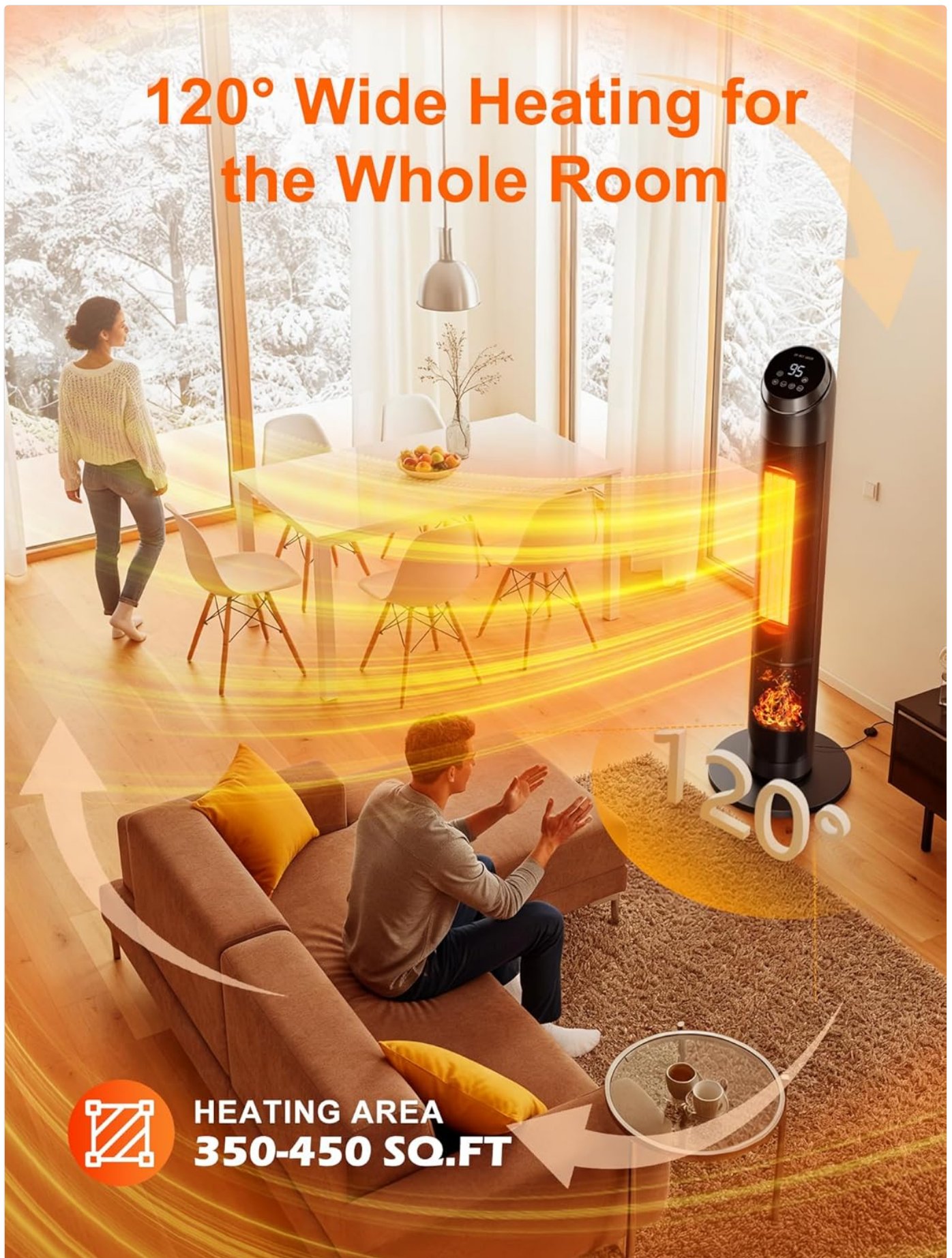
Image: Uthfy 38-inch Tower Space Heater in a living room, illustrating its 120° wide heating coverage for areas up to 450 sq.ft.