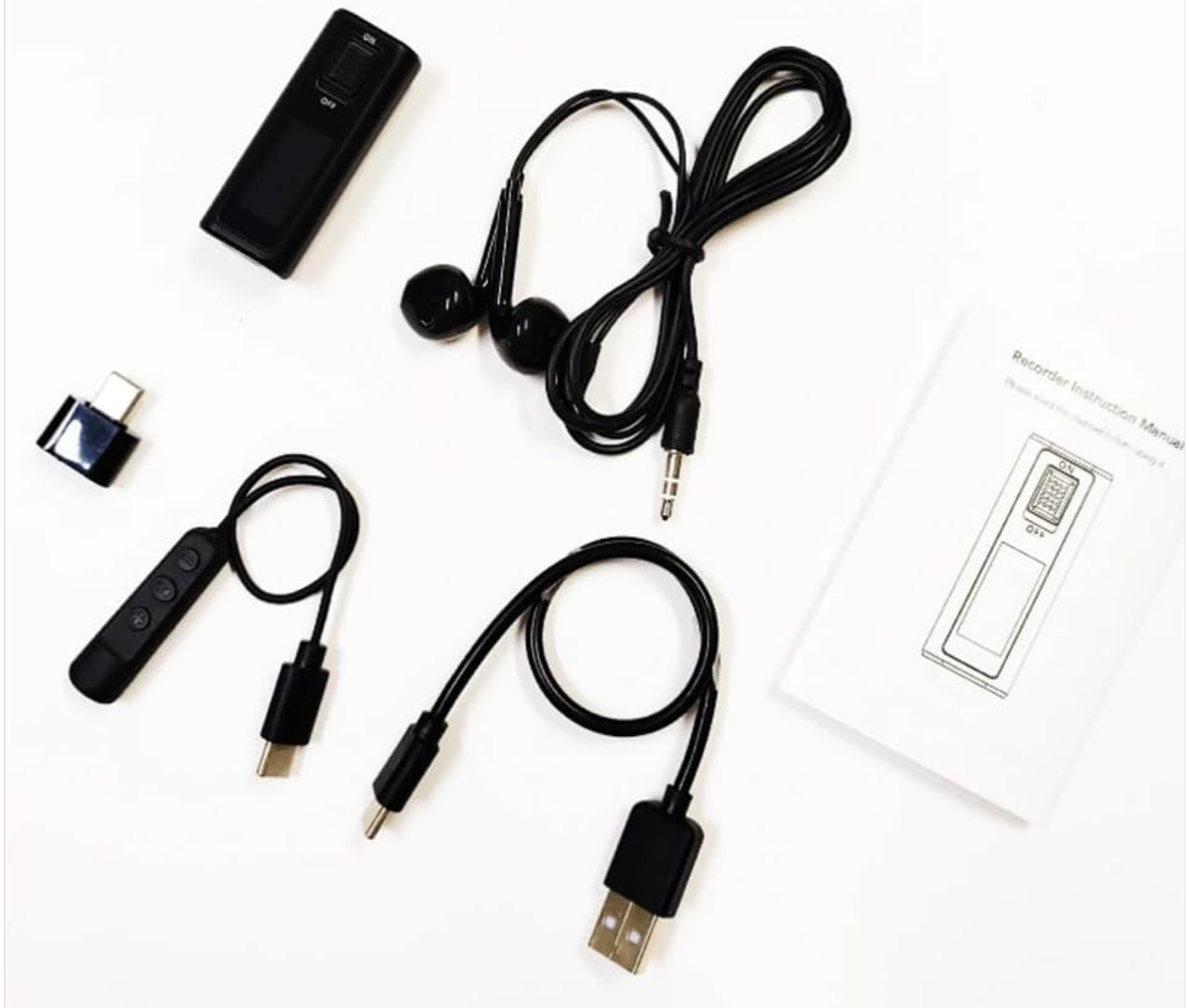
Image 3.1: All components included in the Savetek GS-R6Clip package.