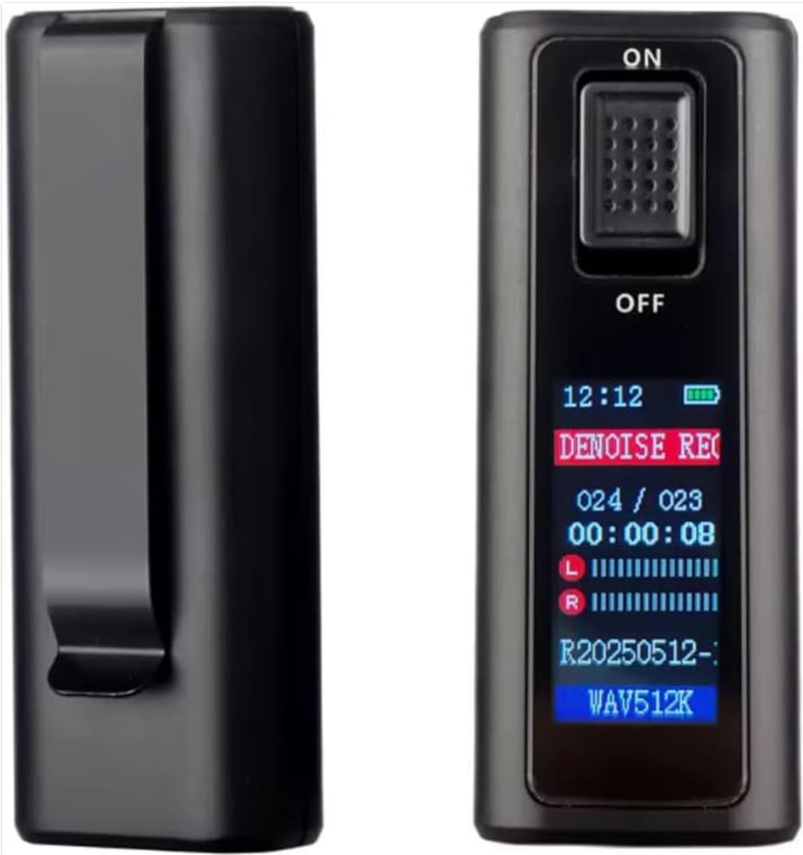
Image 4.2: Front and back view of the device, showing the metal clip.