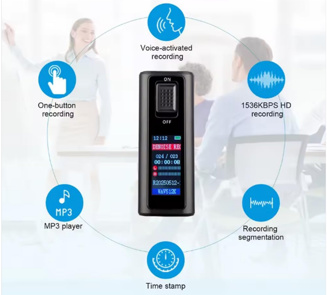
Image 4.1: Key features of the Savetek GS-R6Clip Digital Voice Recorder.