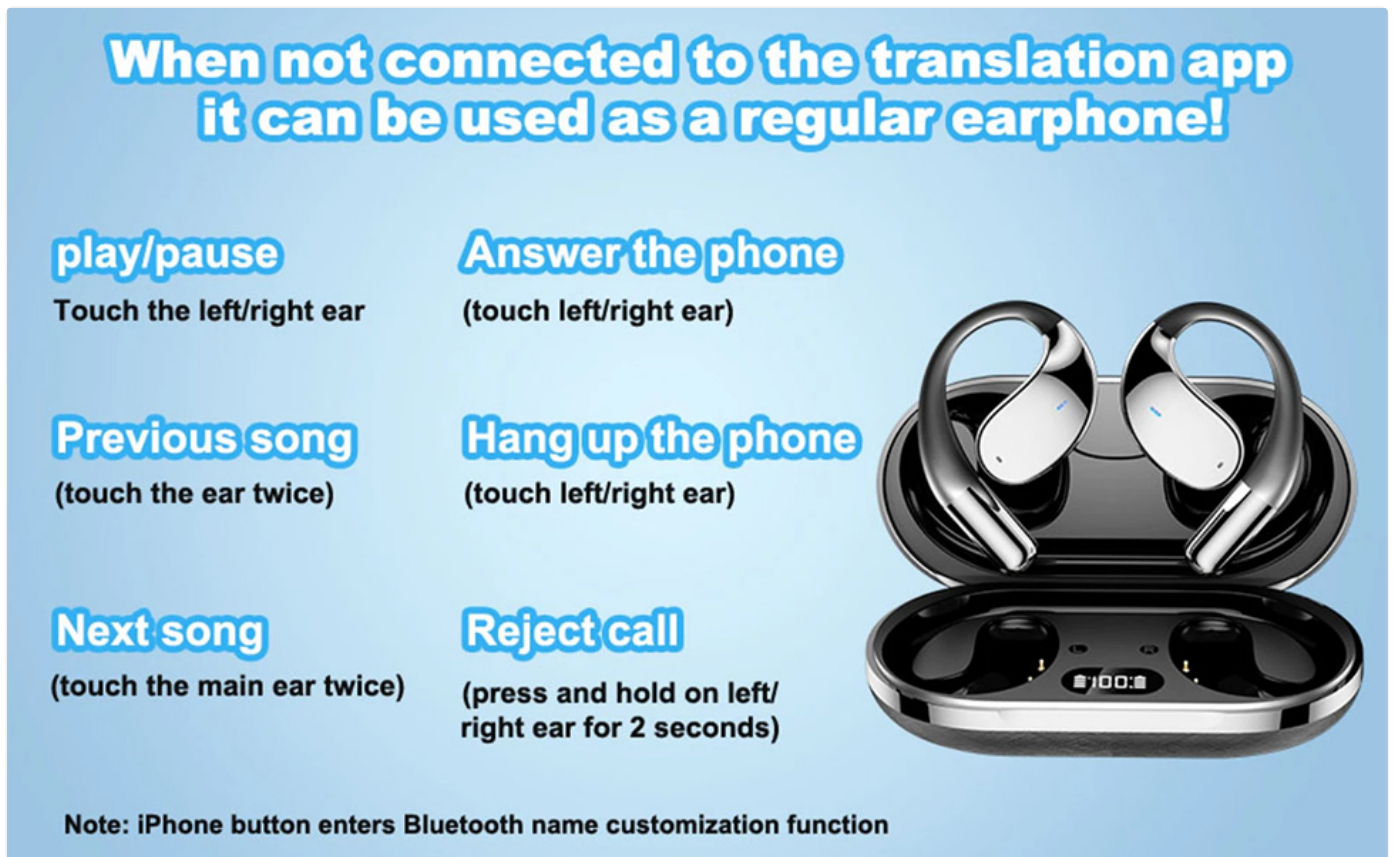
Image: A visual representation of the touch control functions on the Q39 earphones for music playback and call management when not in translation mode.