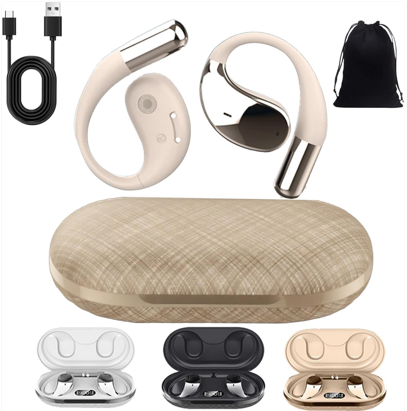
Image: The phiorine Q39 AI Translation Clip-On Bluetooth Earphones, charging case, USB-C cable, and carrying pouch. Various color options for the earbuds and cases are also shown.