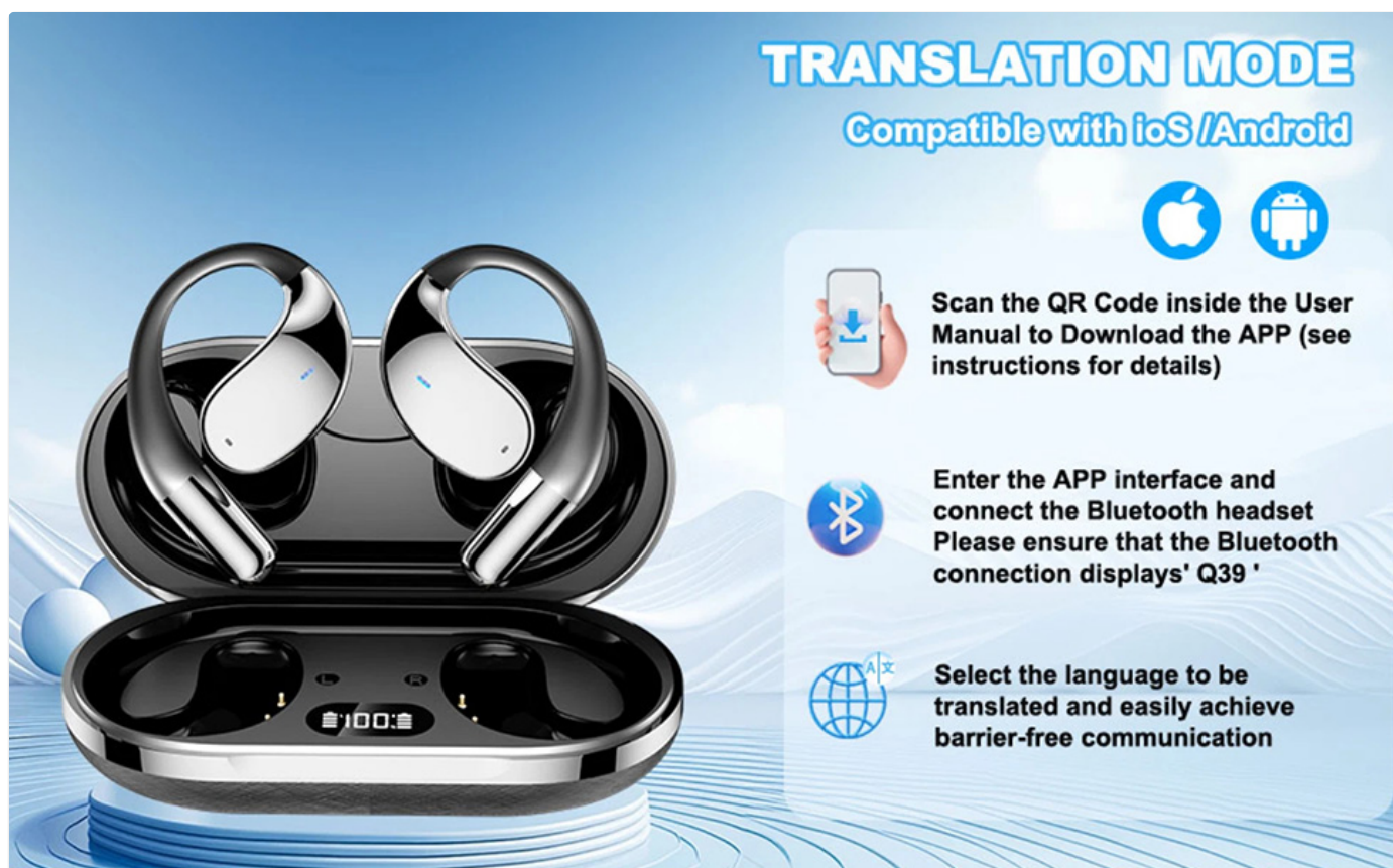
Image: A visual guide illustrating the steps to set up translation mode, including scanning a QR code for app download, connecting via Bluetooth, and selecting languages within the application.