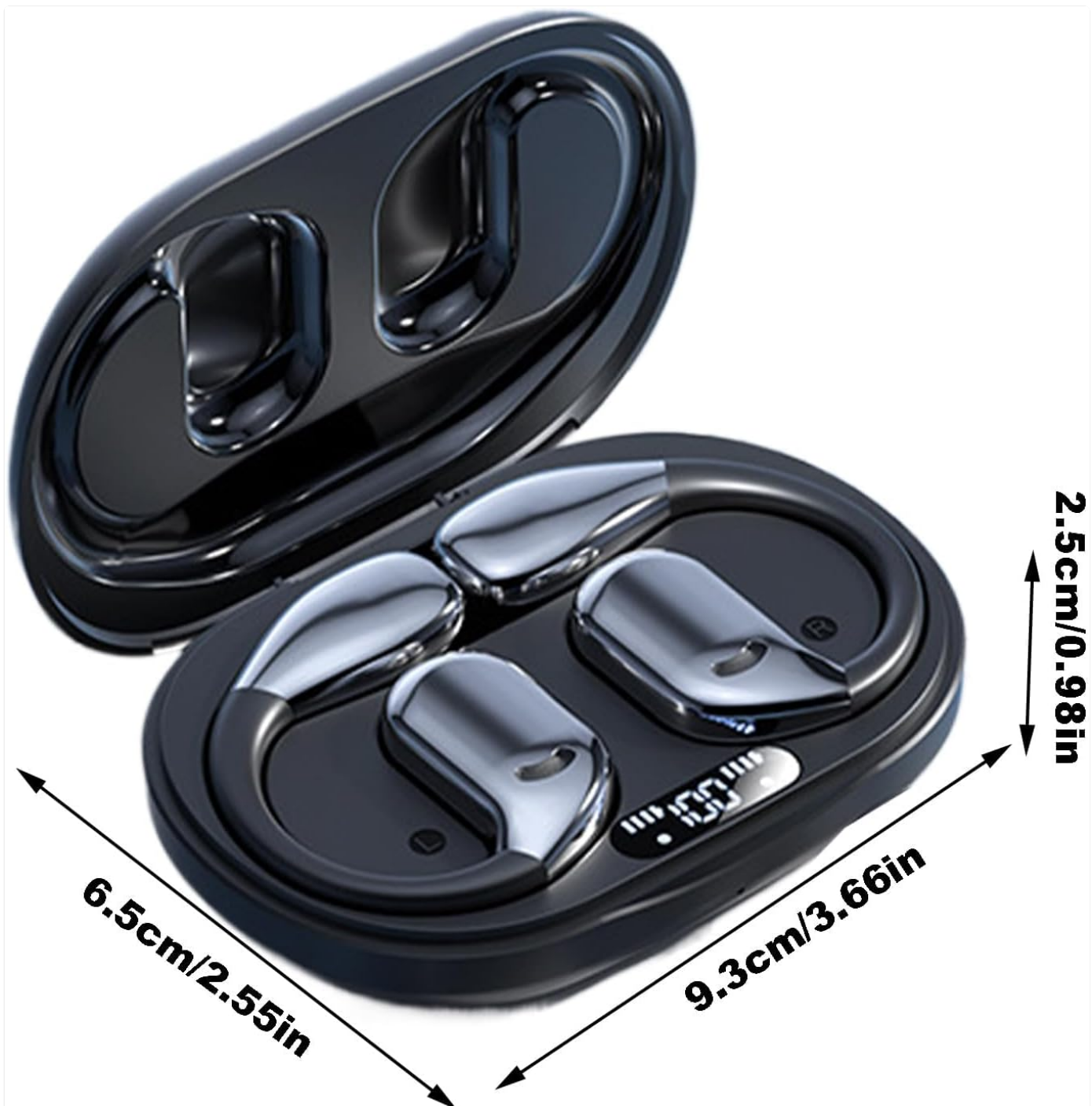
Image: A detailed view of the Q39 charging case and earbuds with their dimensions indicated in centimeters and inches.