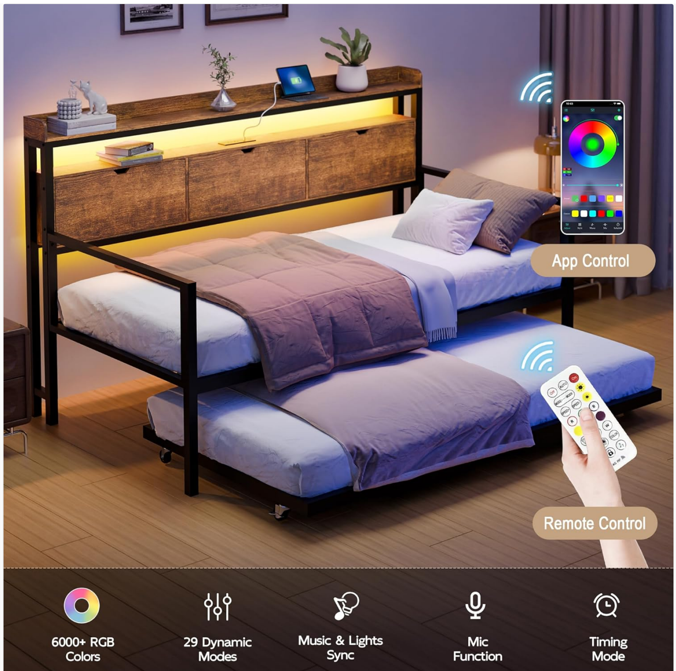
Image: The daybed's headboard illuminated by LED lights, with illustrations of a remote control and a smartphone app interface for controlling the lighting features, including color selection and dynamic modes.