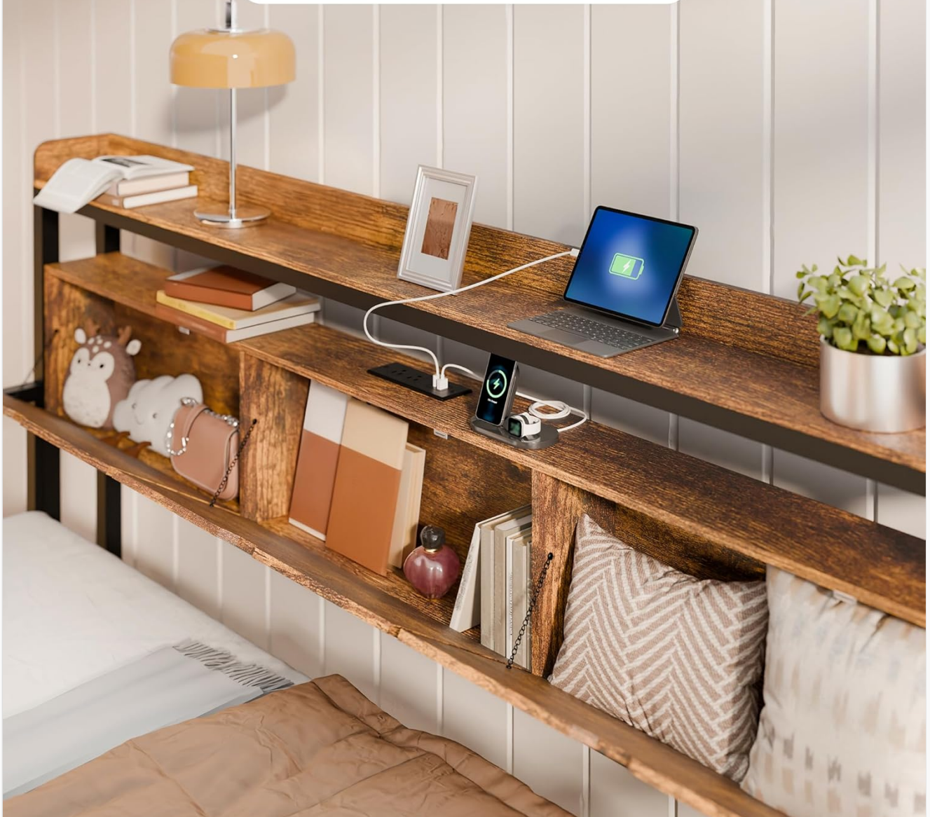
Image: A detailed view of the storage headboard, showcasing the three flip-top drawers and two open shelves. Various items like books, a laptop, and decorative objects are stored within.

Features 3 flip-top drawers and 2 open shelves