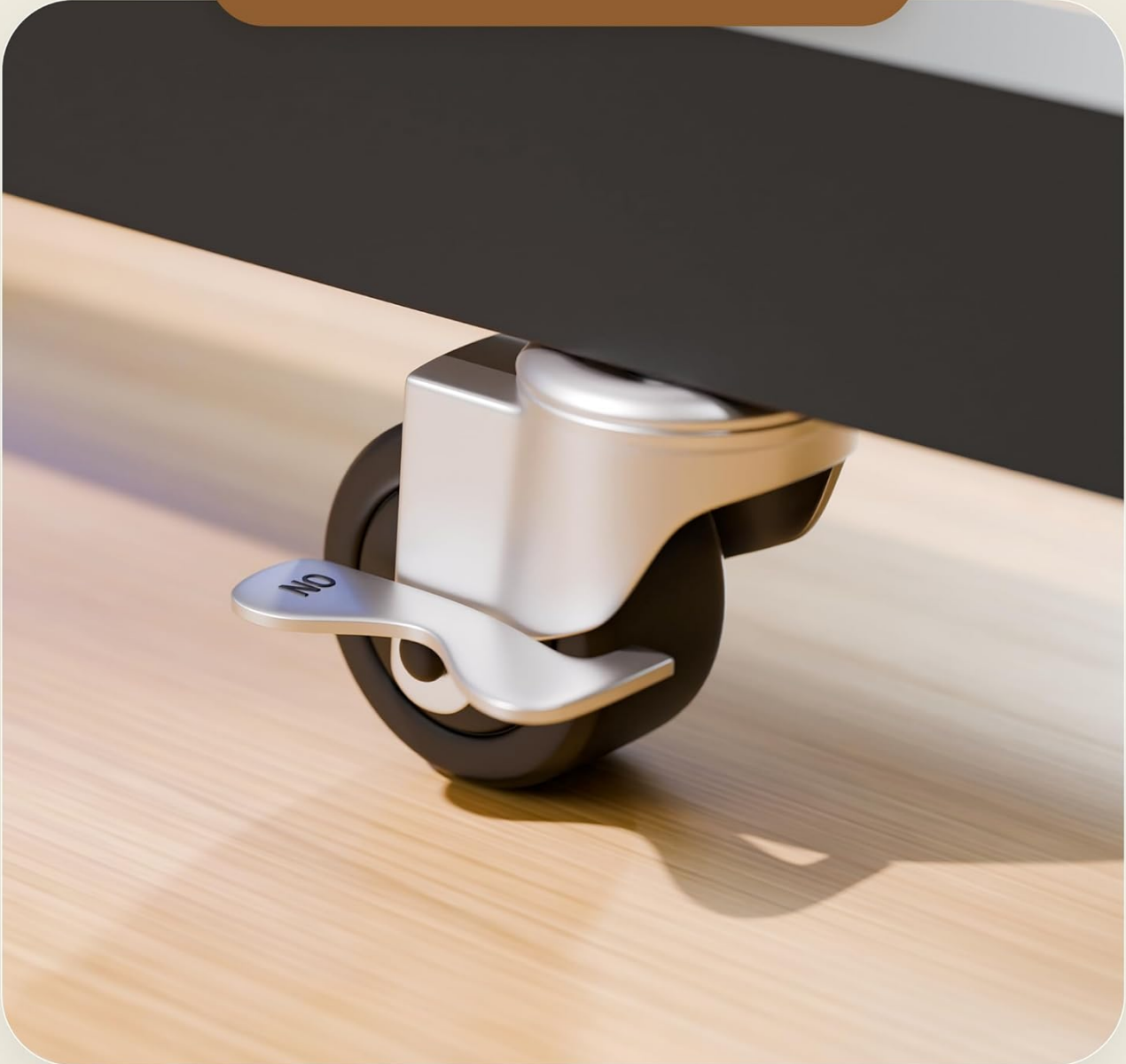
Image: A close-up view of a lockable wheel on the trundle bed, showing the 'ON' and 'OFF' positions for the locking mechanism. This feature enhances safety and stability.