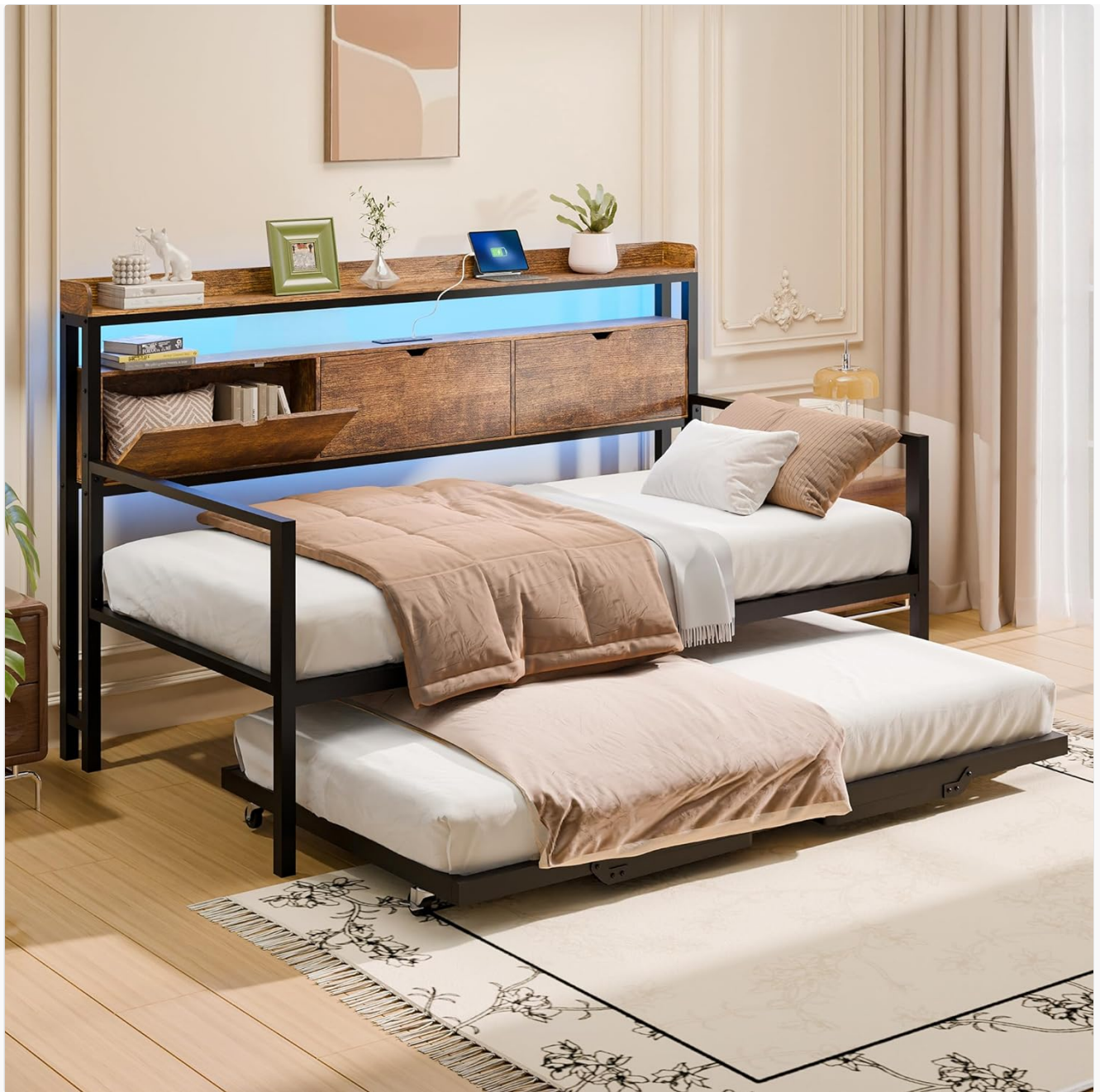
Image: The fully assembled TOLEAD Twin Daybed with the pop-up trundle stored underneath. The storage headboard with LED lighting is visible.