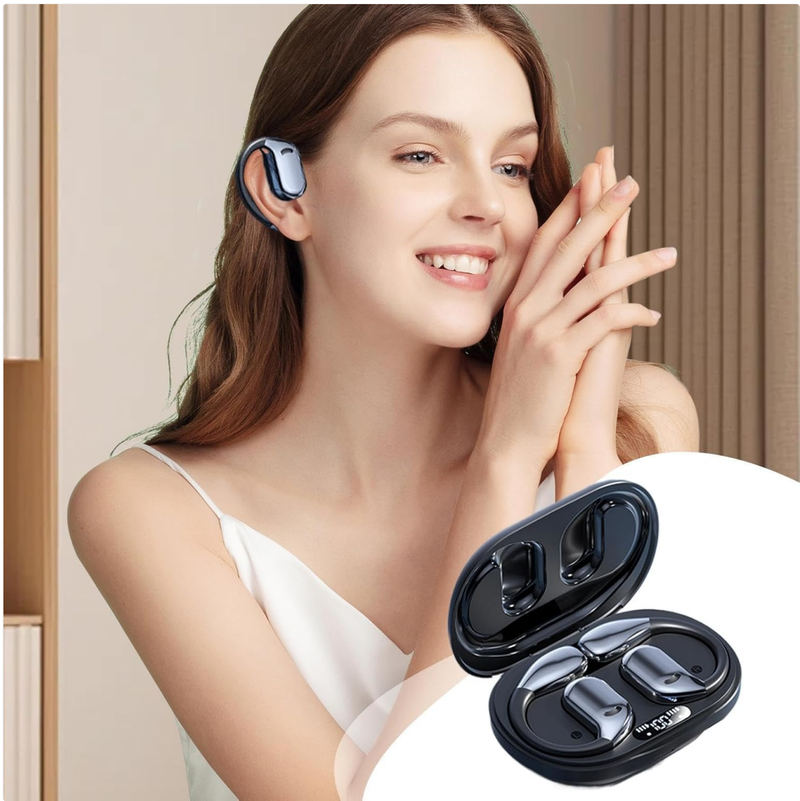
Image: A woman wearing the Q39 AI Translation Earbuds, showcasing their discreet and comfortable fit for everyday use.