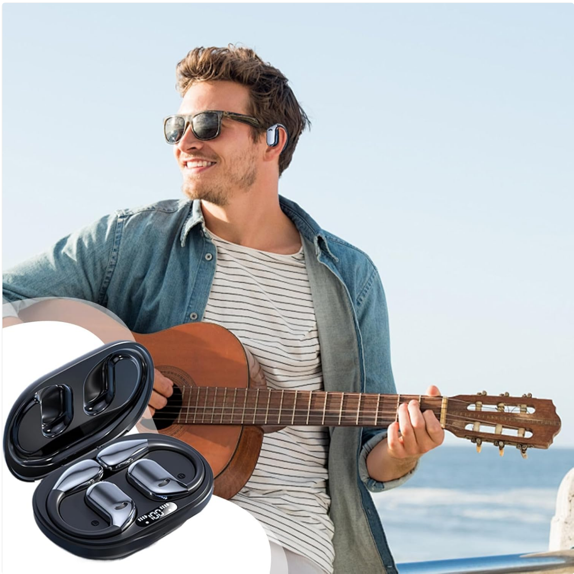
Image: A man wearing the Q39 AI Translation Earbuds while playing an acoustic guitar outdoors by the sea, demonstrating the earbuds' use for music listening.