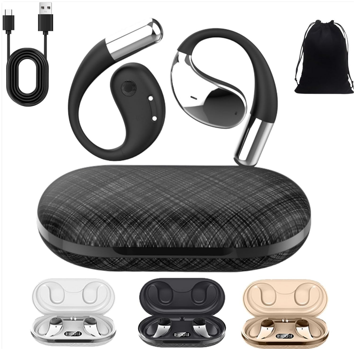
Image: The Q39 AI Translation Clip-On Bluetooth Earphones, showing the two earbuds, their charging case, a USB-C charging cable, and a storage bag. Various color options for the charging case are also displayed at the bottom.