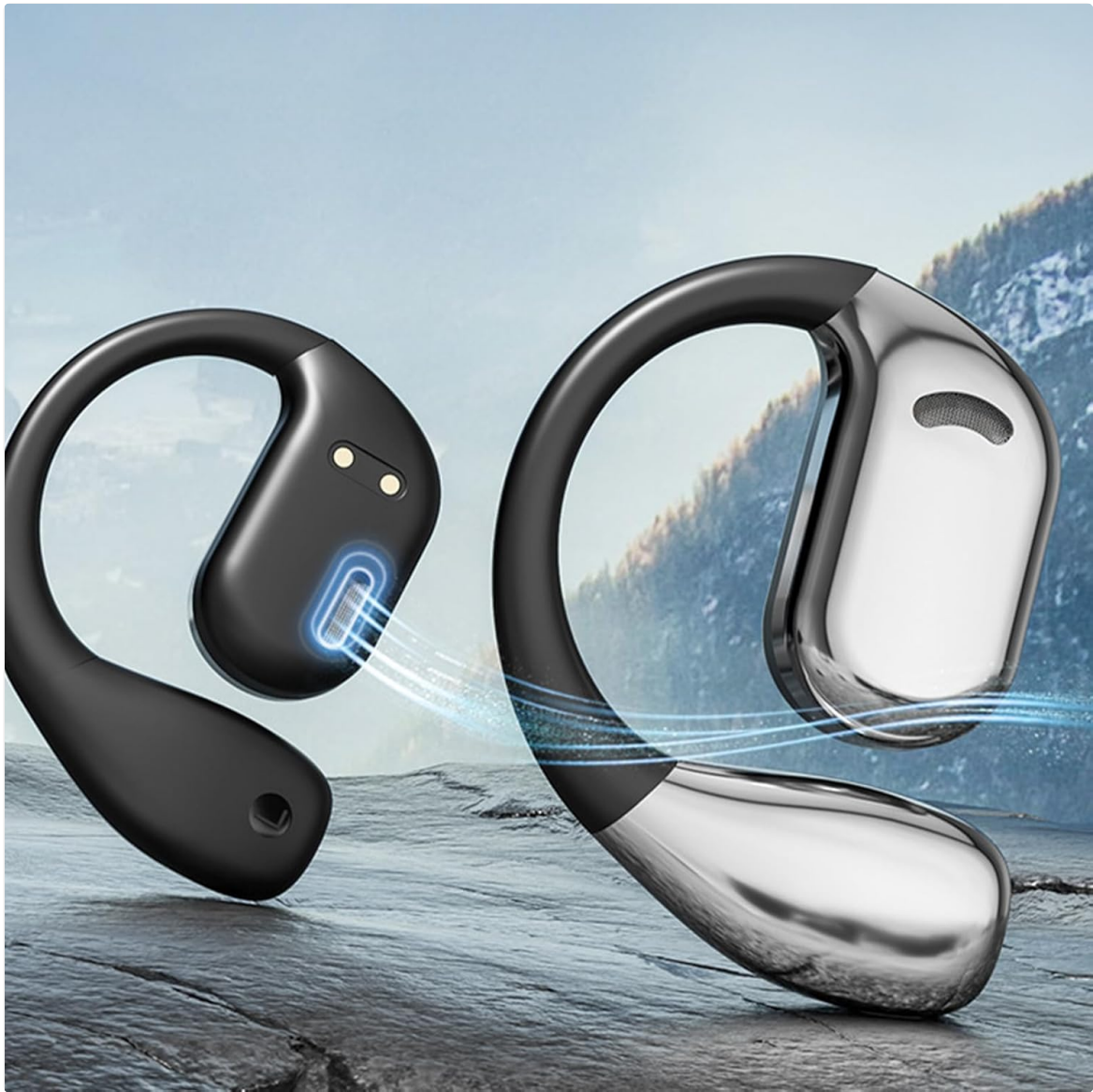
Image: A pair of Q39 AI Translation Earbuds, with blue lines indicating sound or air conduction, set against a mountain and water background, highlighting their audio capabilities.