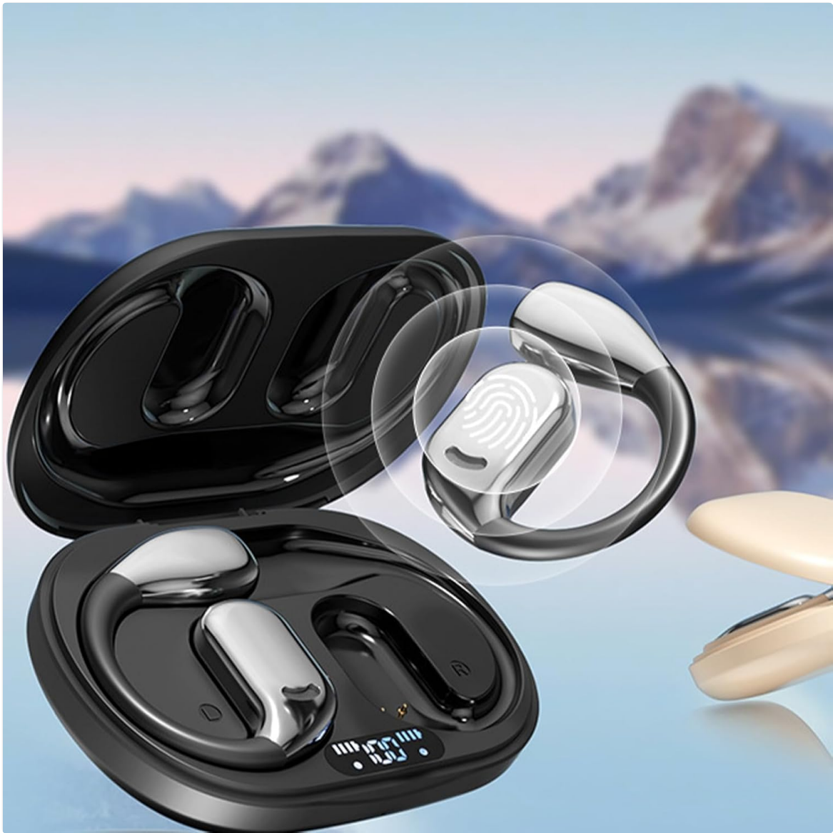
Image: A close-up of a Q39 AI Translation Earbud resting in its charging case, with a glowing fingerprint icon indicating the touch control area on the earbud's surface.