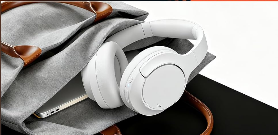
Image: Comparison showing the NUBWO HG04 headset in its foldable state for travel versus a non-foldable headset.