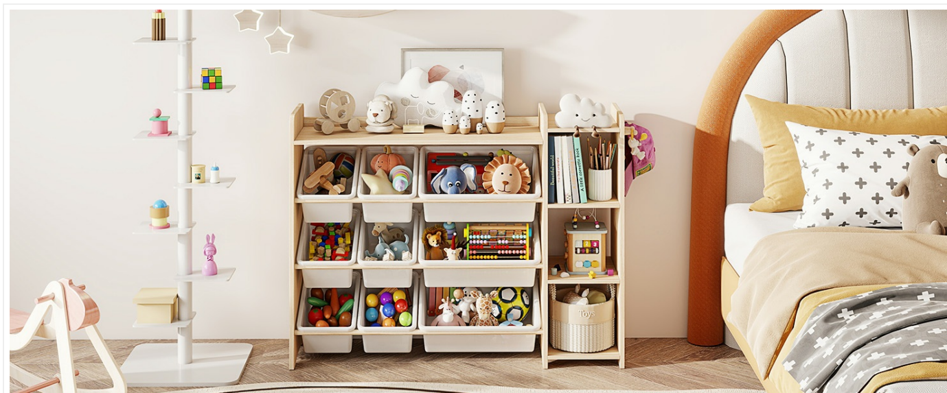
Figure 3: The organizer functioning as both a toy organizer and a bookshelf.