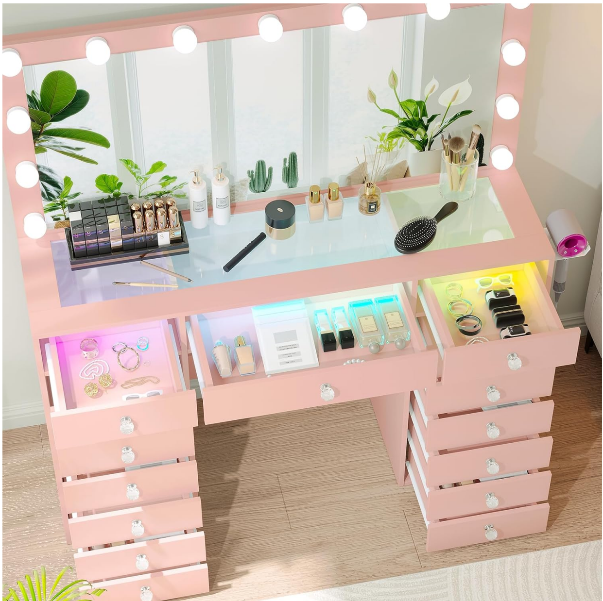
Image: Close-up of the vanity's glass tabletop with RGB lighting, demonstrating control via remote and mobile app, highlighting features like music sync and dynamic modes.