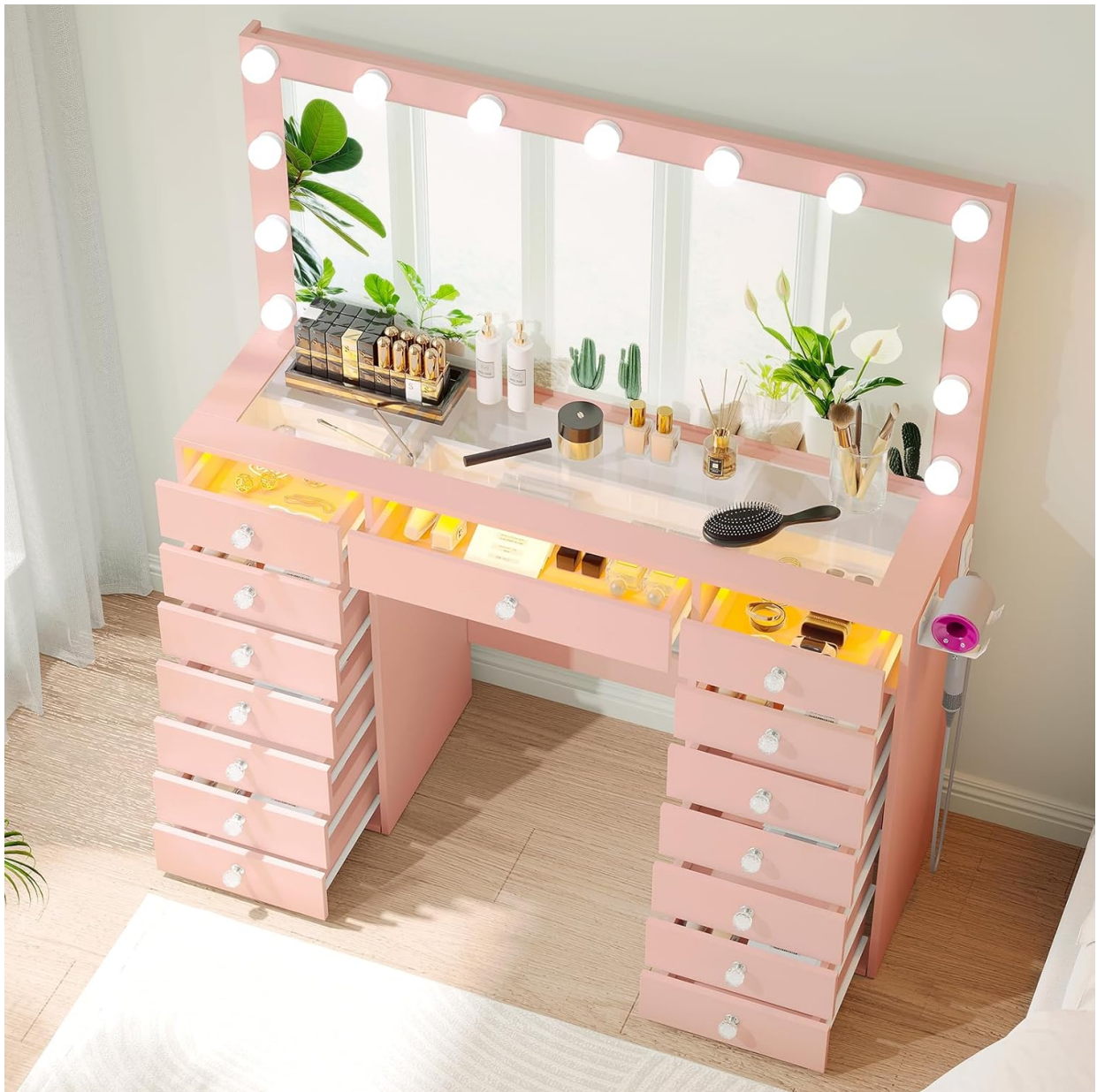
Image: The VOWNER Vanity Desk in pink, featuring a lighted mirror, a transparent glass tabletop revealing organized items, and numerous drawers.