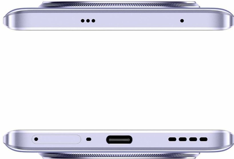
Image 2.1: Side view of the realme 14 Pro Lite, indicating the SIM card tray position.