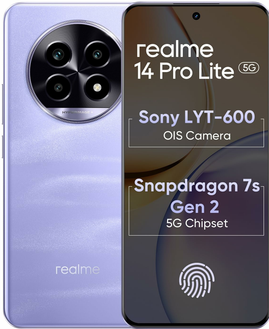
Image 1.1: The realme 14 Pro Lite Smartphone, showcasing its design.