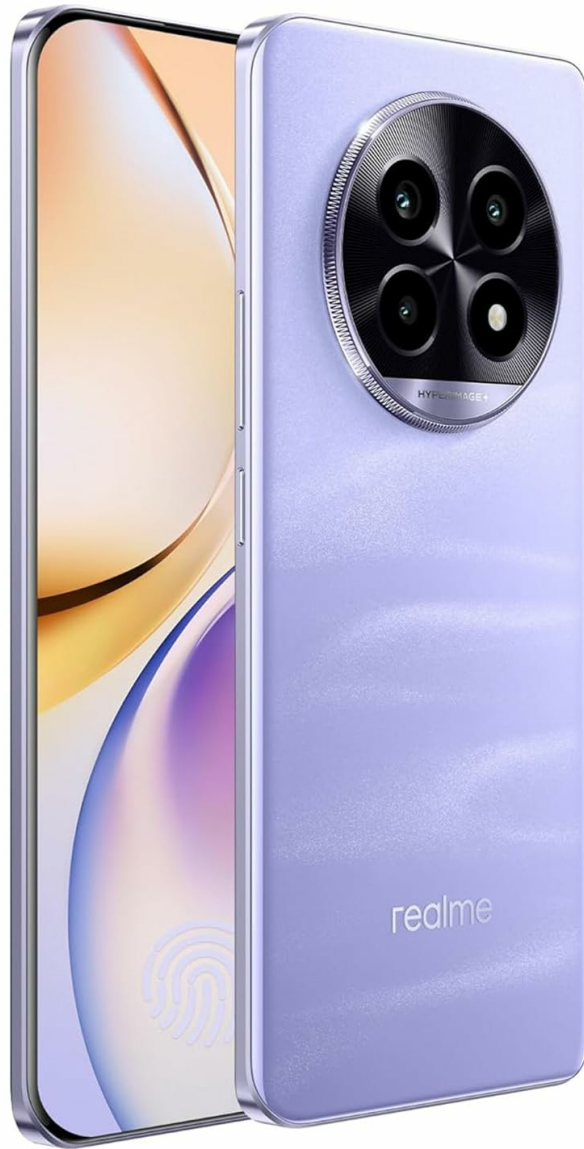
Image 3.2: Back view of the realme 14 Pro Lite, highlighting the camera module.