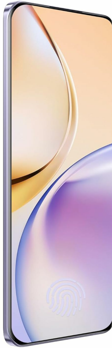
Image 3.1: Front view of the realme 14 Pro Lite, showcasing its display.