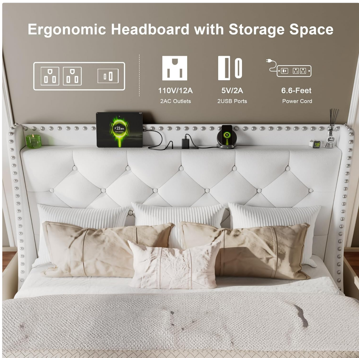
Image 4.1: Close-up of the headboard showing the integrated charging station with AC outlets and USB ports, and the top storage space.