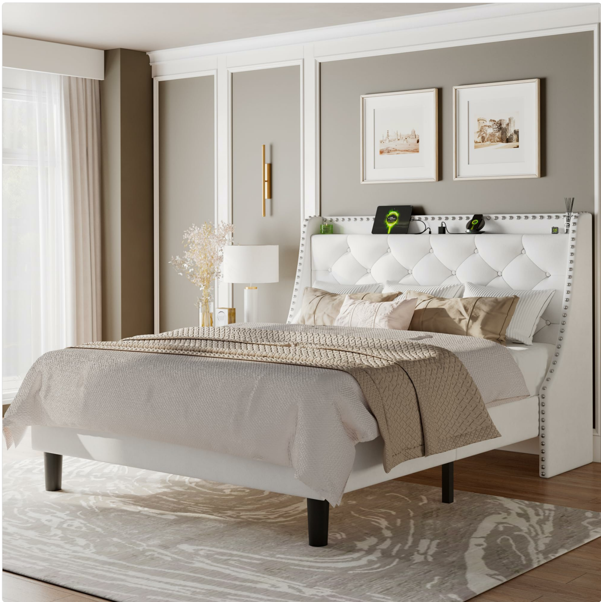
Image 1.1: Fully assembled Feonase Velvet Queen Bed Frame in white.