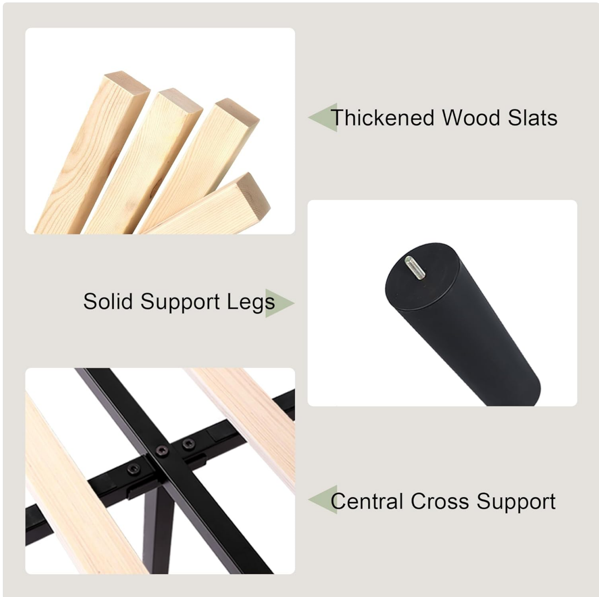
Image 3.1: Illustration of key structural components including thickened wood slats, solid support legs, and central cross support.

Before beginning assembly, verify that all parts are present and undamaged. Refer to the included parts list for identification.