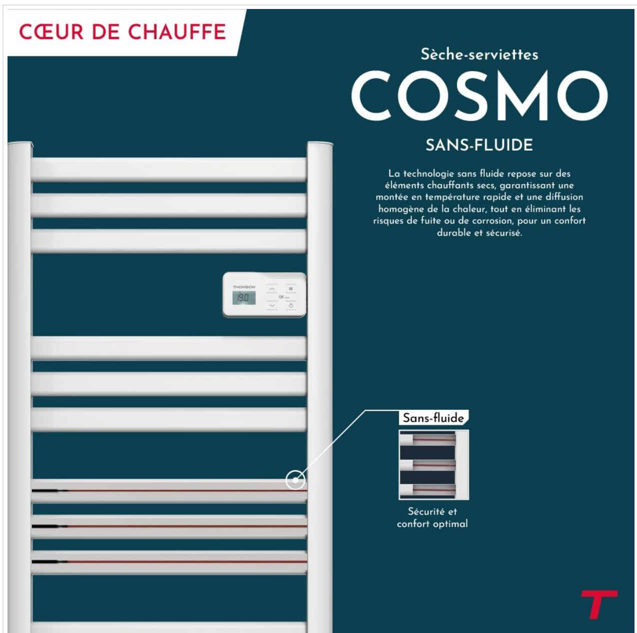
Image: Digital control panel with LCD display and buttons for temperature adjustment and mode selection, shown with a hand pressing the power button.

The THOMSON COSMO towel dryer features an intuitive digital control panel for easy operation.