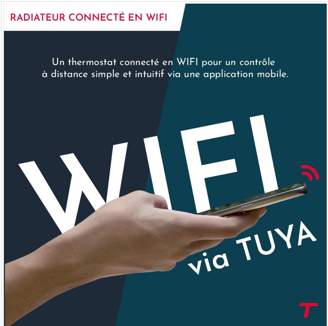
Image: The Tuya Smart app interface demonstrating energy monitoring and scheduling features for connected devices.