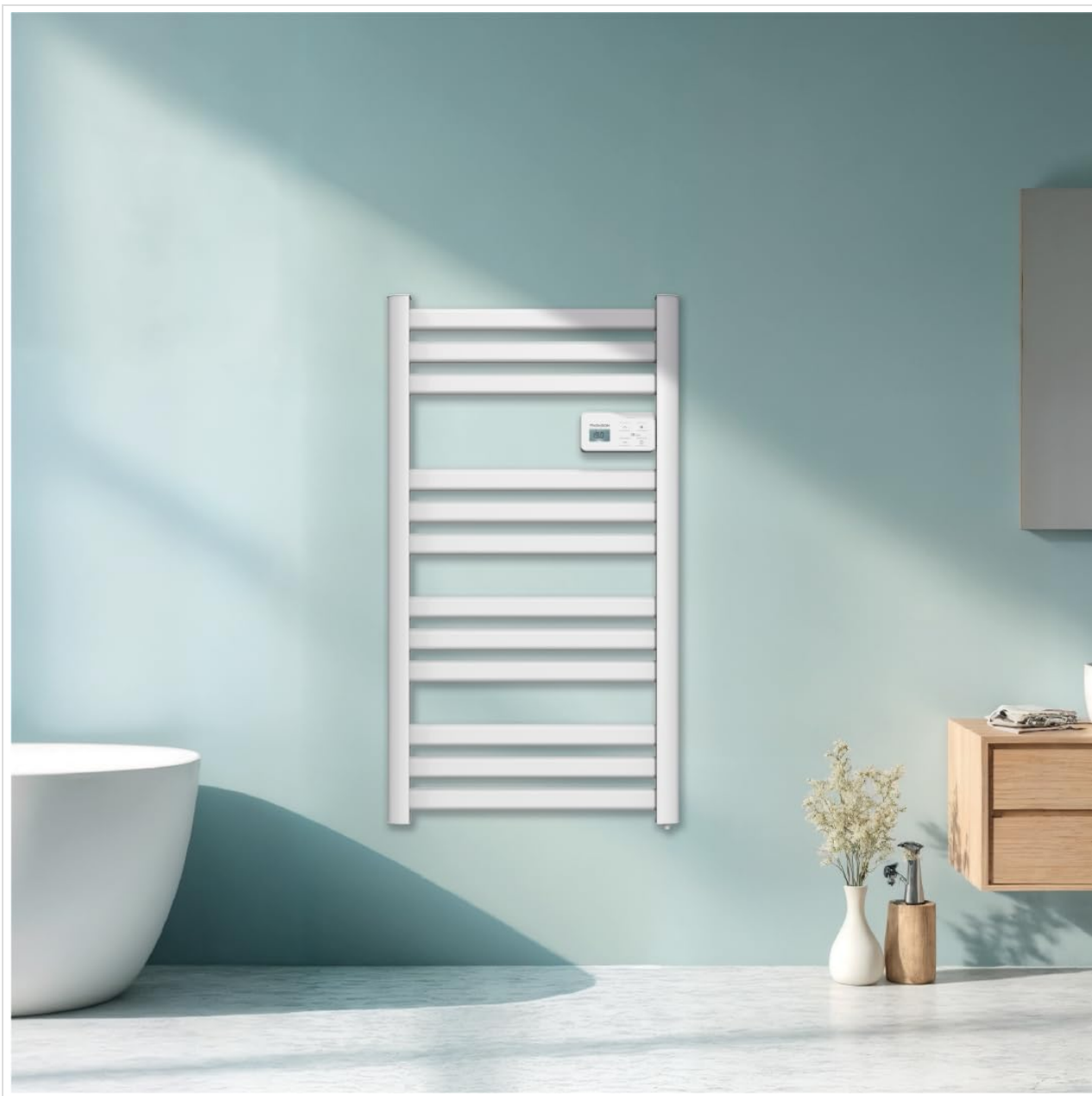
Image: A graphic indicating the towel dryer's Wi-Fi connectivity and compatibility with the Tuya Smart application.