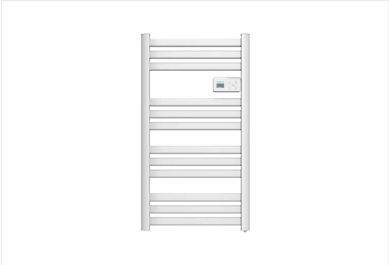
Image: Front view of the THOMSON COSMO electric towel dryer, white, wall-mounted, showcasing its design in a bathroom.

The THOMSON COSMO towel dryer features a sleek design and advanced fluid-free heating technology for rapid and even heat distribution. It includes a digital control panel and Wi-Fi connectivity for remote management.