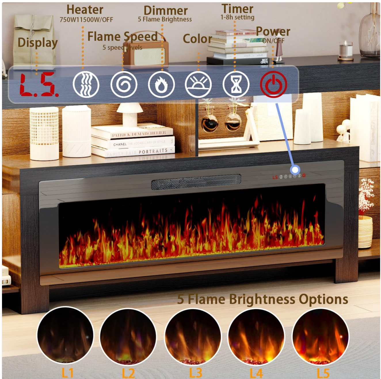
Image: The control panel of the electric fireplace, illustrating buttons for heater settings (750W/1500W), flame speed (5 levels), flame color, dimmer (5 brightness options), timer (1-8 hours), and power ON/OFF.