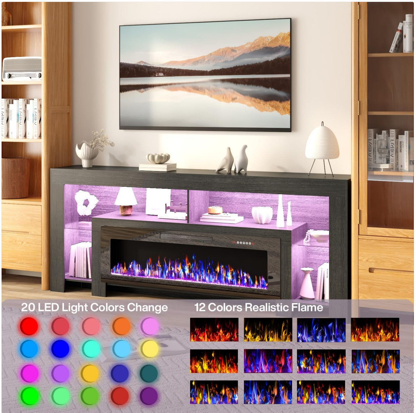
Image: A visual representation of the 20 available LED light colors and 12 realistic flame color variations for the fireplace.