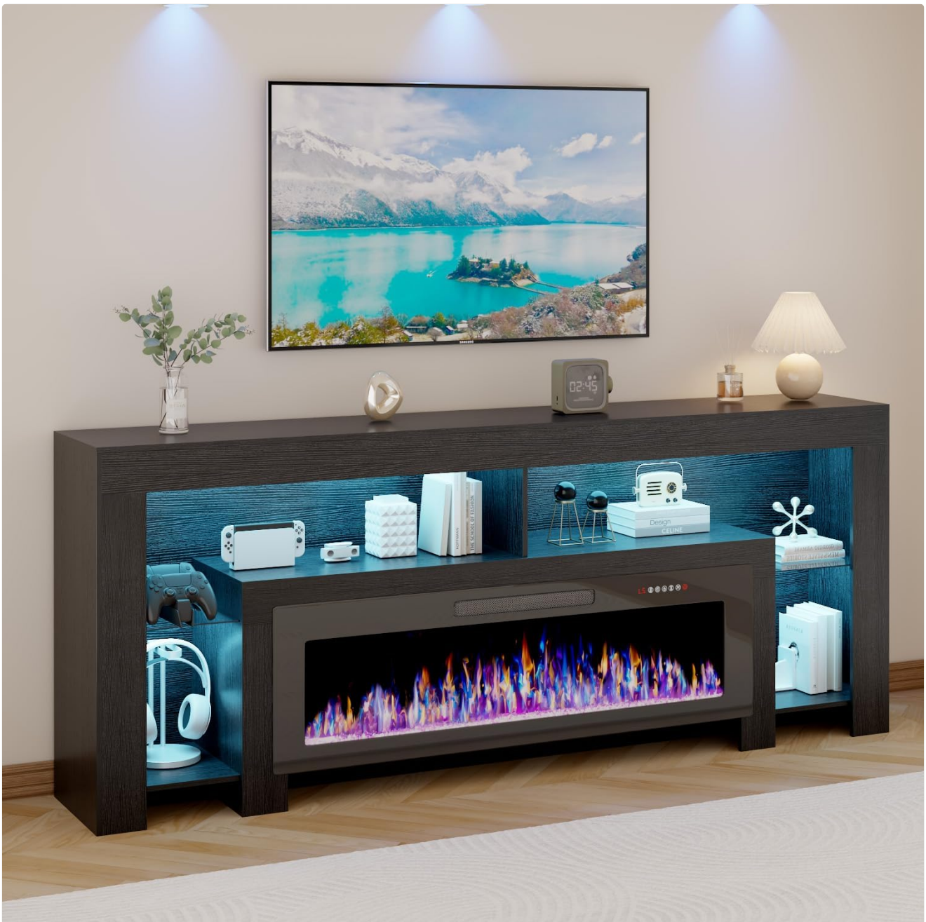
Image: The LEMBERI TV stand showcasing its LED lighting feature, with blue lights illuminating the shelves and a matching blue flame effect in the electric fireplace.