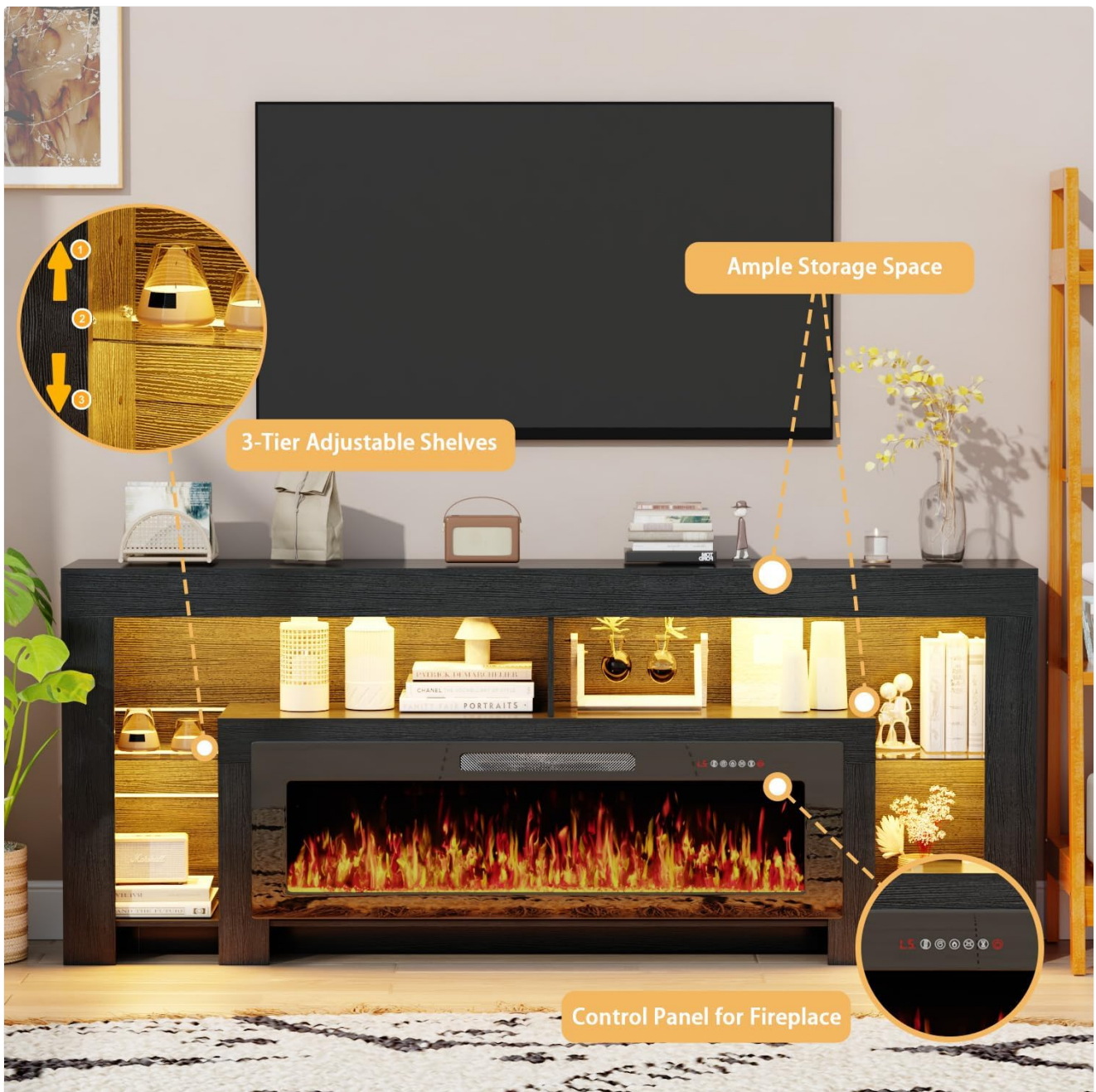
Image: Detailed view highlighting the ample storage space with 3-tier adjustable shelves and the control panel for the electric fireplace.