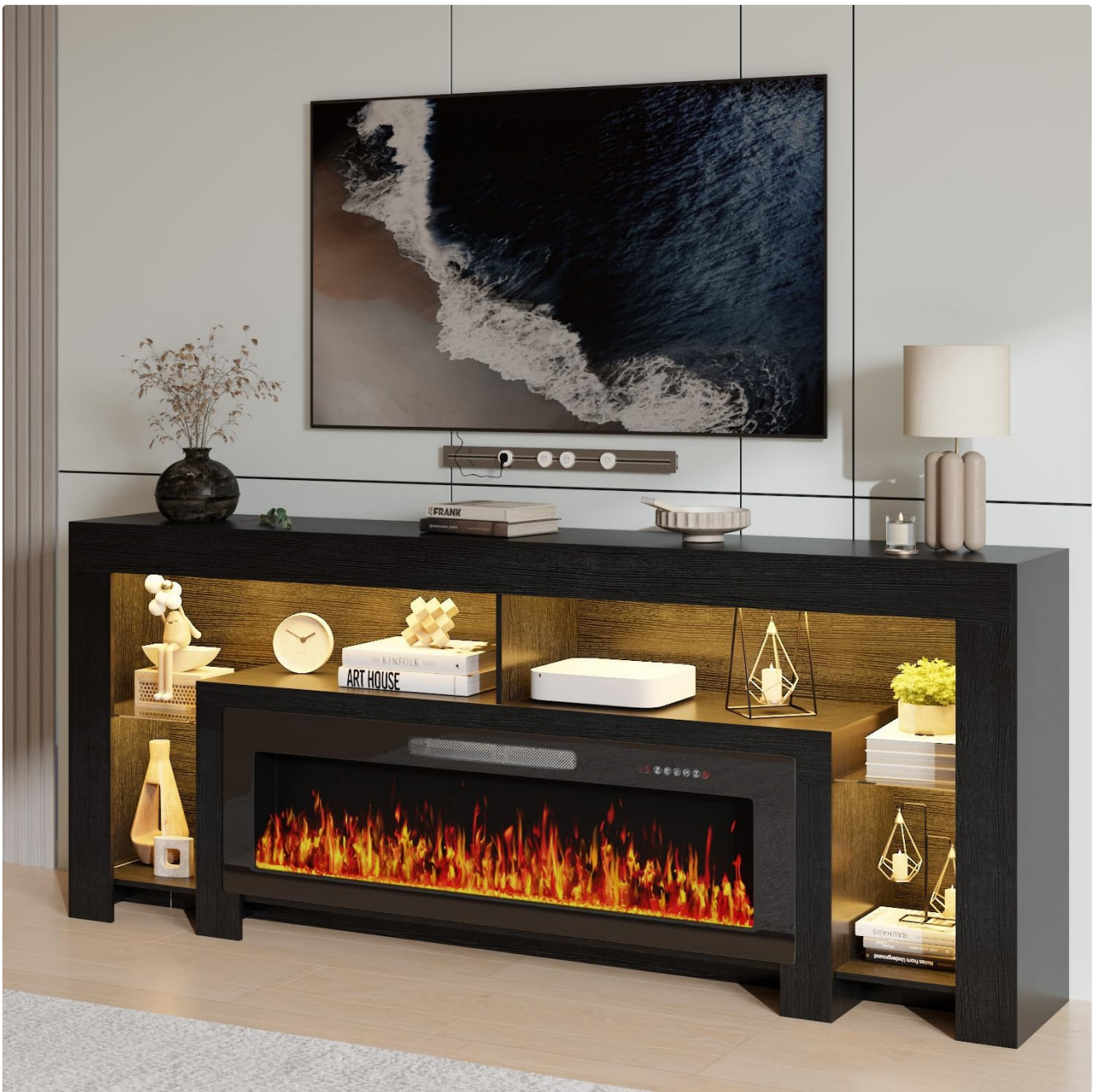
Image: The fully assembled LEMBERI Fireplace TV Stand, featuring the central electric fireplace, illuminated side shelves, and a television placed above.