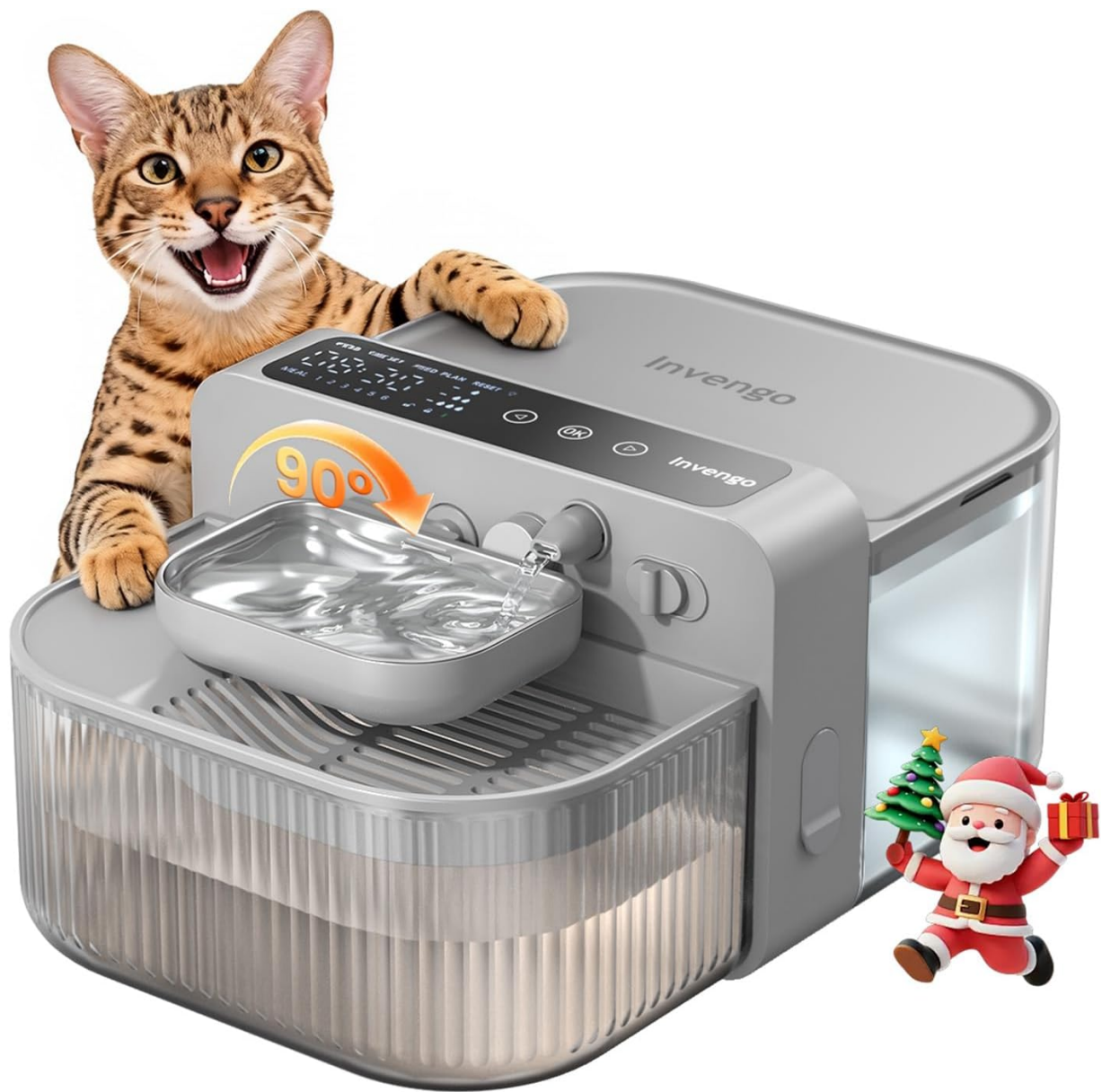
The Invengo MeowFlow E100 Wireless Cat Water Fountain, designed for optimal pet hydration.