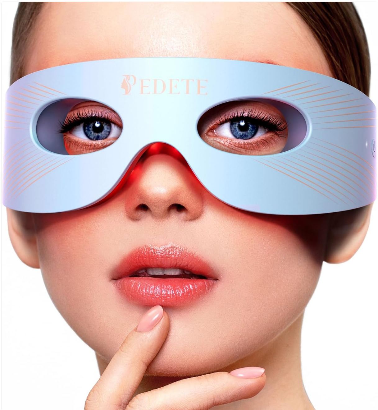
Image: The Pedete Red Light Therapy Eye Mask in use, demonstrating its ergonomic design.