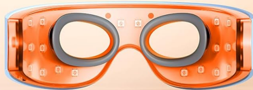
Image: Visual representation of the three light modes: Red, Blue, and Yellow, and their associated benefits.