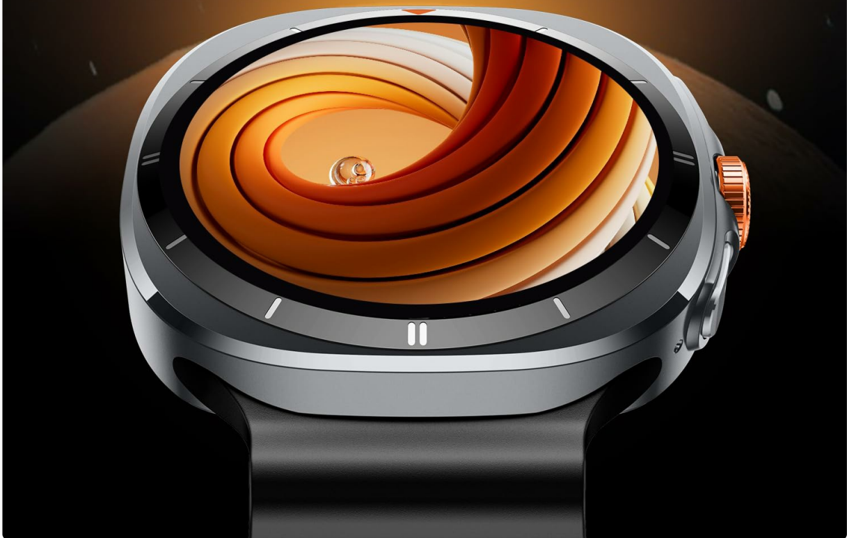
Image: The smartwatch screen showing the voice assistant feature and other smart functionalities.