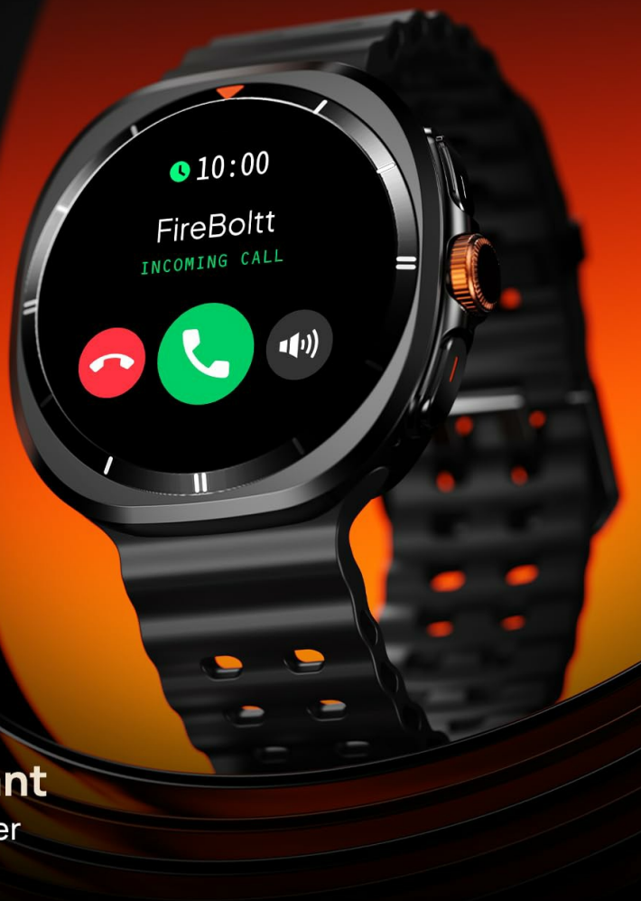
Image: The Fire-Boltt Axiom Smart Watch positioned on its wireless charging pad, illustrating the charging process.