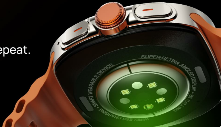
Image: The smartwatch displaying health metrics like heart rate and SpO2, alongside an image of the watch's rear sensors.