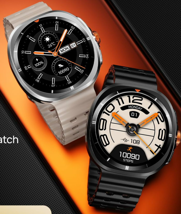
Image: A visual representation of the Fire-Boltt Axiom in various colors and with different watch faces, demonstrating customization options.