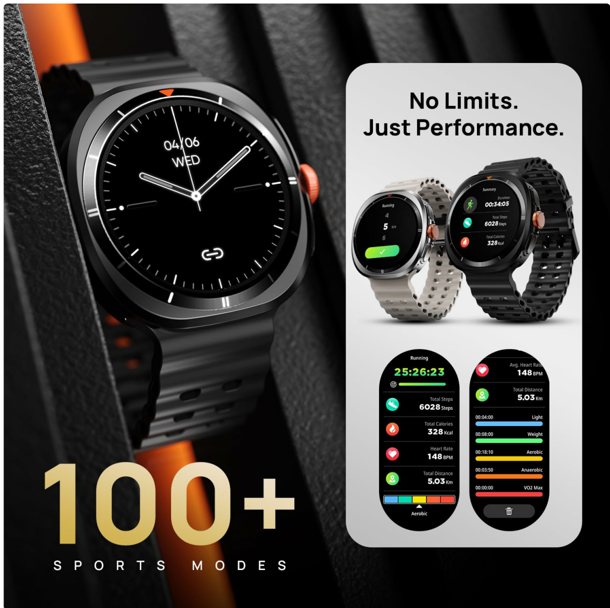
Image: The smartwatch interface showing different sports modes and detailed fitness tracking statistics.