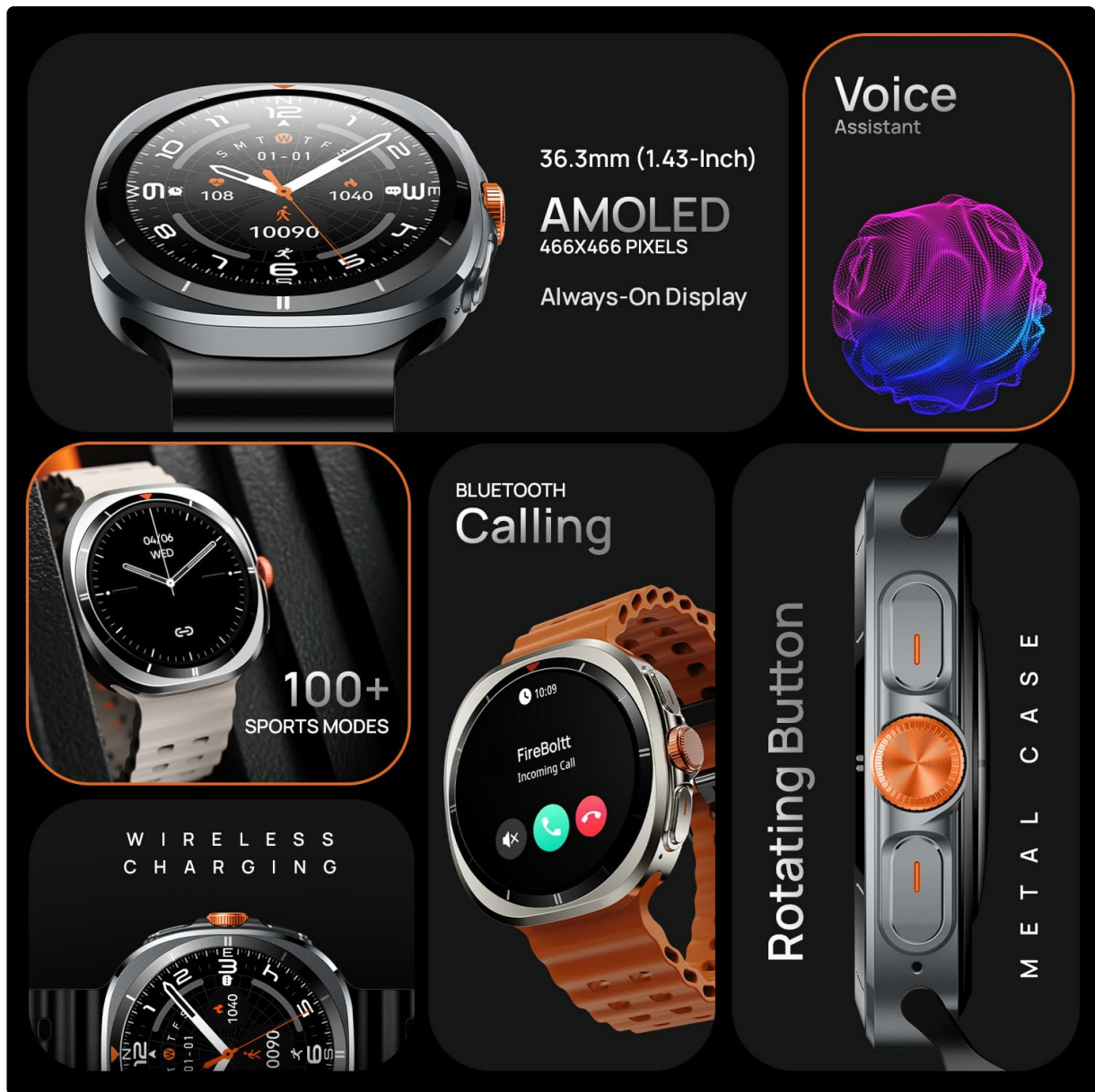
Image: A detailed view of the Fire-Boltt Axiom's AMOLED display, highlighting its size, resolution, and brightness capabilities.

Navigate the watch interface using the rotating crown and two physical buttons located on the side.