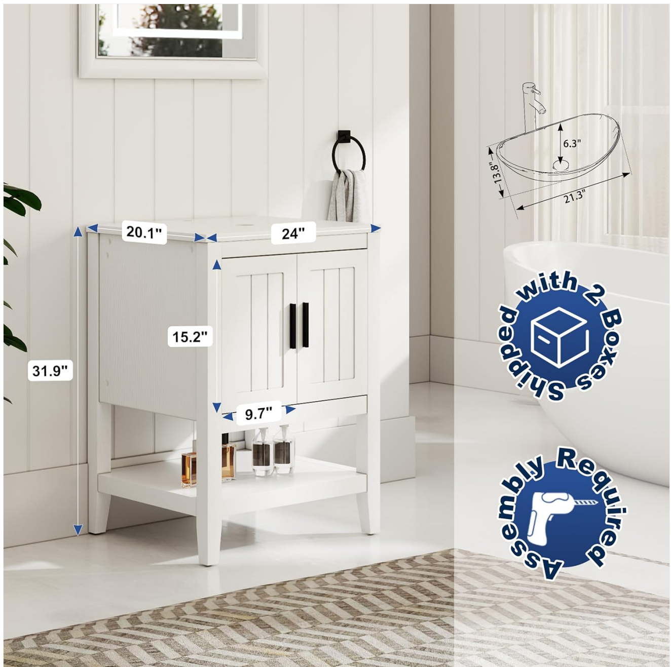
Image 4.1: Detailed dimensions of the vanity cabinet and vessel sink.