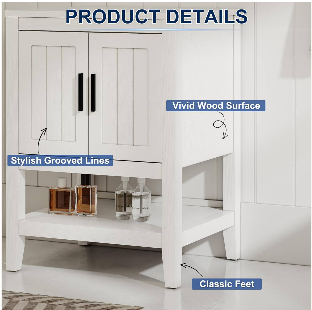
Image 5.1: Detail of the vanity's grooved lines and classic feet, indicating proper panel alignment.