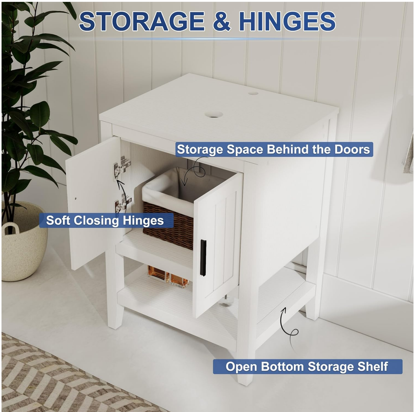
Image 5.2: View of the vanity's interior storage and soft-closing hinges.