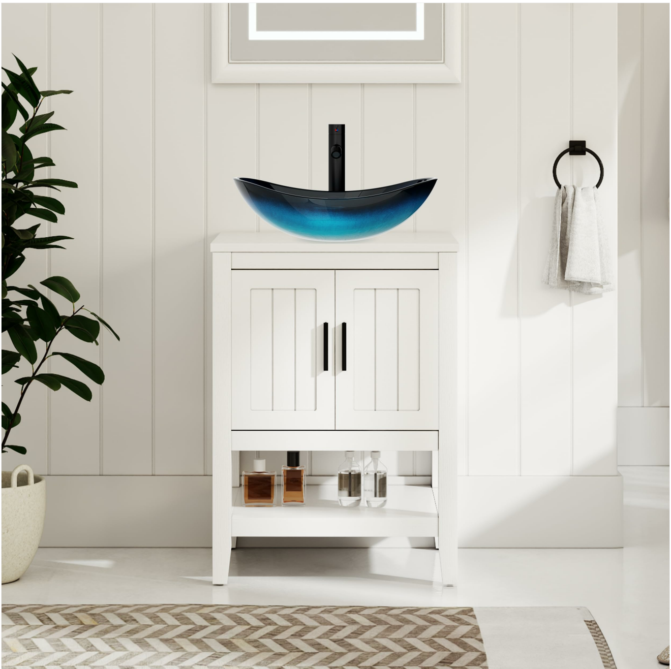
Image 1.1: The eclife 24-inch Bathroom Vanity with Blue Boat Glass Vessel Sink.