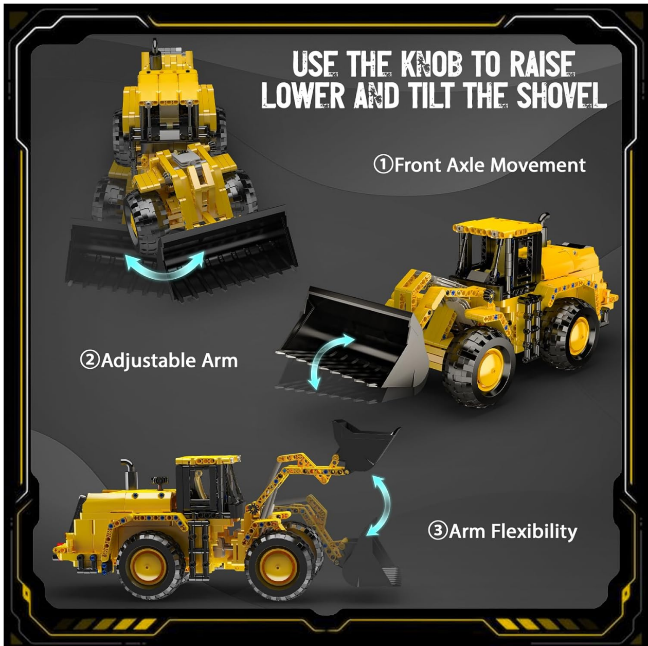
Illustration of the movable components: front axle, adjustable arm, and arm flexibility.