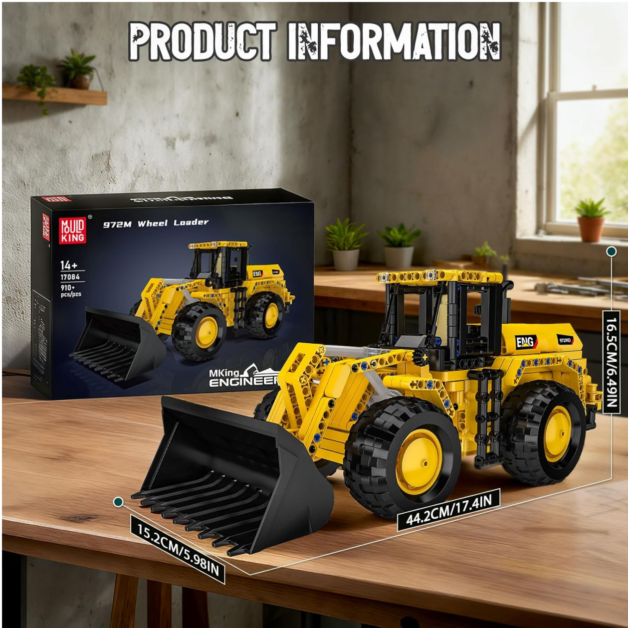
Visual representation of the model's dimensions.