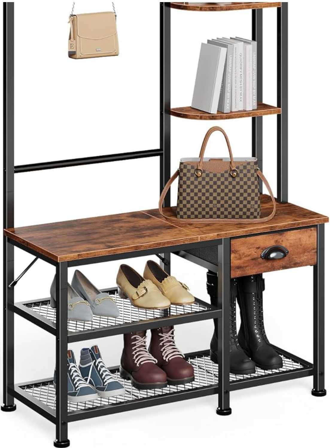
Image: The Furologee Coat Rack Hall Tree in a rustic brown finish, showcasing its various storage capabilities in an entryway setting.