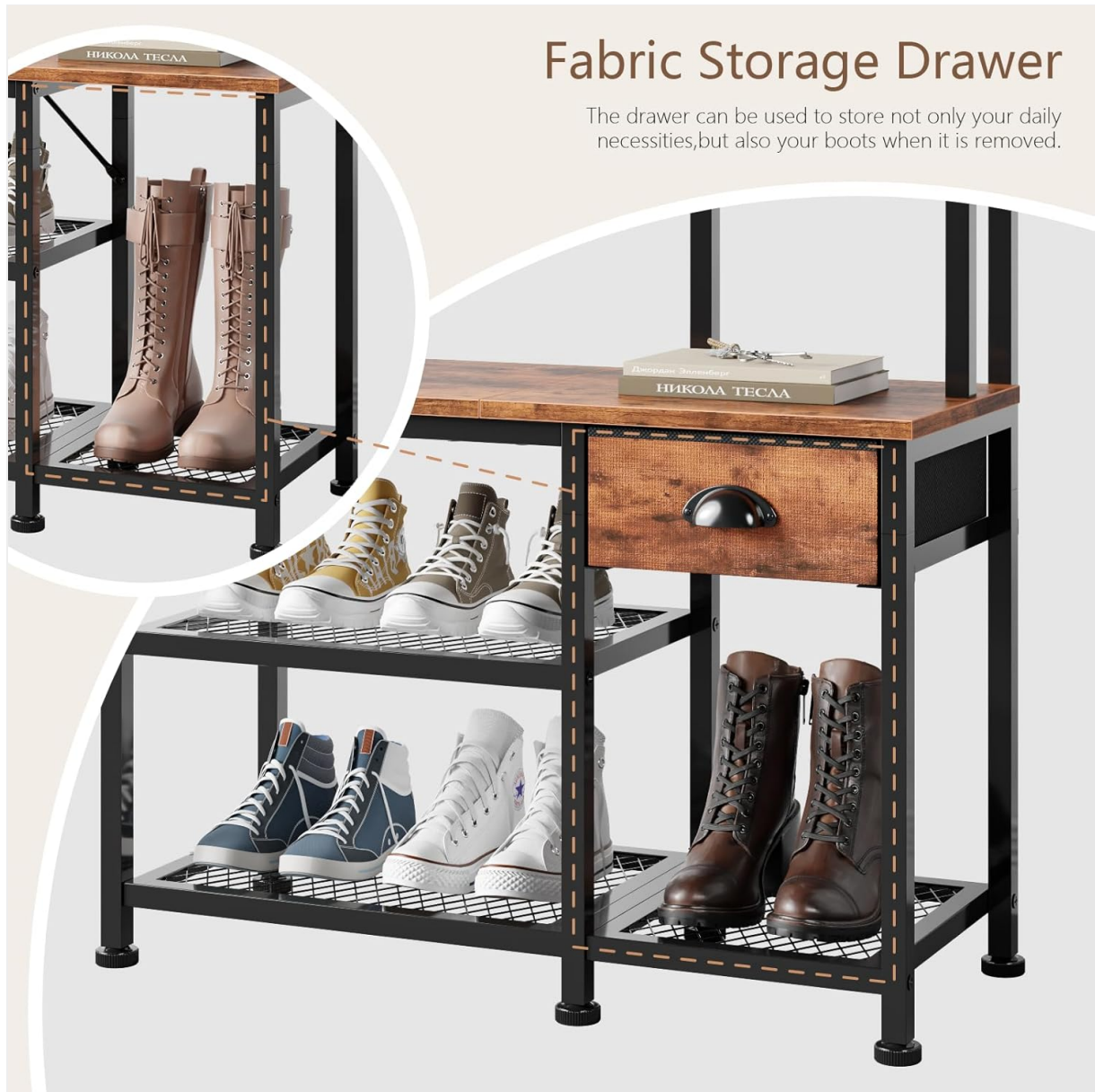
Image: A detailed view of the fabric storage drawer, demonstrating its use for daily necessities and the option to remove it for storing taller boots.

The drawer can be used to store not only your daily necessities, but also your boots when it is removed.