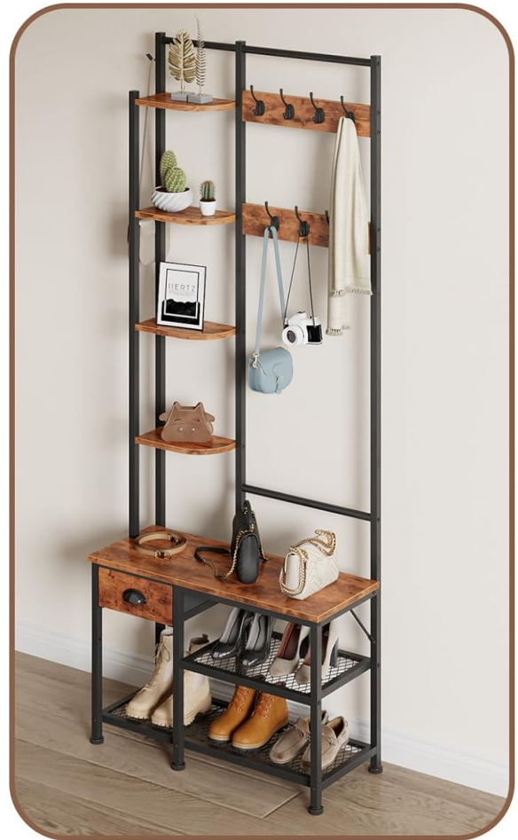
Image: This image illustrates the flexible installation options, allowing the side bracket with shelves and hooks to be installed on either the left or right side of the main unit to suit your preference and space.

The side bracket is installed on the left or right depending on your preference