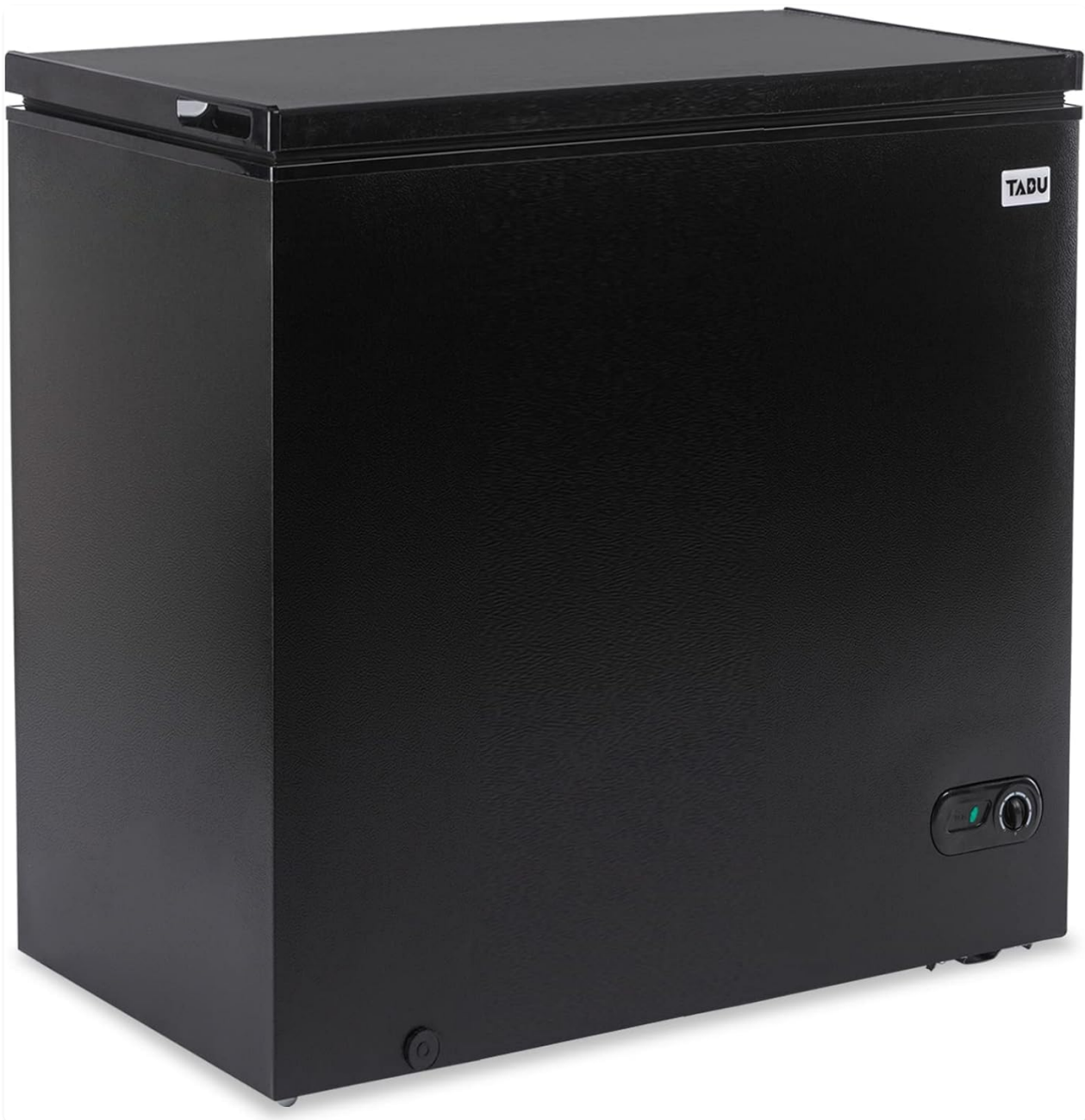
Figure 2.1: Exterior view of the TABU 12.0 Cu Ft Chest Deep Freezer.