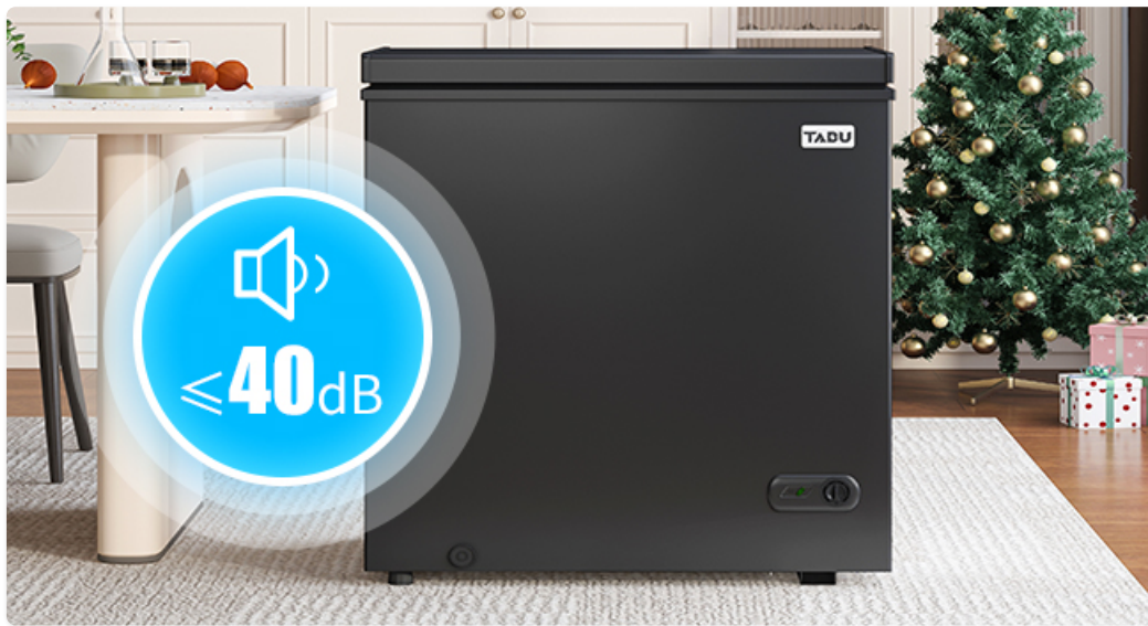
Figure 5.1: Low noise operation for a tranquil home environment.