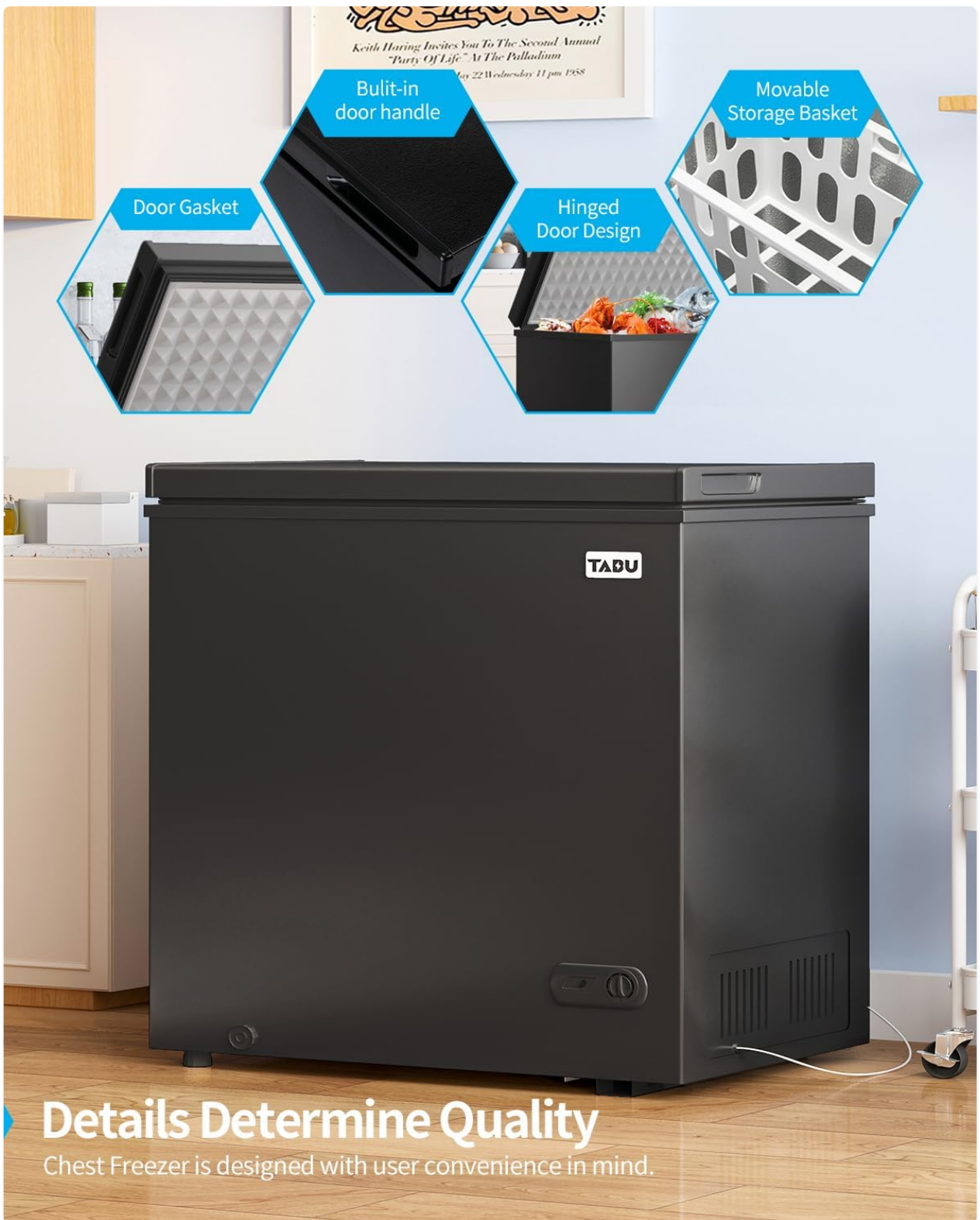
Figure 4.2: Removable storage basket for organizing items.