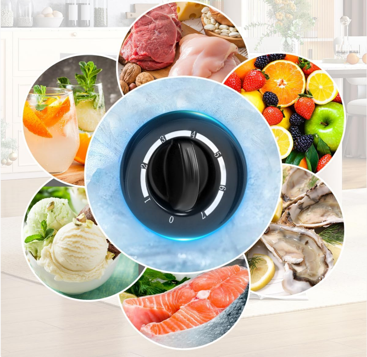
Figure 4.1: Adjustable 7-level temperature control dial.

7 Temperature Control Chest Freezer, the ultimate solution for all your cooling needs. From 7.6 °F to 6.8 °F