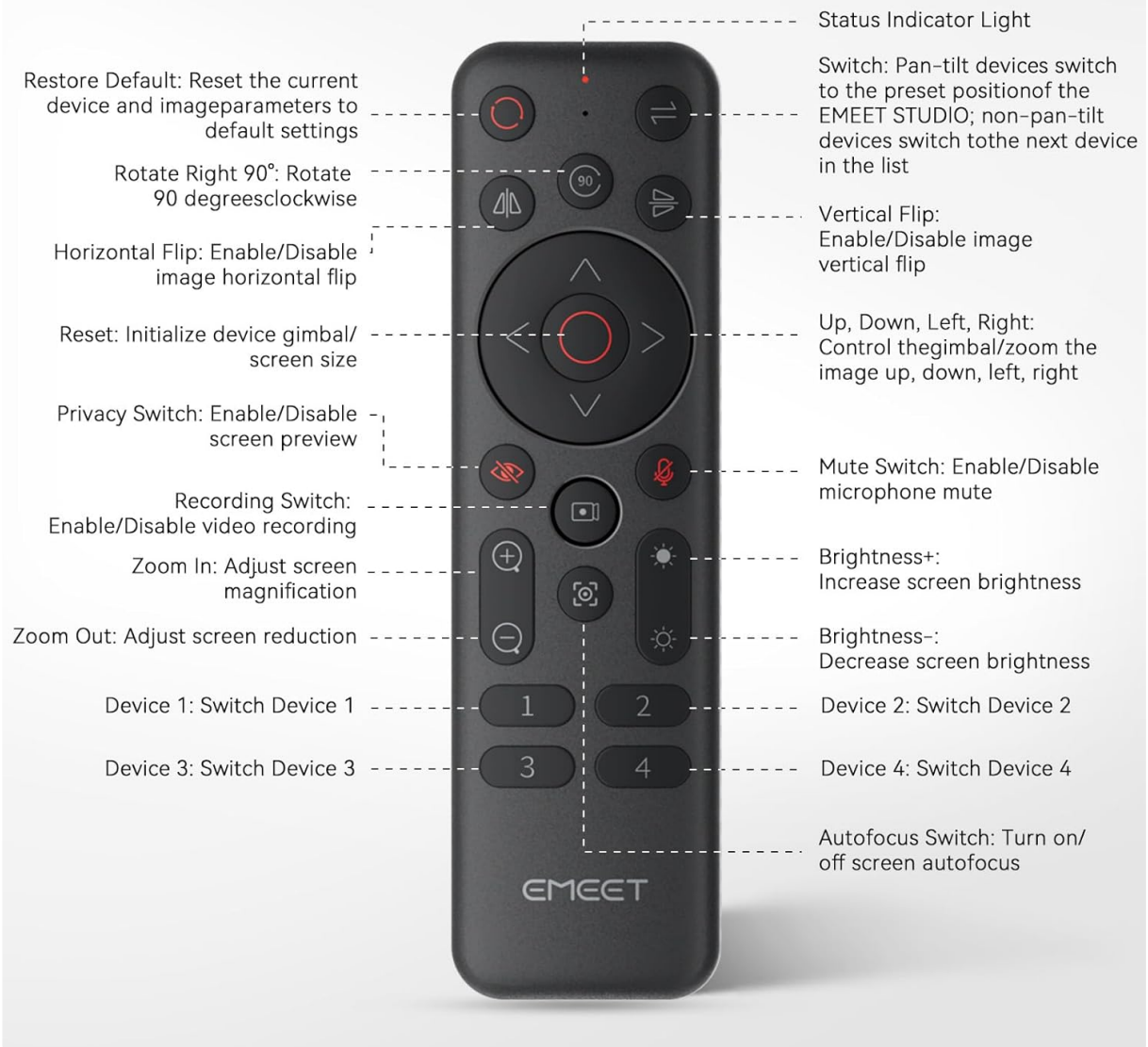
Image: EMEET Remote Control button layout and functions.