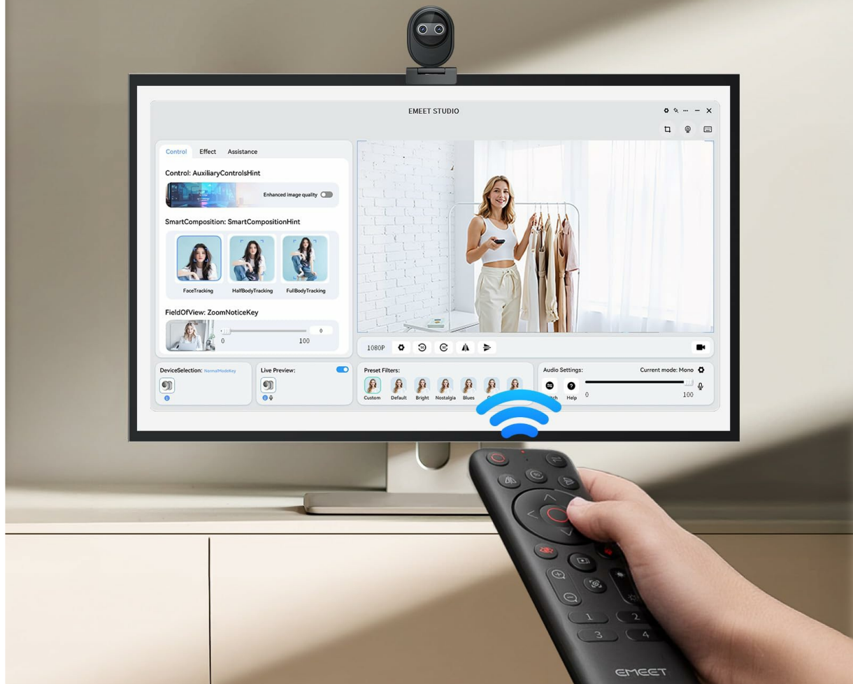
Remote Control for Piko