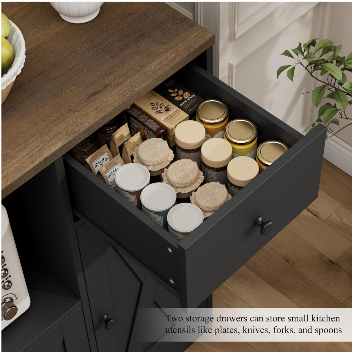
Figure 4: Example of drawer storage for small kitchen essentials.

Your browser does not support the video tag.