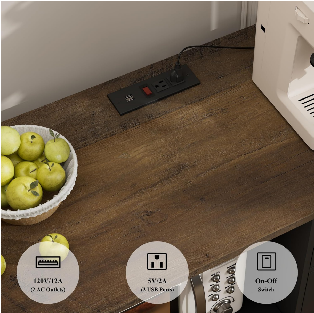
Figure 3: The integrated charging station for convenient power access.