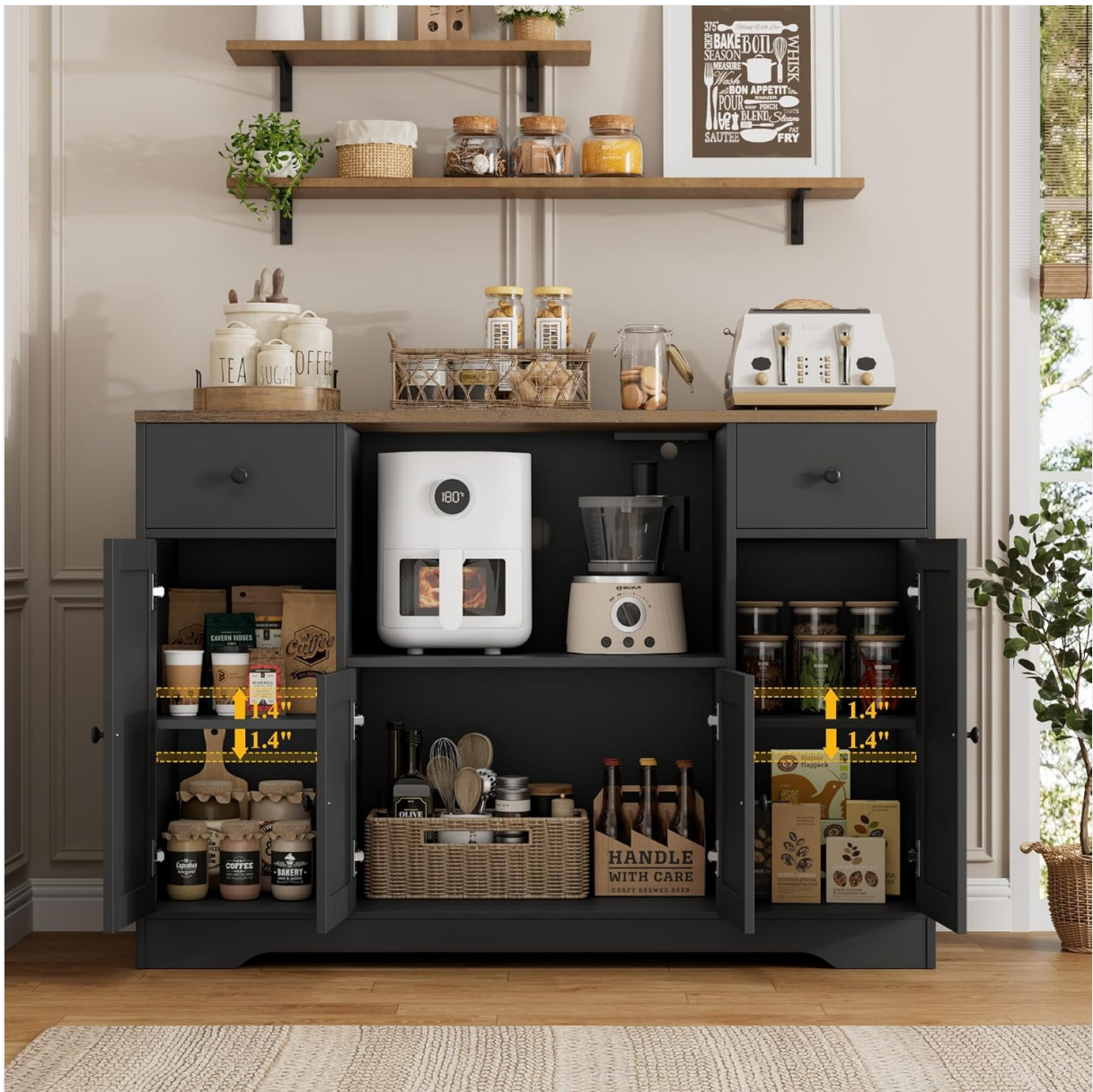
Figure 2: Interior view illustrating the adjustable shelf positions within the cabinet.