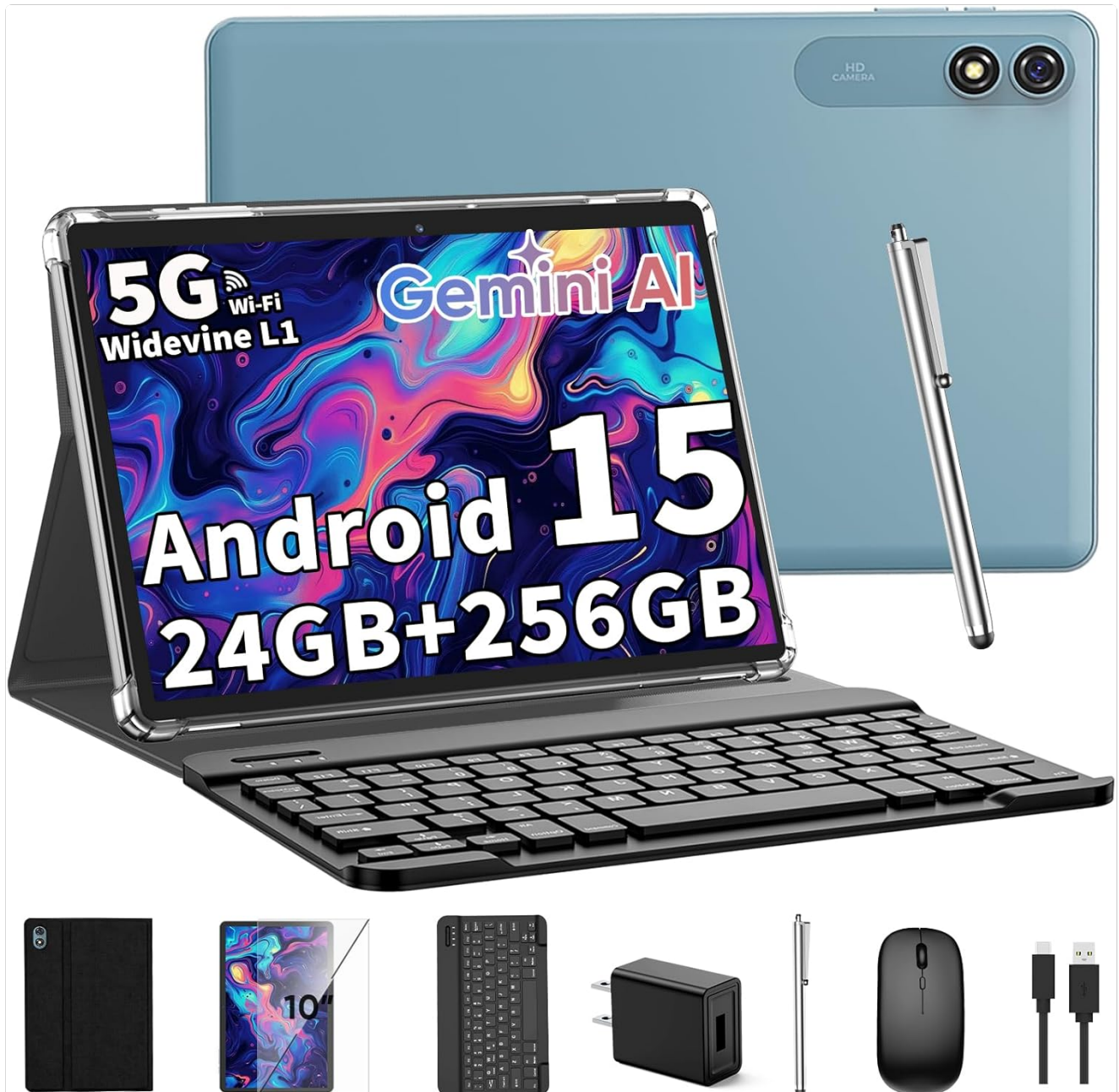
Figure 1.1: Relndoo T901 Tablet and included accessories.