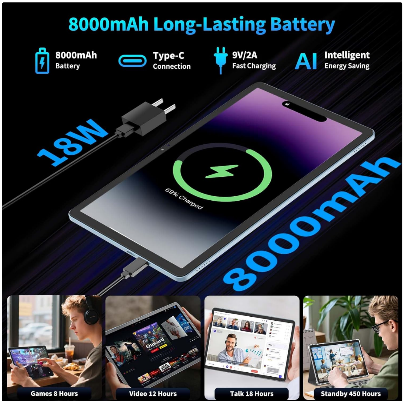
Figure 7.1: Battery features and estimated performance.