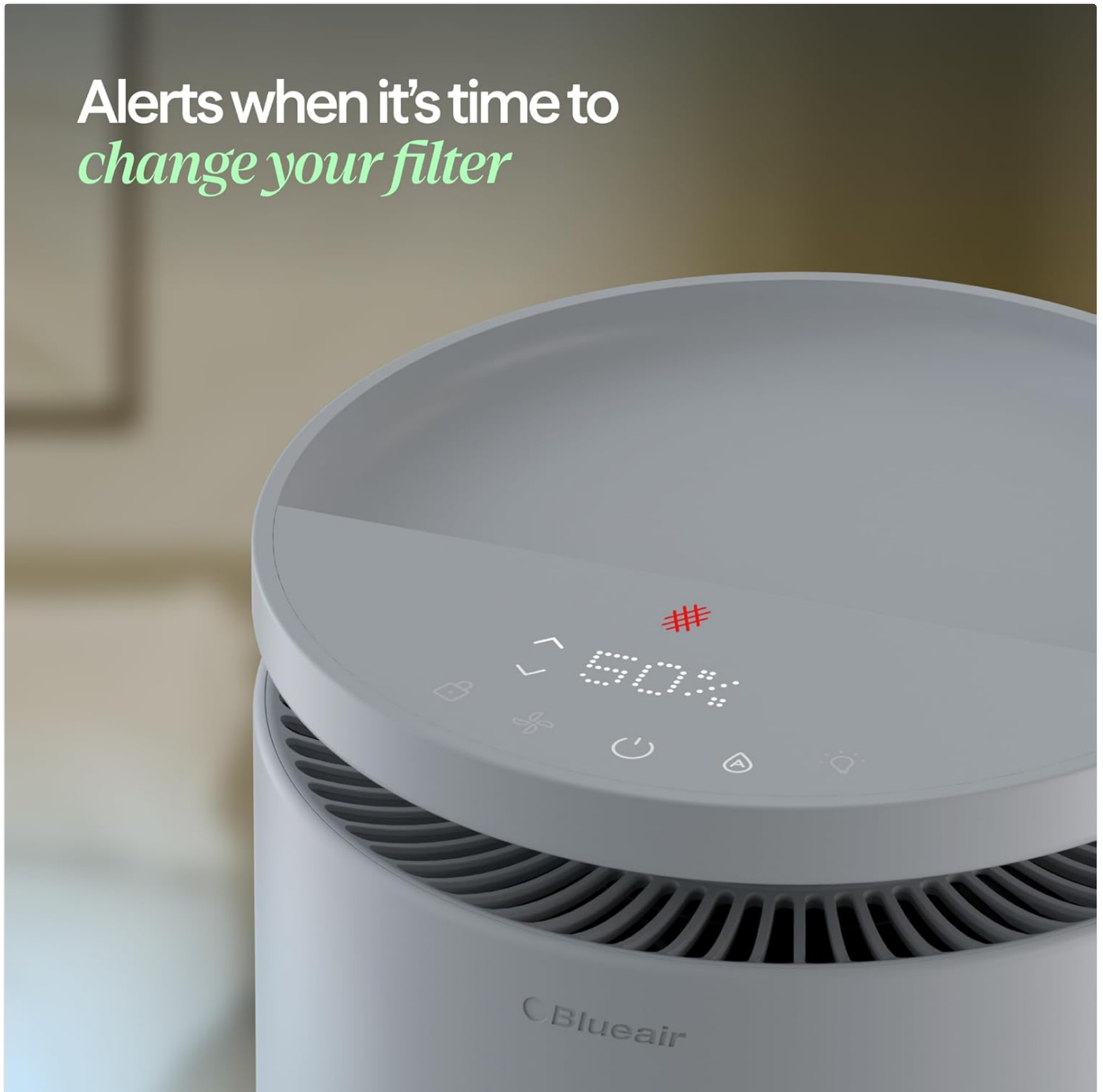
Image: The humidifier's control panel displaying an alert, indicating that it is time to change the filter for continued optimal performance.