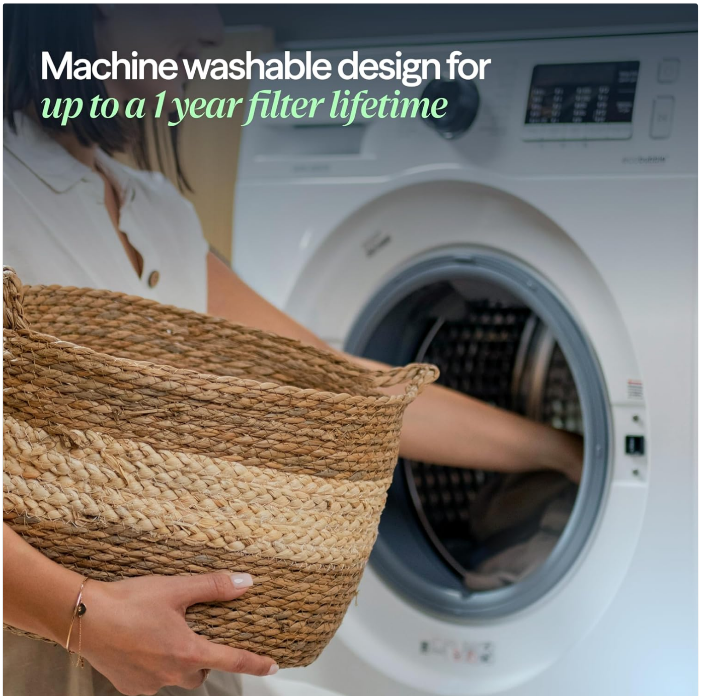
Image: A person placing the wick filter into a washing machine, illustrating its machine washable design for extended use.