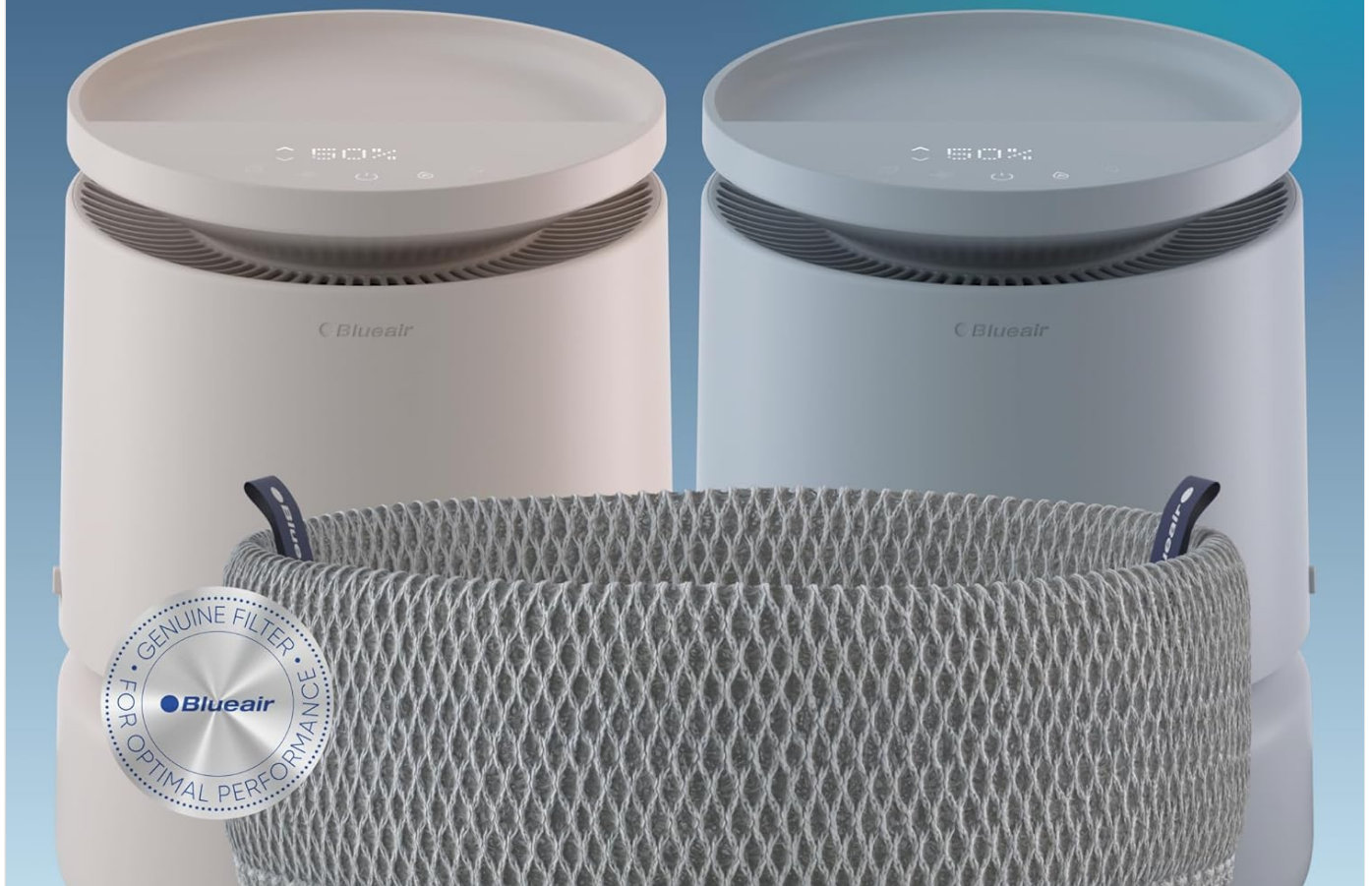
Image: The Blueair Replacement Wick Filter shown alongside two compatible Blueair humidifiers, illustrating its genuine design for optimal performance.