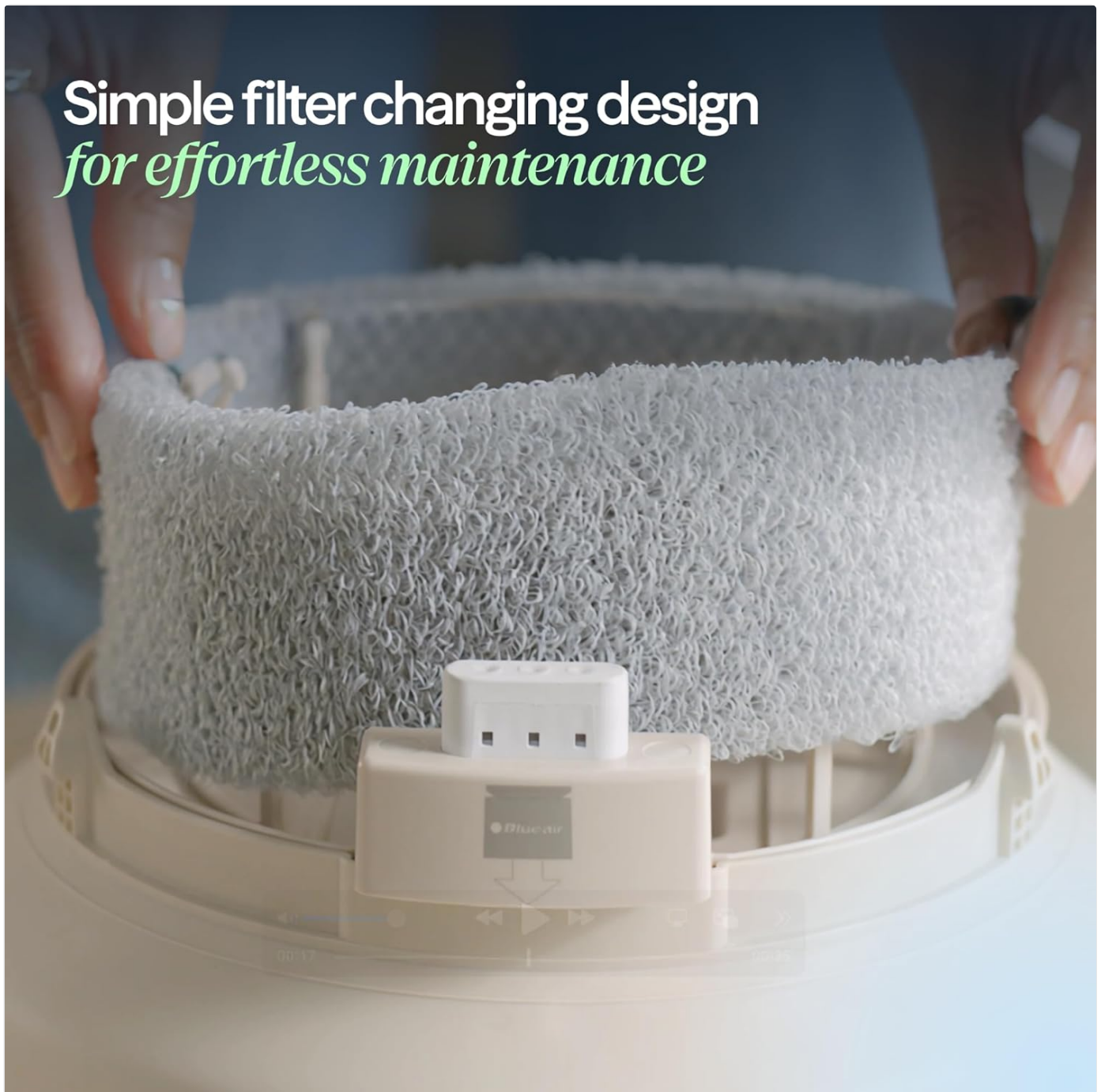
Image: Hands demonstrating the simple process of installing a new wick filter into the humidifier, highlighting the drop-in replacement design.

8. Power On: Plug in and power on your humidifier.