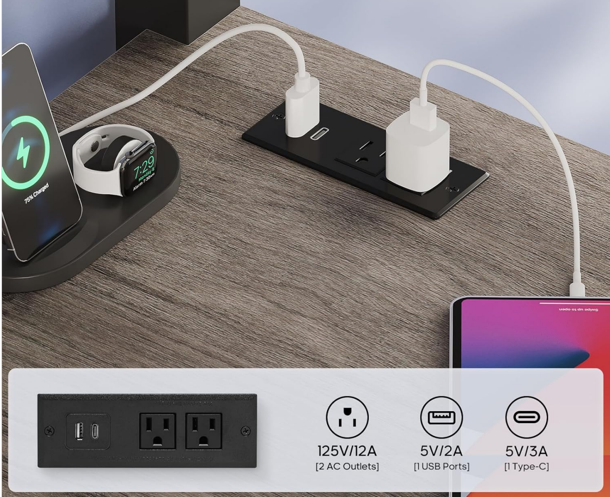
Image 5.2: Detailed view of the built-in charging station, showing the AC outlets, USB-A, and USB-C ports for electronic devices.