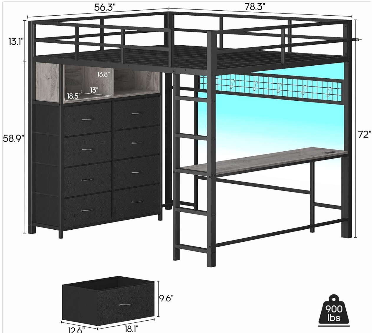
Image 4.1: Dimensional diagram of the loft bed, providing measurements for planning and assembly.

For detailed visual guidance, refer to the diagrams and step-by-step instructions provided in your physical assembly manual.