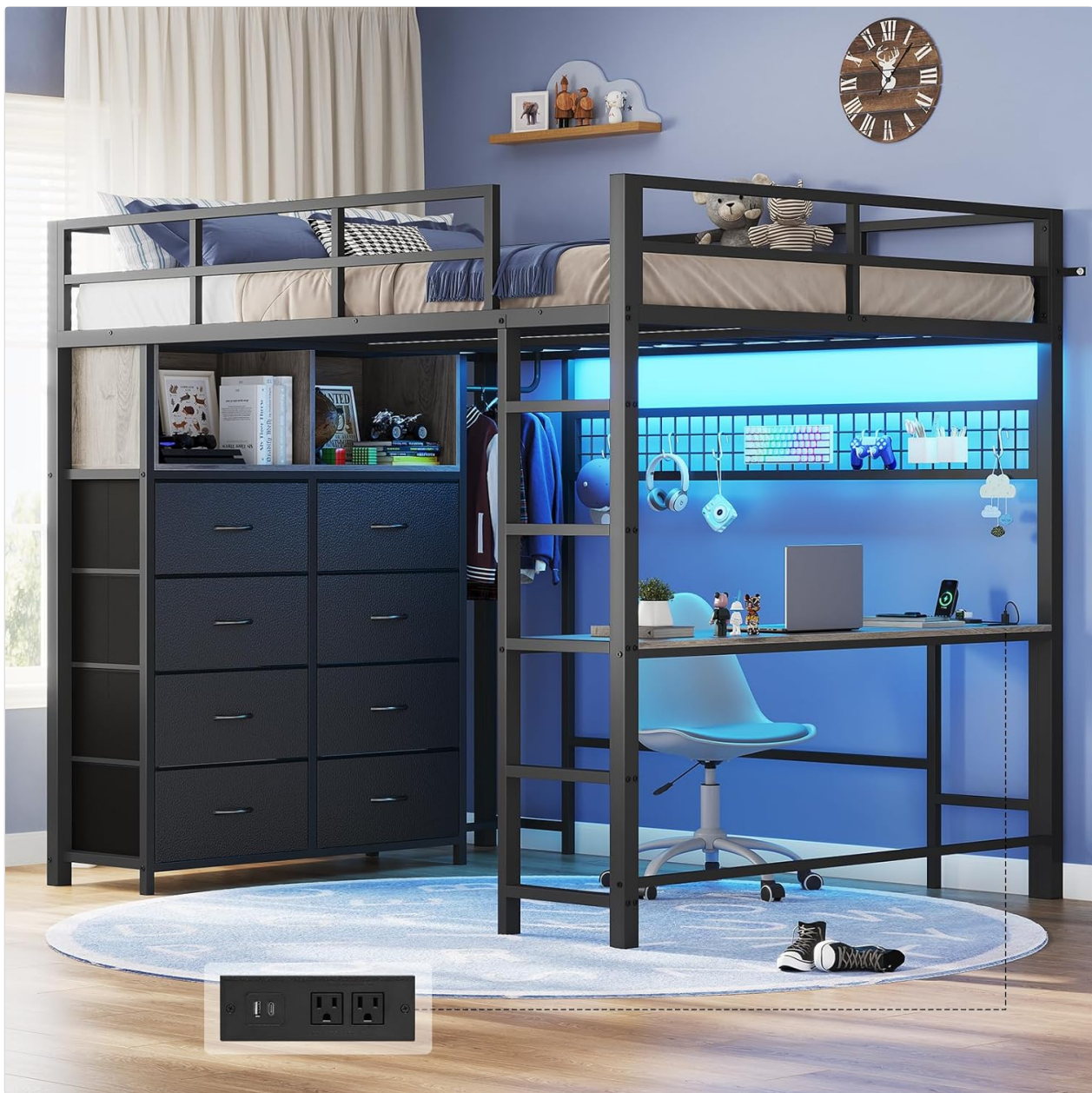
Image 1.1: Overview of the ADORNEVE Full Size Loft Bed, showcasing the integrated desk, storage drawers, and LED lighting.