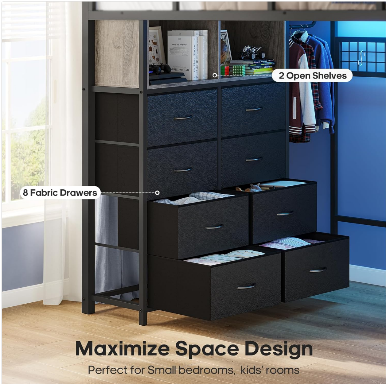
Image 3.1: Close-up view of the eight fabric drawers and two open shelves, illustrating the integrated storage solutions.