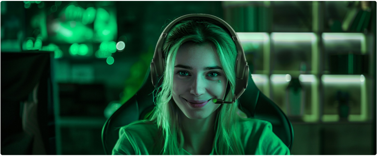
Image: A close-up of the headset's detachable, omni-directional microphone, emphasizing its Environmental Noise Cancellation (ENC) technology.