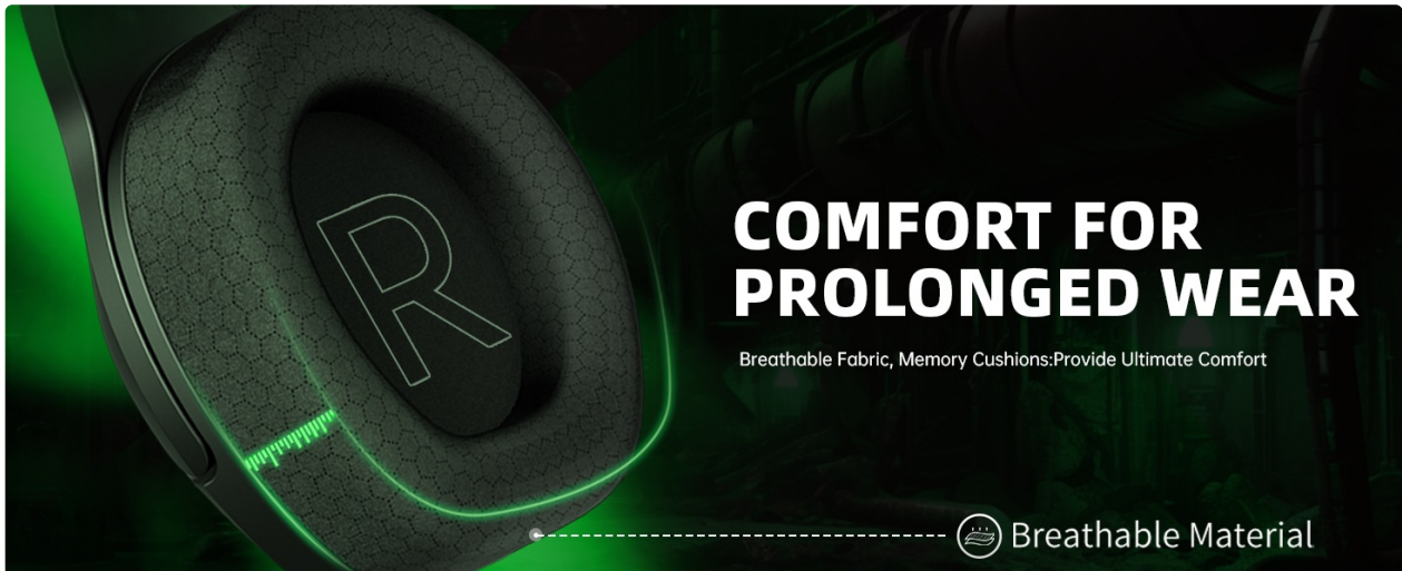
Image: A diagram highlighting the breathable memory materials, lightweight protective structure, and stretchable adjustable headband of the headset.