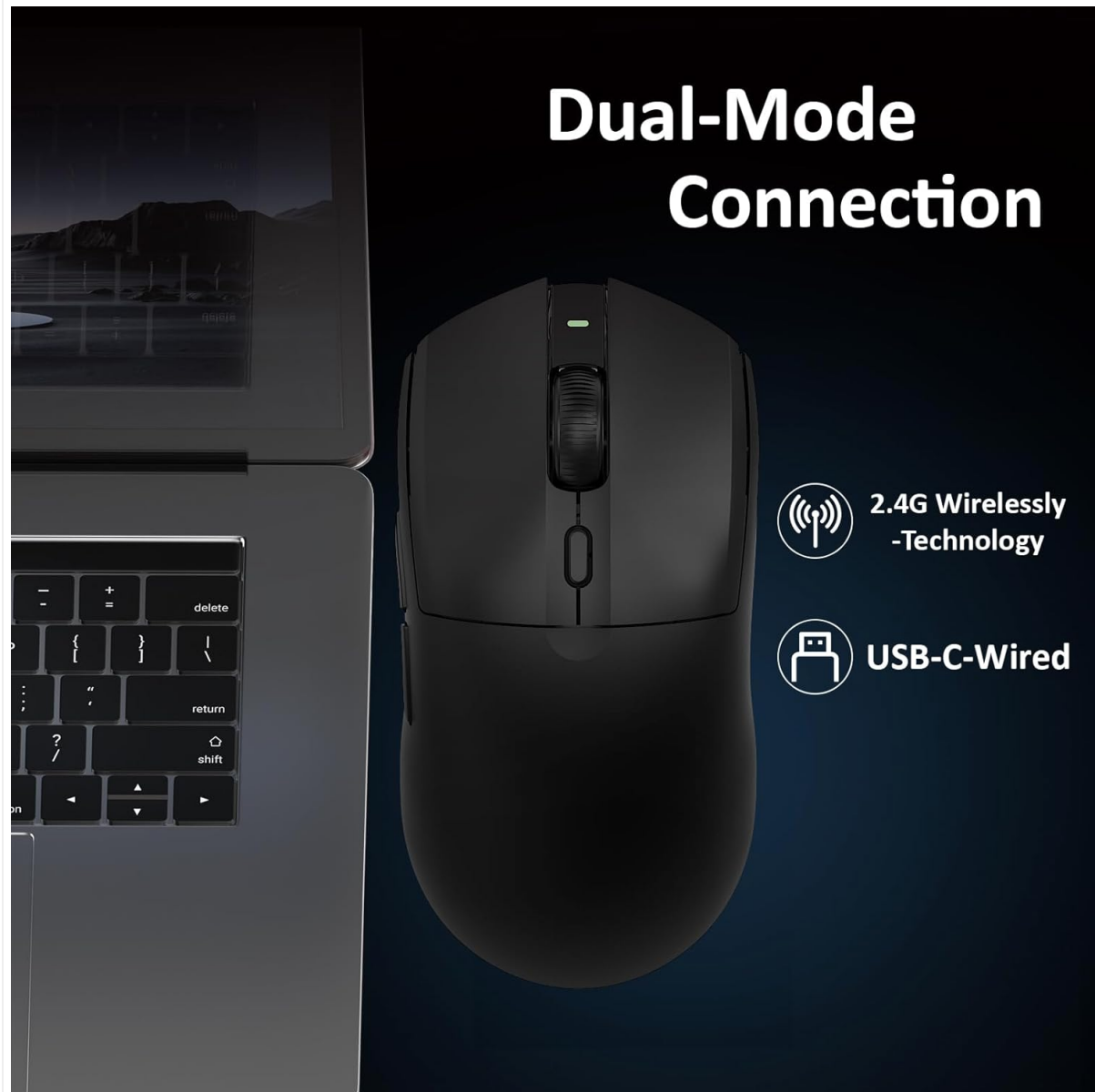
Image: A close-up of the AJAZZ AJ139PRO mouse connected to a laptop, illustrating both 2.4G wireless and USB-C wired connection options.