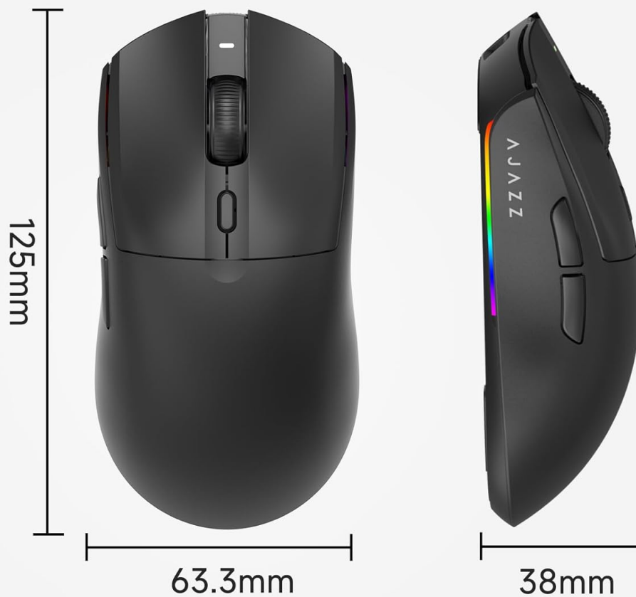
Image: Technical drawing showing the dimensions of the AJAZZ AJ139PRO mouse: 125mm length, 63.3mm width, and 38mm height.