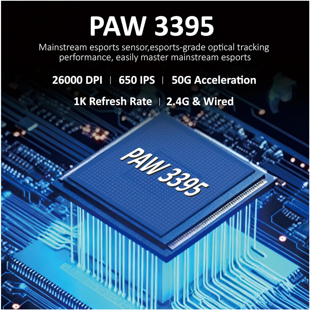
Image: A detailed view of the PAW3395 sensor, highlighting its esports-grade optical tracking performance with 26000 DPI, 650 IPS, and 50G acceleration.