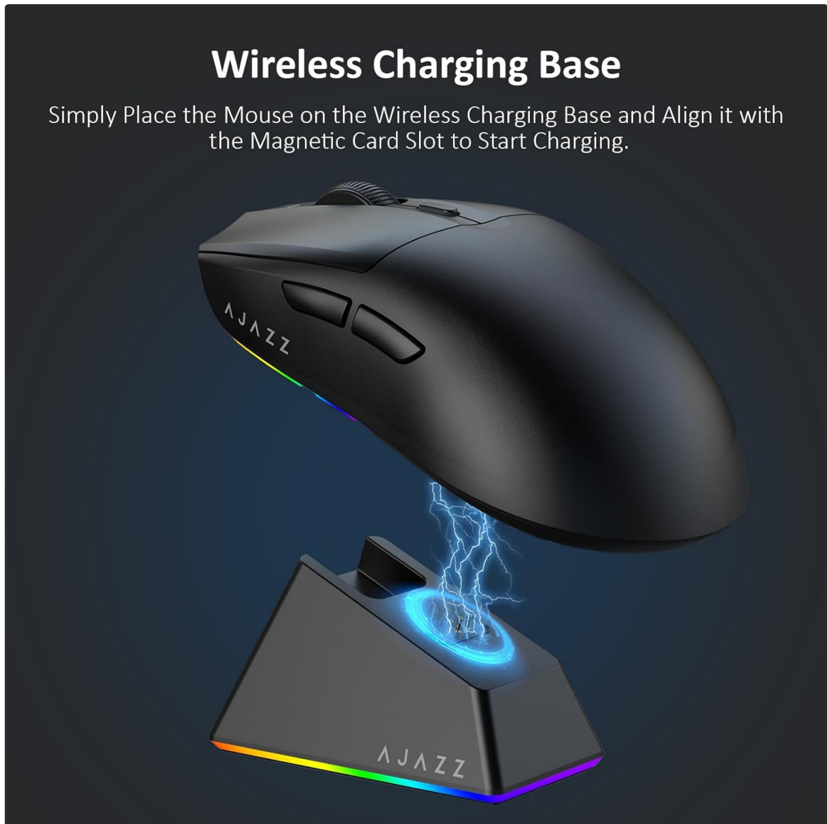
Figure 4.2: The mouse being charged on its wireless charging base.