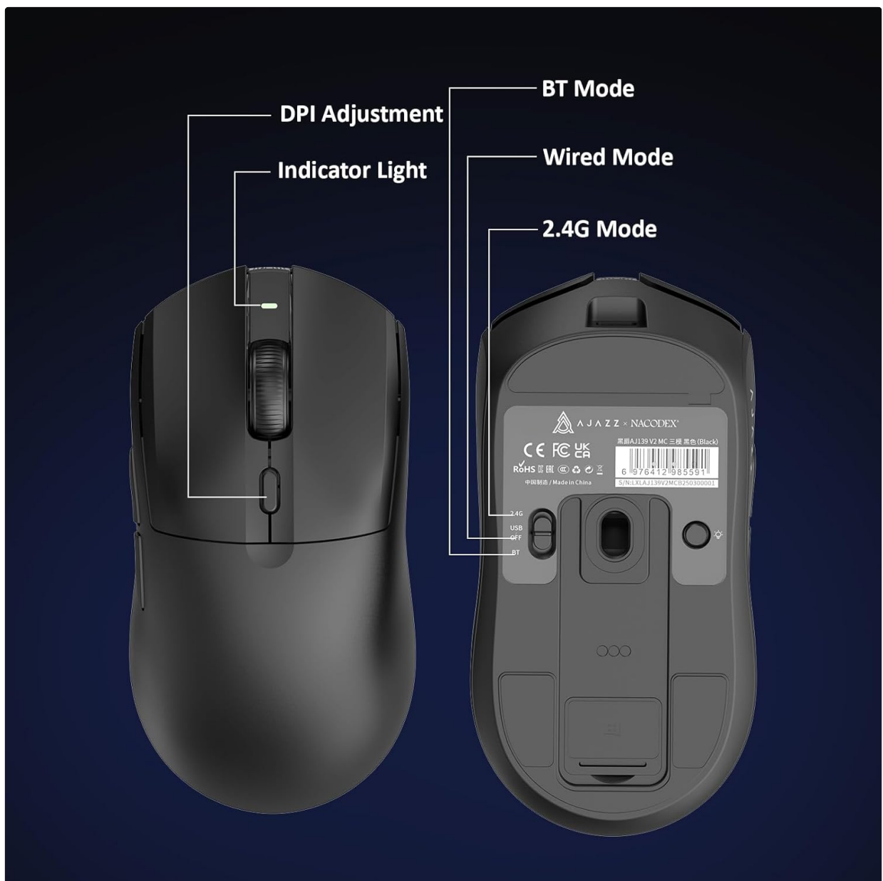
Figure 5.1: Location of the DPI adjustment button and connection mode switch on the mouse underside.