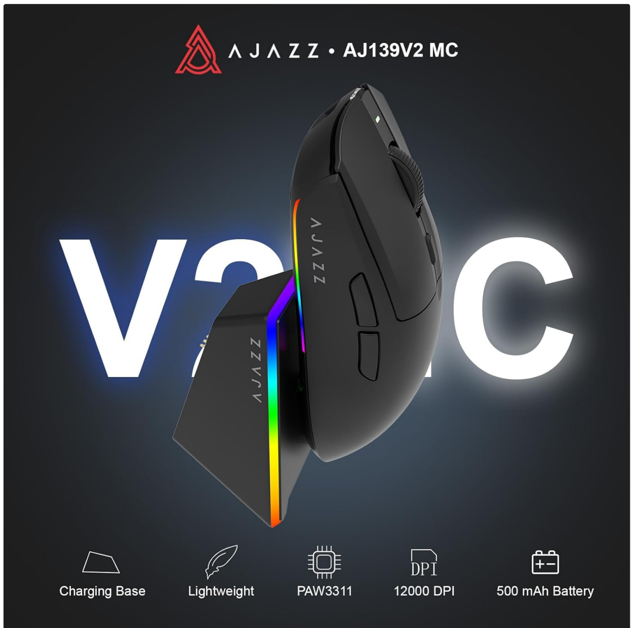
Figure 1.1: AJAZZ AJ139 V2 MC Gaming Mouse and Charging Dock.

Your browser does not support the video tag.