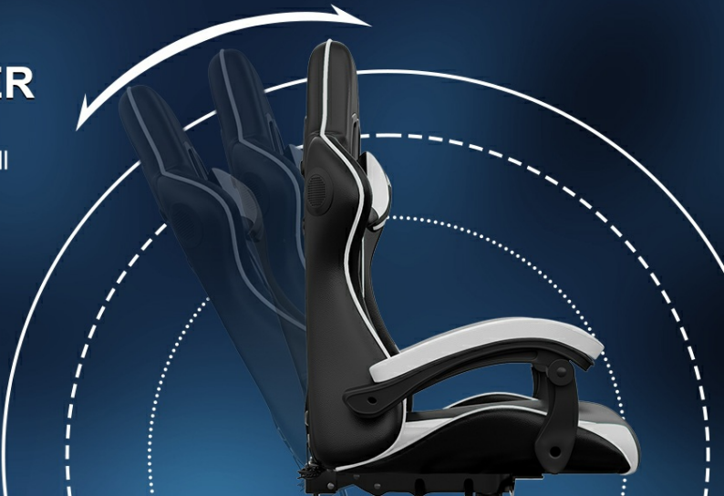
Figure 2: Overview of the bigzzia Gaming Chair design.