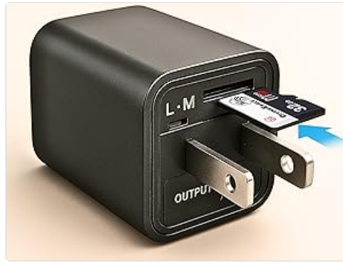
Figure 4.1: Inserting the microSD card into the camera's designated slot.