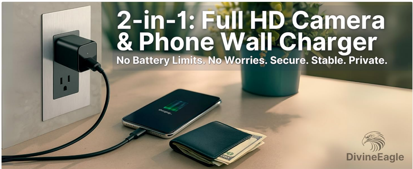
Figure 2.2: The camera functions as both a Full HD camera and a phone wall charger.