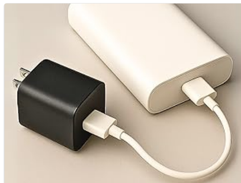
Figure 4.3: The camera can be powered by a portable power bank for flexible placement.