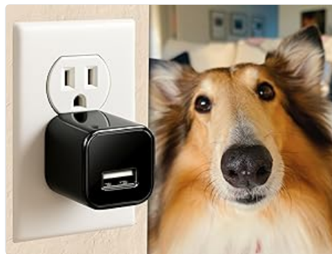
Figure 4.2: Plugging the camera into a power source to initiate recording.