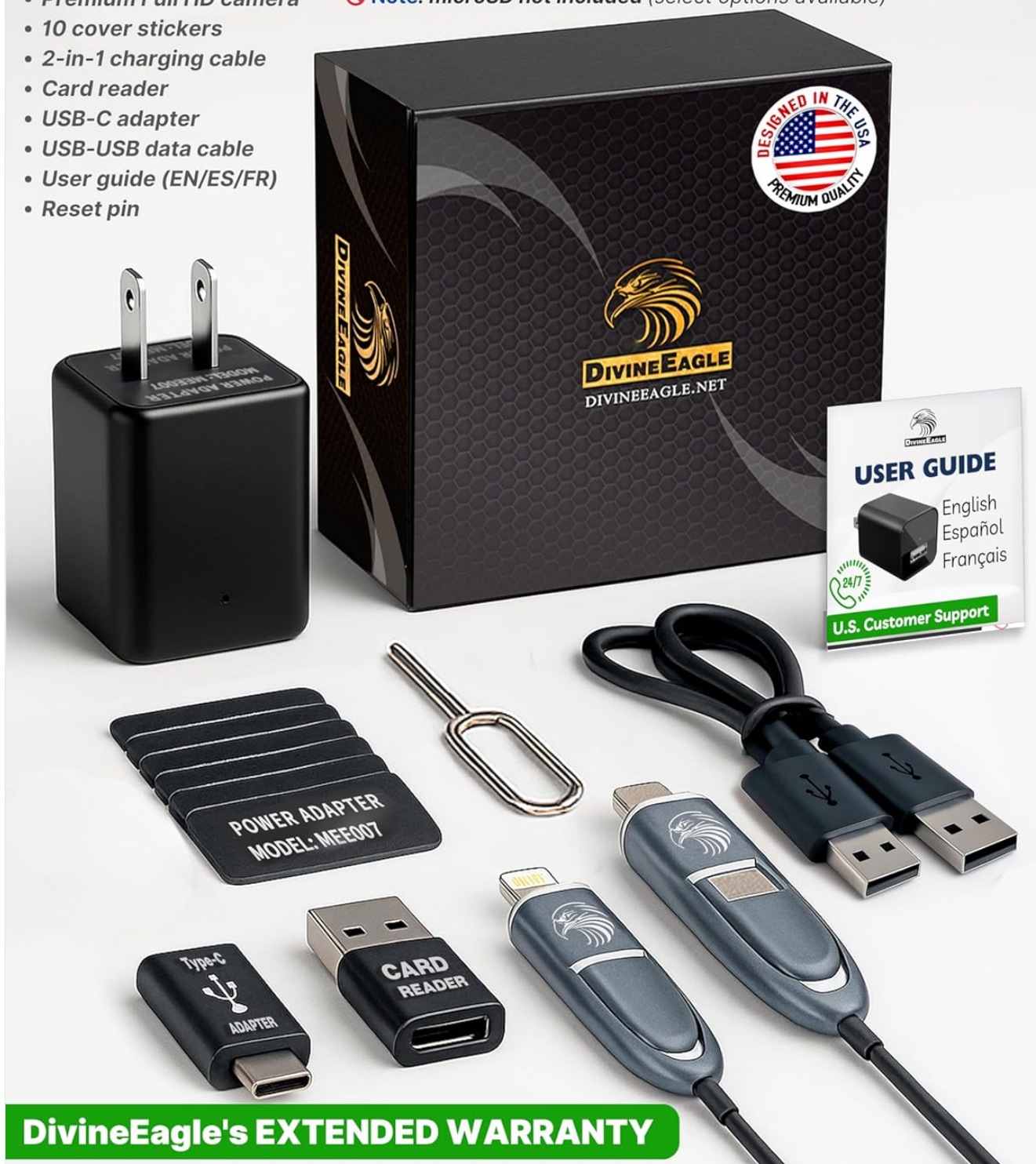
Figure 3.1: All items included in the DIVINEEAGLE MEE007s product package.