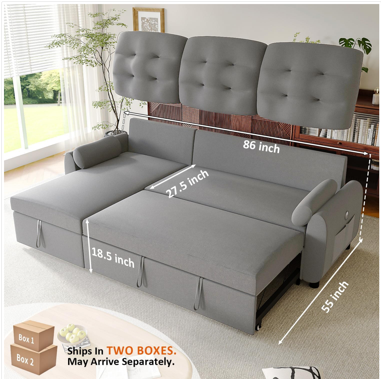
Image 3.1: Overview of the Ucloveria Sleeper Sofa Bed with key dimensions (86 inches width, 55 inches depth, 18.5 inches seat height, 27.5 inches chaise depth) and indicating that it ships in two boxes.