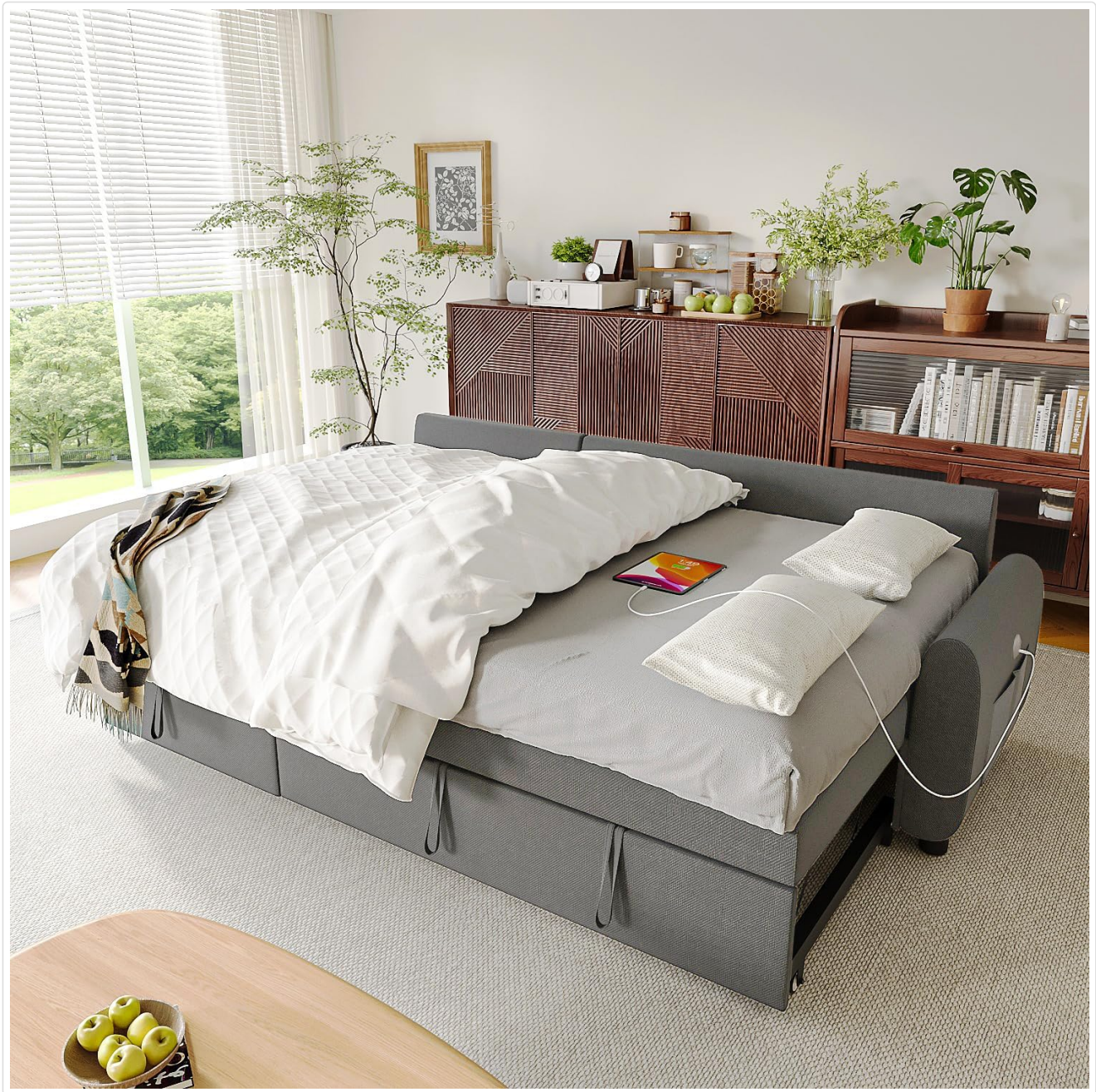
Image 4.1: The Ucloveria Sleeper Sofa Bed fully extended into a bed configuration, showing ample sleeping space.

To revert to sofa mode, push the extended section back into the sofa frame until it locks securely.