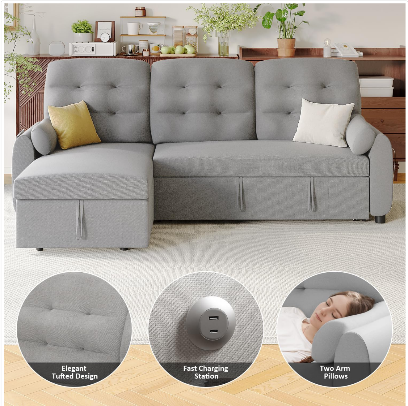
Image 4.5: Close-up view highlighting the integrated USB charging station and convenient side pockets on the armrest.