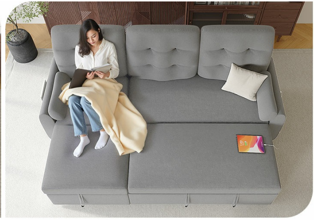
Sofa for Relaxation and Entertainment

Image 4.2: A visual demonstration of the one-step conversion process for the sleeper function and the hidden storage space within the chaise.