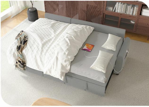
Optimal Comfort for Your Overnight Guests