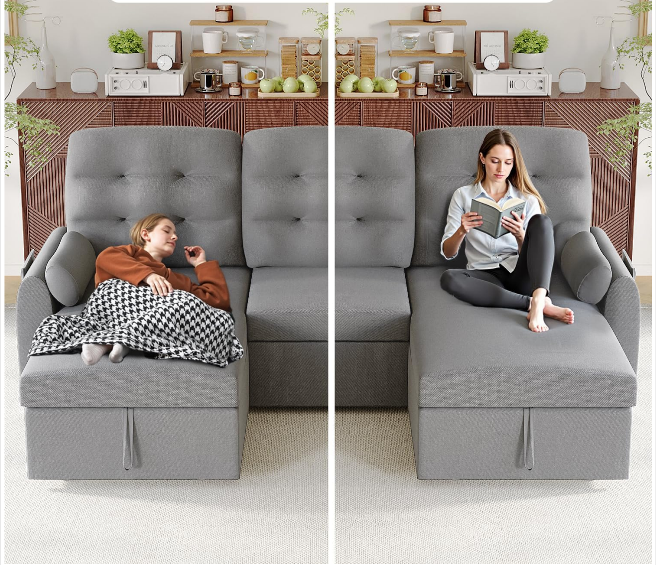
Image 4.3: The Ucloveria Sleeper Sofa Bed demonstrating the reversible chaise feature, allowing for flexible room arrangement.