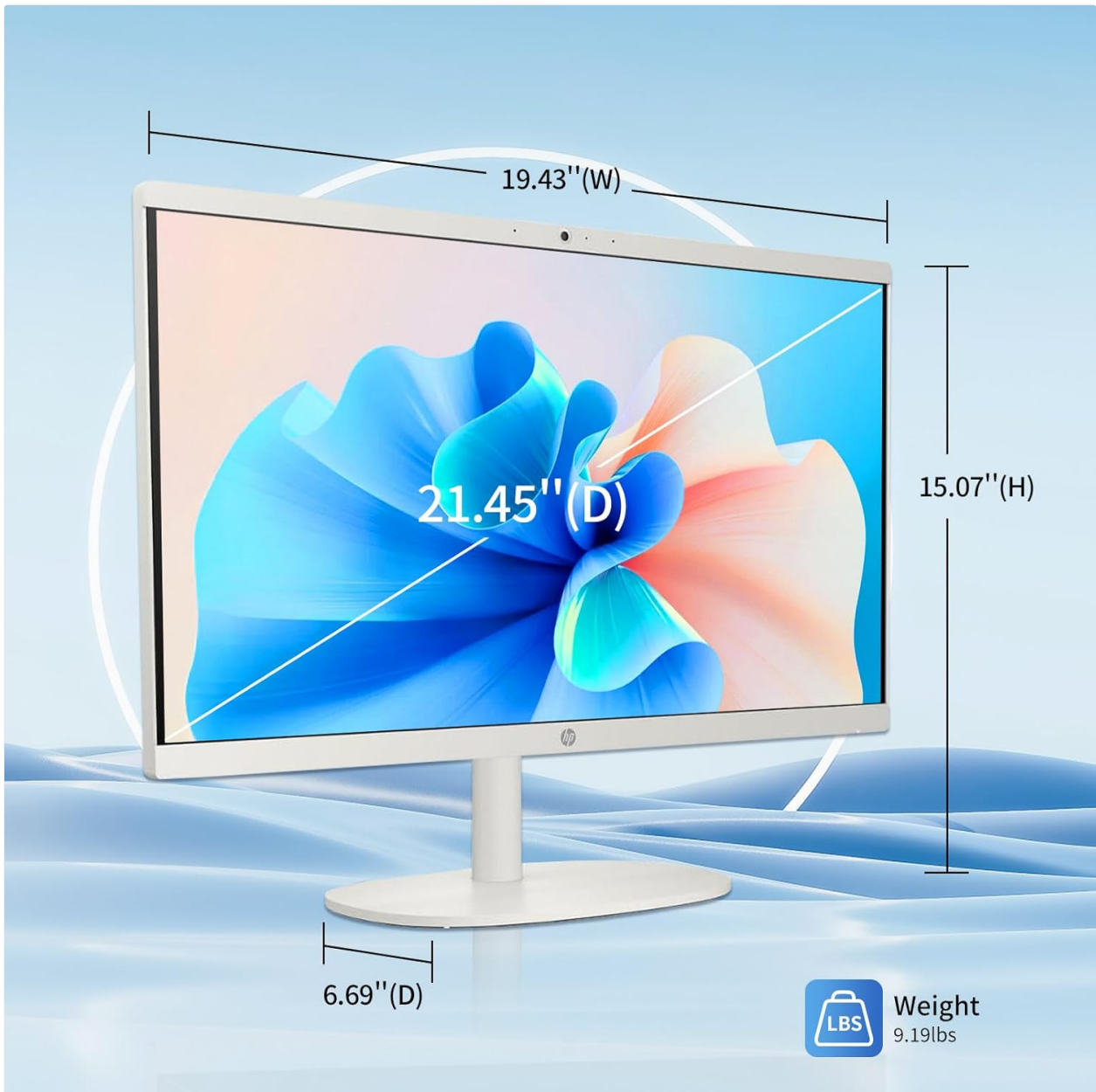
Image 7.1: Physical dimensions and weight of the HP All-in-One PC.