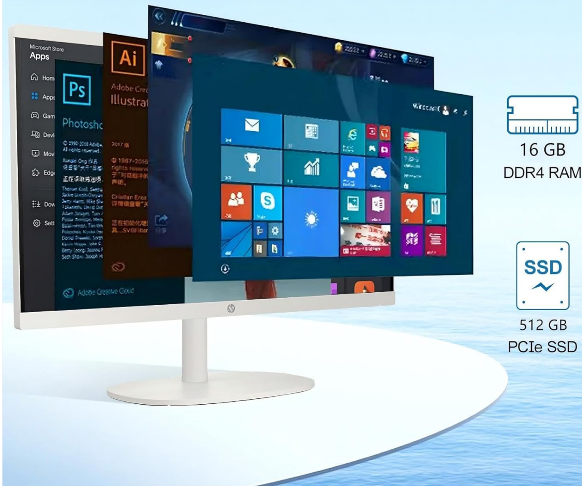
Image 4.1: Demonstrating multitasking capabilities with RAM and SSD.