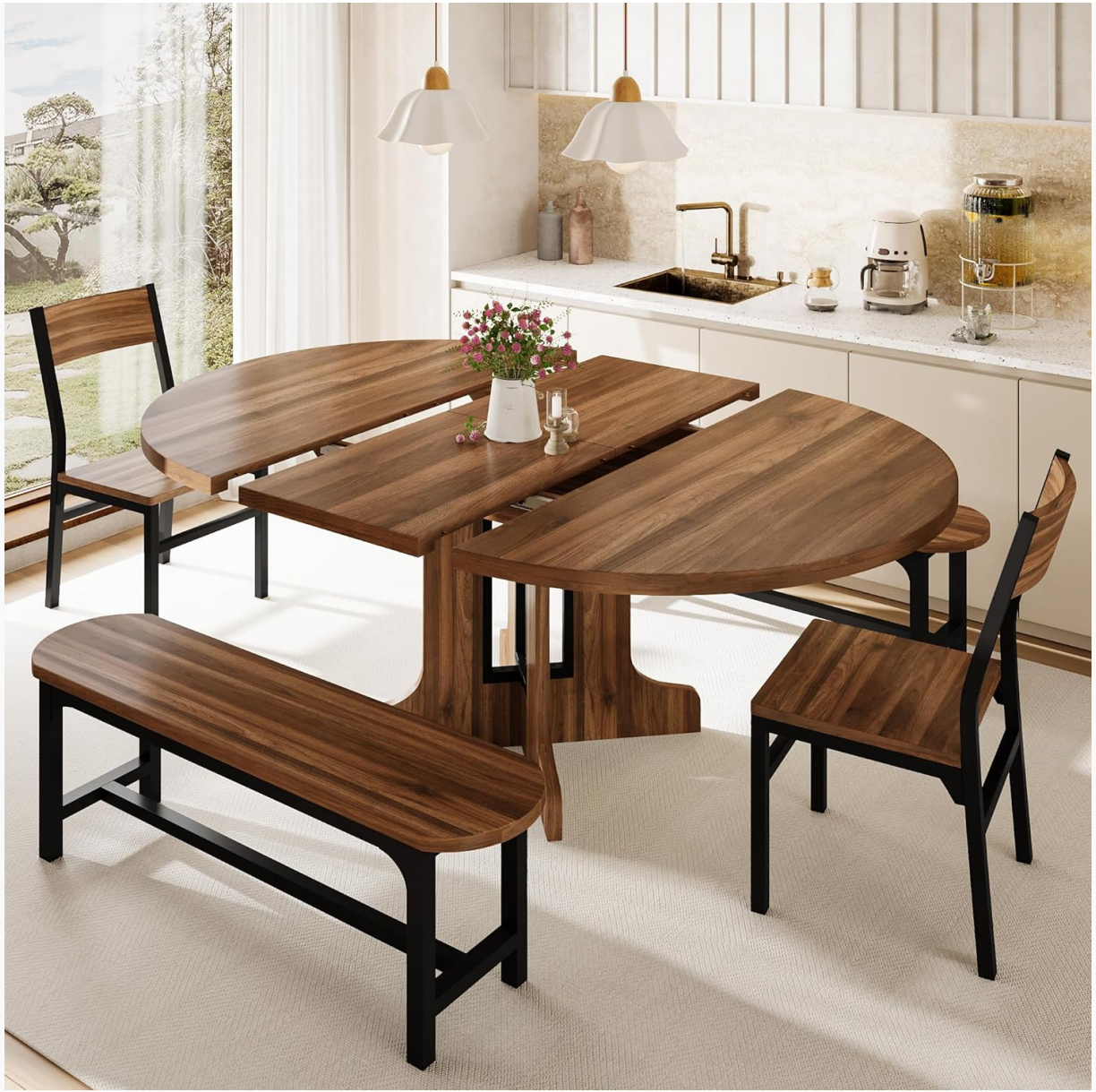
Image: The iPormis dining table fully extended, showcasing its oval shape and increased seating capacity.