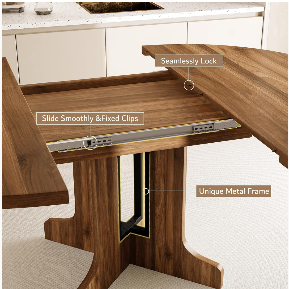
Image: A detailed view of the table's extension mechanism, highlighting the smooth-gliding slides, fixed clips for secure locking, and the unique metal frame supporting the extension.