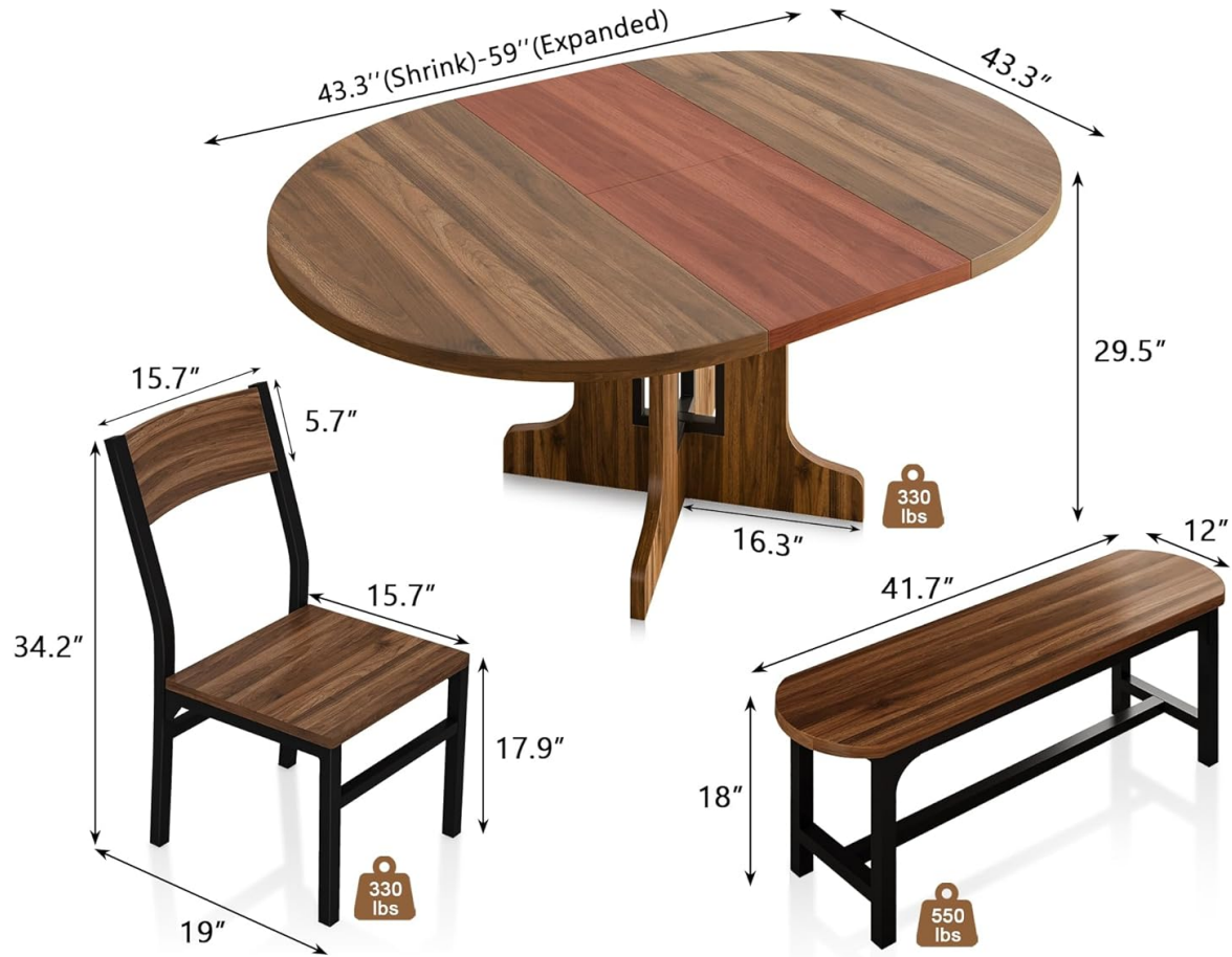
Image: A diagram illustrating the two-box shipping method for the dining set, with Box 1 containing the table and Box 2 containing the chairs and benches. Key dimensions for the table, chair, and bench are also provided.