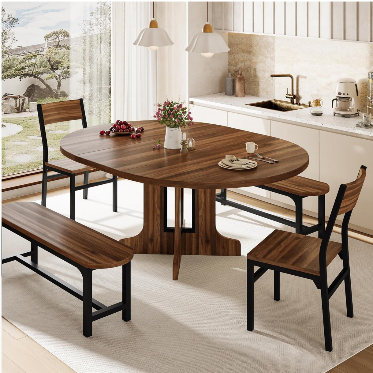
Image: The iPormis 5-Piece Extendable Dining Table Set, featuring a walnut-finished oval table, two chairs, and two benches, arranged in a modern kitchen environment.