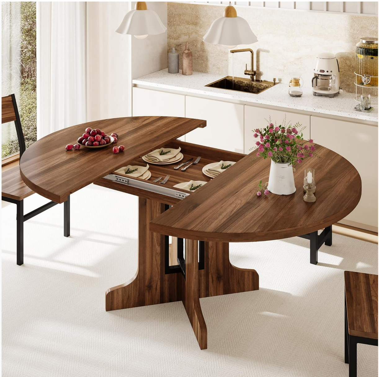
Image: The dining table with its central extension panel removed, exposing the internal storage compartment designed to hold the panel when not in use.