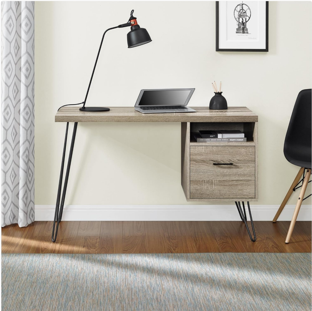
Image 1.1: The GDFStudio Modern Computer Desk, showcasing its design and functionality in a typical home office environment.