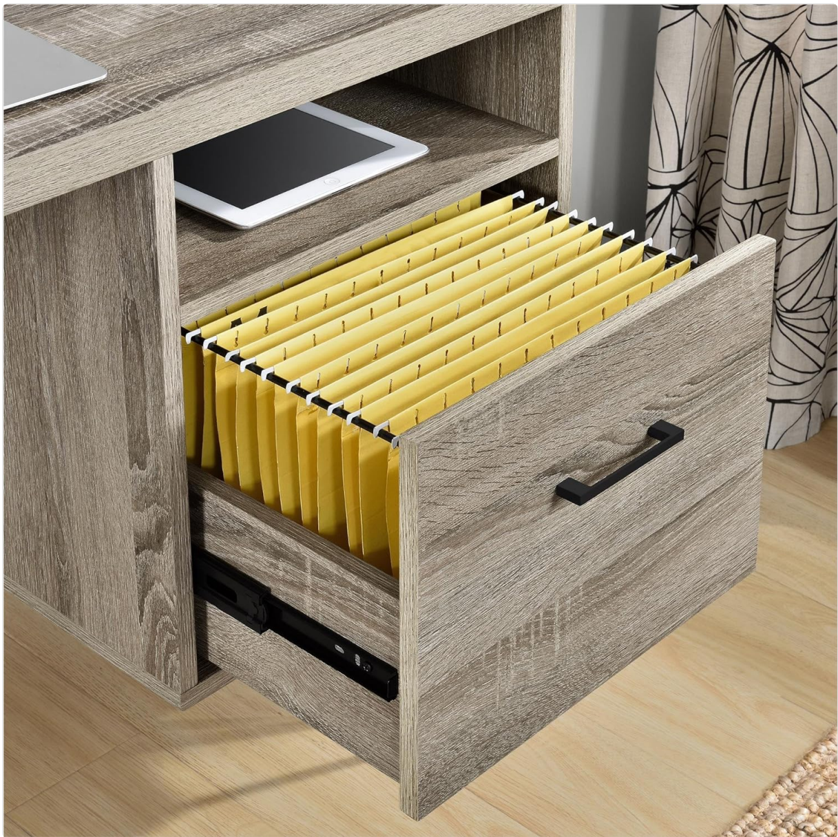
Image 3.1: The desk's storage drawer, designed to accommodate letter-sized files for efficient organization.