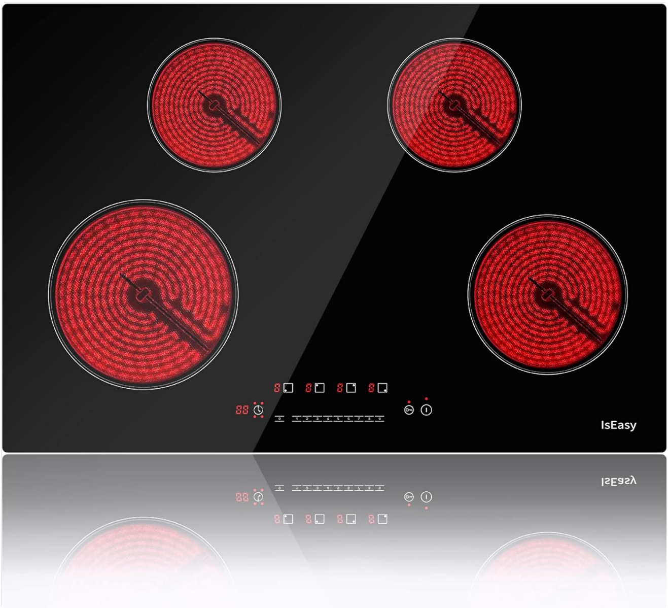
Figure 2.2: Top view of the IsEasy Electric Cooktop, showing the four radiant heating elements and the central touch control panel.