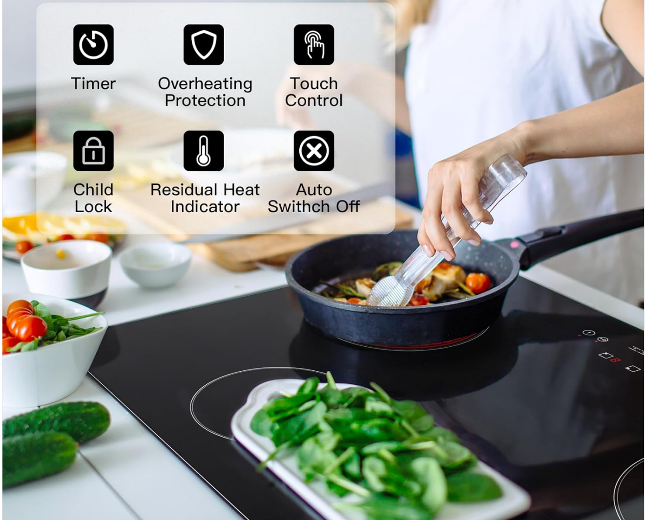
Figure 2.1: Overview of key features including safety and control functions.