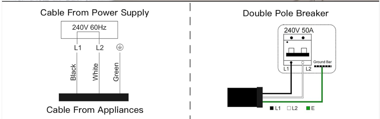
Figure 4.2: Electrical wiring diagram for the cooktop.