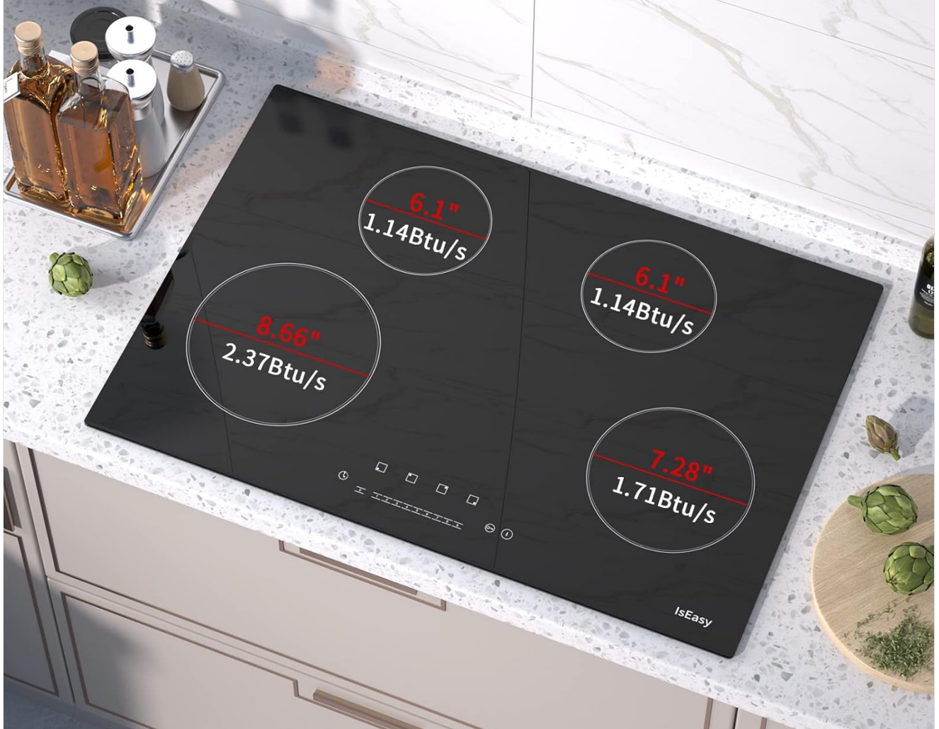
Figure 2.3: Power ratings for each of the four burners.