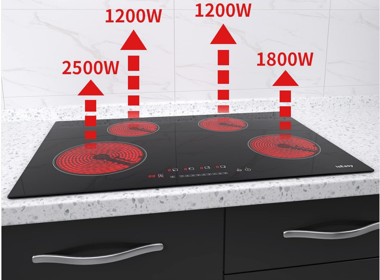
Figure 2.4: Approximate diameters of the heating elements.

Top Left Burner: 1200W, approx. 6.1 inches diameter