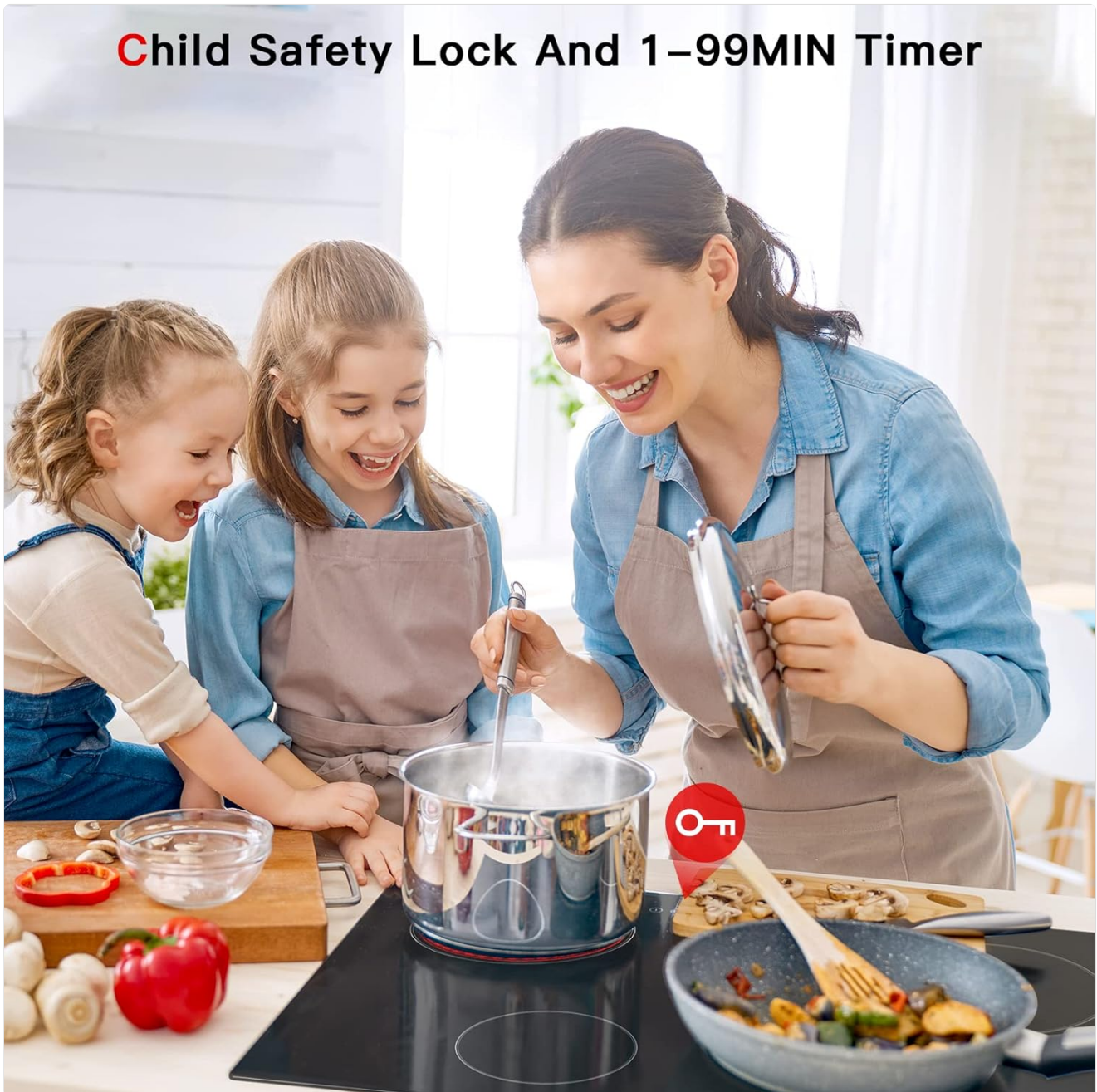
Figure 5.1: Child Safety Lock and Timer features in use.